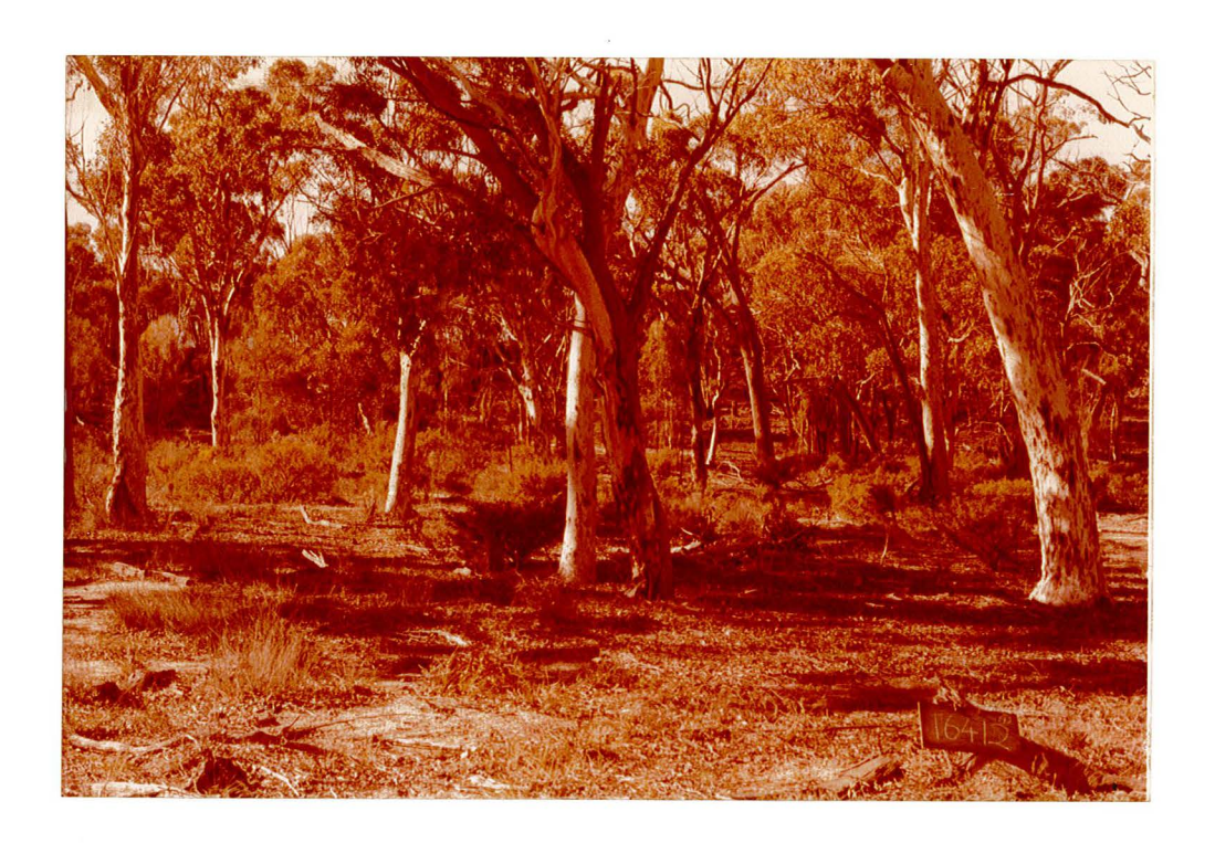
Plate 1. Reserve 16412 showing Wandoo woodland with understorey of Gastrolobium and Hypocalymma.