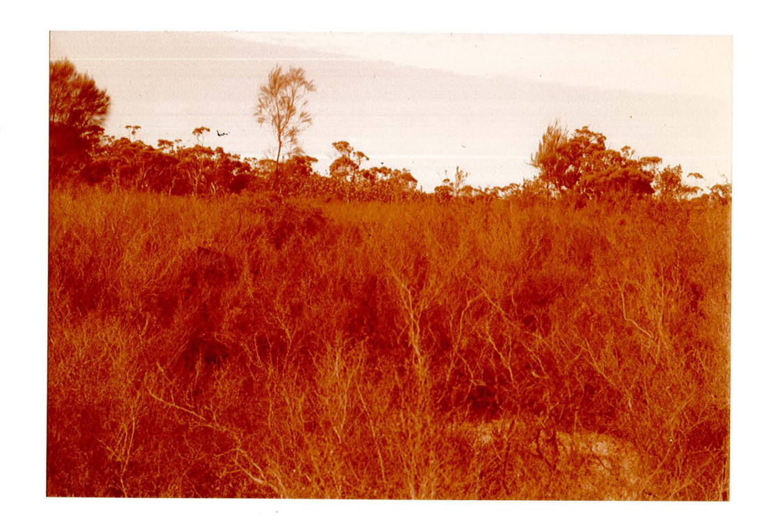
Plate 2. <u>Leptospermum erubescens</u> heath. Note clump of <u>Eucalyptus</u> macrocarpa in the distance.