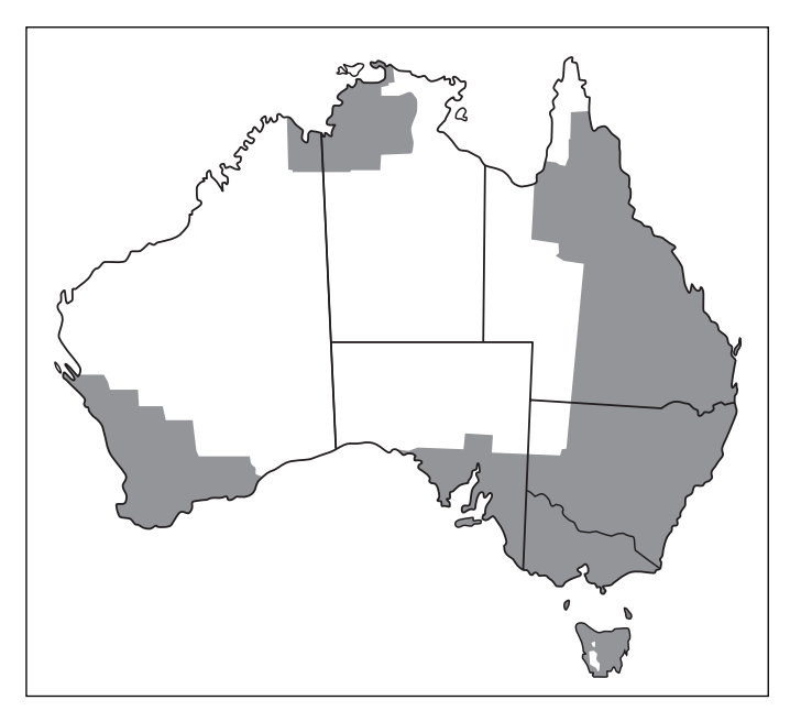
Figure 3. The intensive land-use zone (after Graetz et al. 1995), which covers approximately 40% of Australia, is the region where most broadscale clearing has and is occurring.

et al. 1999). Interestingly, Project UME28 (Cary and Williams 2000), a study of the perceptions of native vegetation in urban and rural residents, found that the association between native vegetation and pest plants and animals was relatively weak. However, the researchers stressed the importance of assessing these results in the context of studies that overtly measure concern for pest plants and animals, where landholders often consider pest plants and animals to be a problem. At least one of these studies (Miles et al. 1998) found that concern over pest animals was balanced out by the presence in native vegetation of native animals that helped control pests.