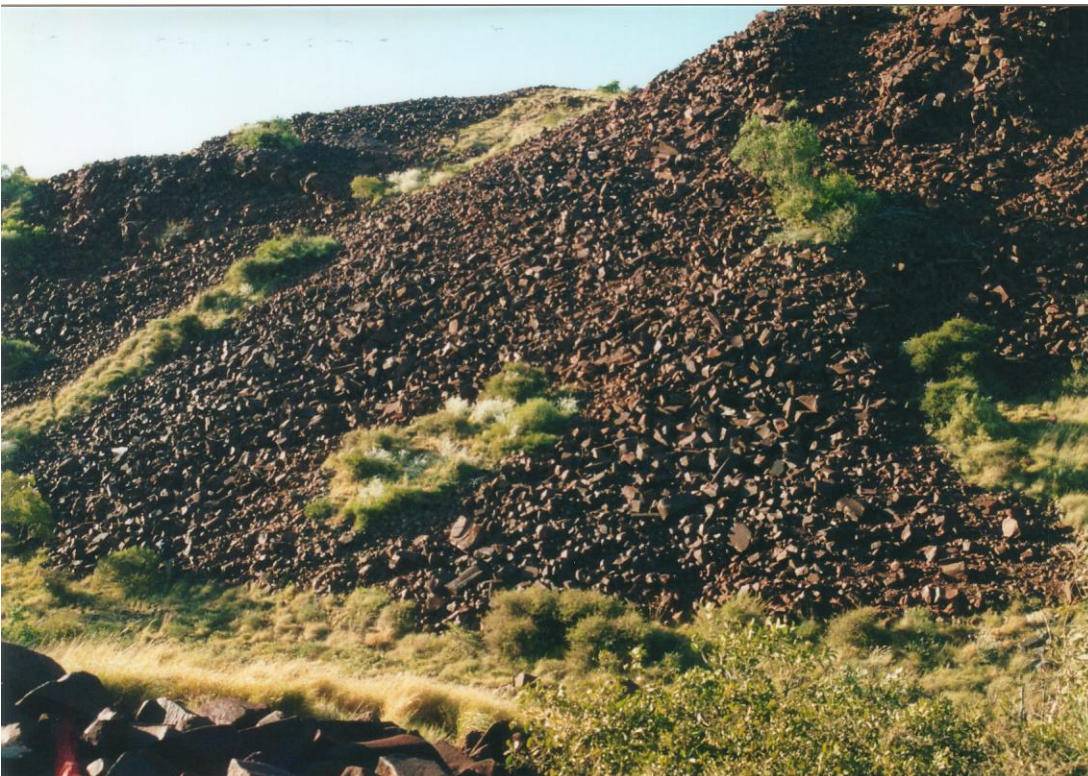
Quadrat B002A, B002B