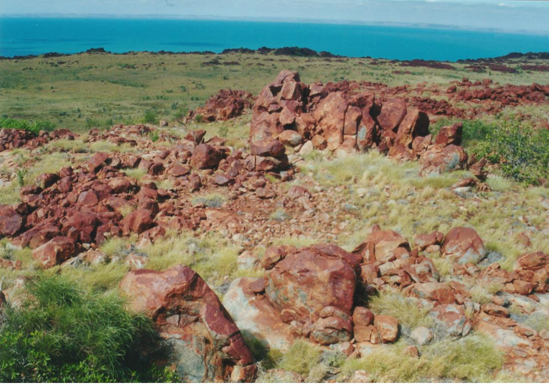
B045 (South East)