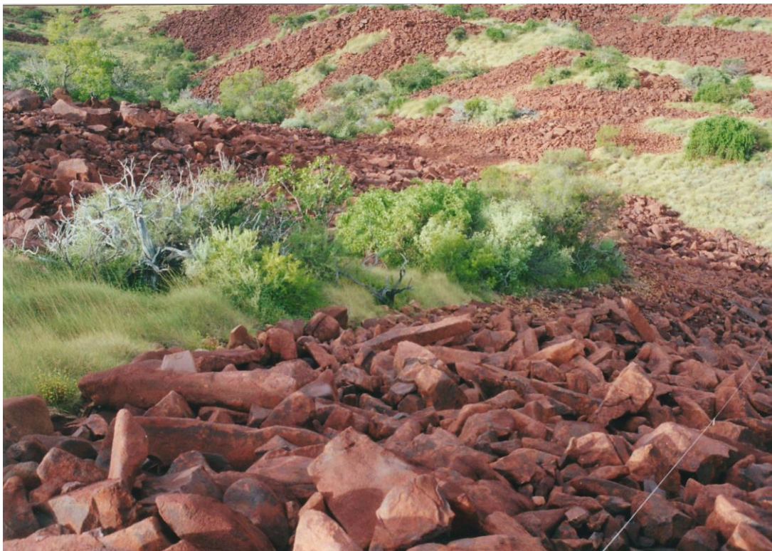
B038 (left centre)