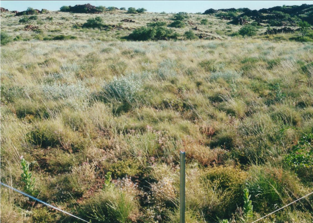
B073 (B073A is in centre background)