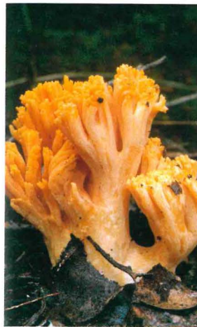
Below left: Salmon coral fungus Below right: Orange club fungus