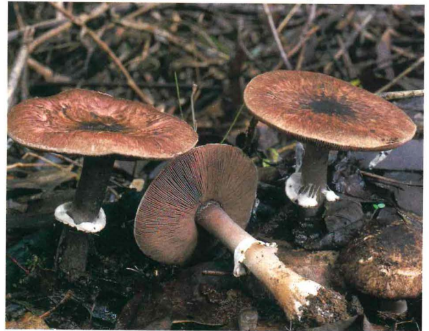
Below: Red-staining forest mushroom