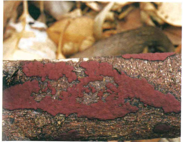
Above: Karri cushion fungus

GROUP: Ascomycetes. Flask fungi (hard, charcoal-like fruits).