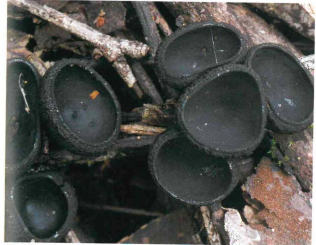
Below: Black cup fungus