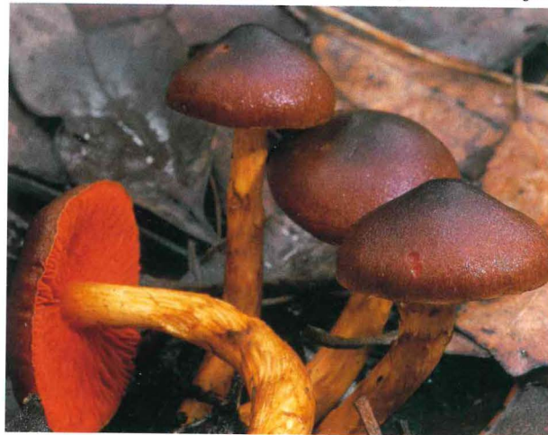
Below: Splendid dermocybe