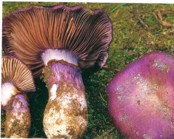
Above: Archer's cortinarius

GROUP: Basidiomycetes. Agarics (mushrooms with gills on the underside of the cap).