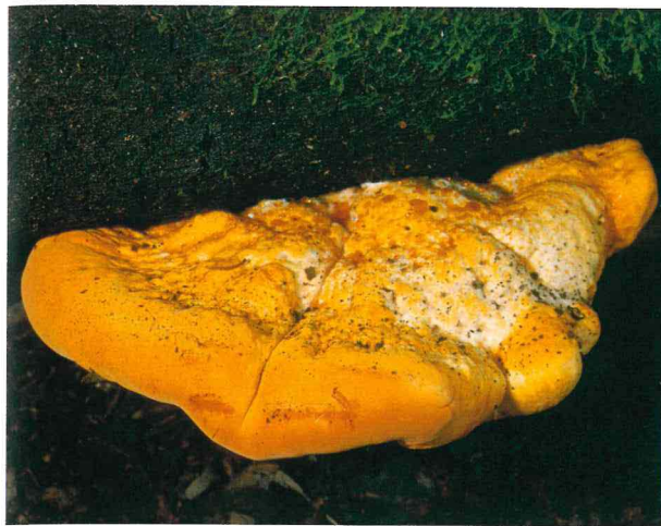
Above: Upper surface of curry punk fungus Below: The lower surface

GROUP: Basidiomycetes. Polypores (hard, woody, bracket-like fungi on trees and wood).