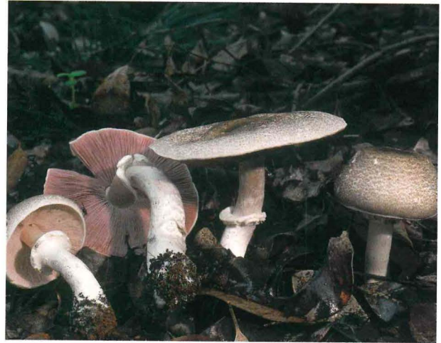
Above: Yellow stainer