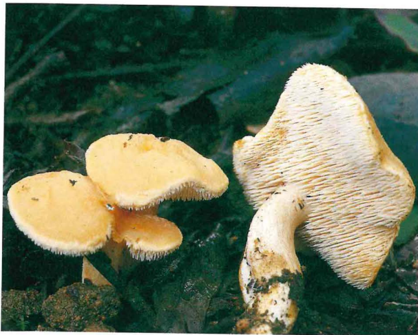
Above: Hedgehog fungus

GROUP: Basidiomycetes. Spine fungi (mushrooms or fruit bodies with spines).