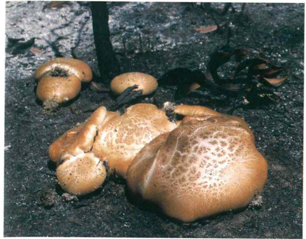
Below: A mushroom attached to its 'stone'

GROUP: Basidiomycetes. Polypores (fleshy or woody bracket-like fungi with pores).