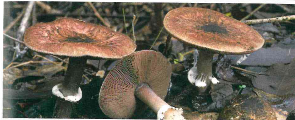
Red-staining forest mushroom