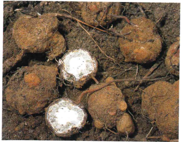
Above and below: Stone truffles ( Mesophellia trabalis )

GROUP: Basidiomycetes. Truffle-like fungi (underground fruiting fungi).