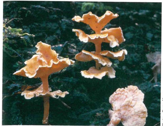
Above: Pagoda fungus

GROUP: Basidiomycetes. Leather and crust fungi (thin, leathery sheets on sticks and wood).