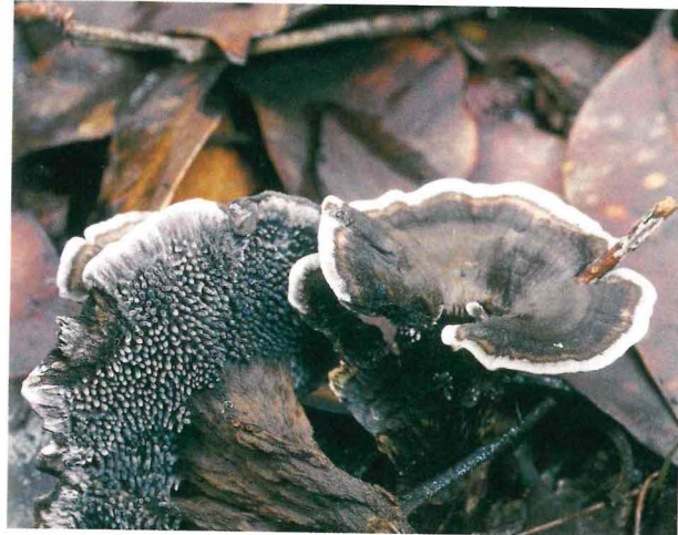
Below: Black phellodon