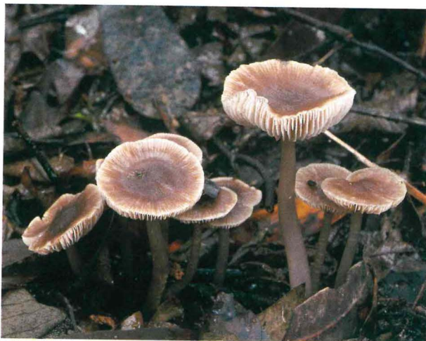
Above: Lilac mycena

GROUP: Basidiomycetes. Agarics (mushrooms with gills on the underside of the cap).