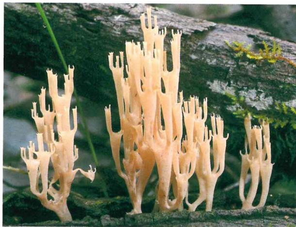
Above: Crowned coral fungus

GROUP: Basidiomycetes. Coral fungi (fruit bodies that are simple, club-like or multi-branched structures).