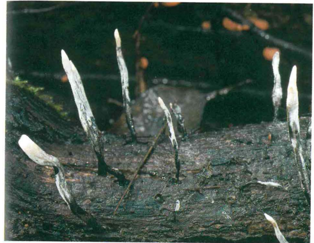
Below: Candle-snuff fungus