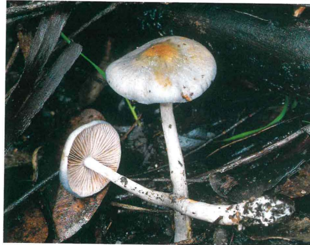
Below: Elegant blue cortinarius