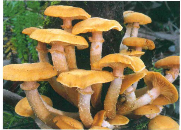
The honey fungus (Armillaria luteobubalina)

Despite their importance, knowledge of Australian fungi is limited. There are at least ten times as many fungi as plants in Australia, and at present only about five per cent of them have been formally described and named. The aim of Fungi of the South-West forests is to introduce you to the world of fungi and the array of species found there. There are very few records of indigenous people utilising fungi, and they were regarded suspiciously by the early European settlers. As a result, very few Australian fungi have common names. Most common names adopted for Australian fungi have been taken from European or North American cultures, and in many cases their original reference is to a different species. All the species featured in this book can be found along roadsides and walking tracks in the forests, woodlands and coastal communities of the South-West of WA.