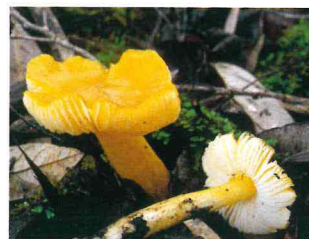
Above: Yellow wax cap Left: Conical wax cap Below: Chantarelle-like wax cap