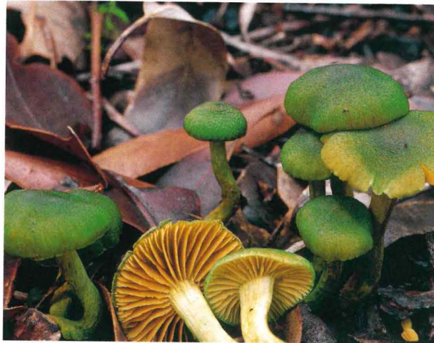
Above: Australian green dermocybe

GROUP: Basidiomycetes. Agarics (mushrooms with gills on the underside of the cap).