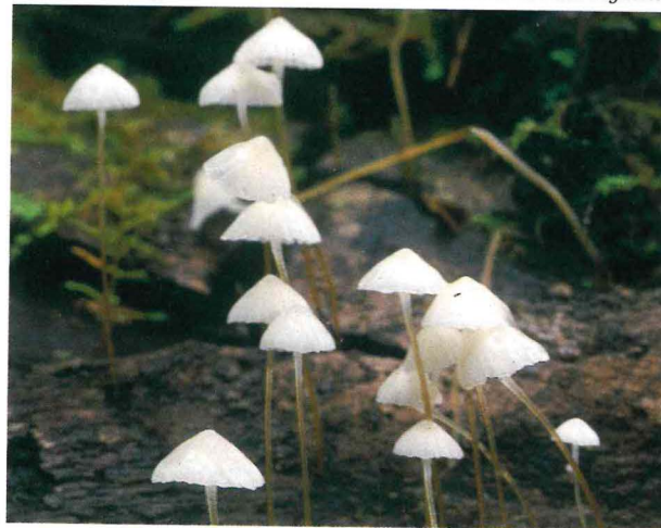
Below: Small umbrella mycena