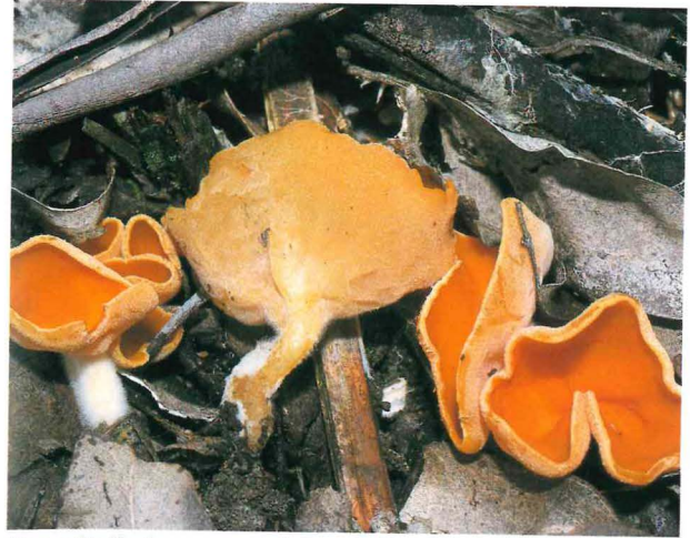
Above: Stalked orange peel fungus

GROUP: Ascomycetes. Cup fungi (cup or disc-shaped fruits).