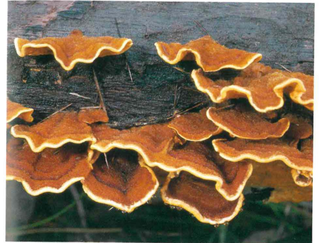
Below: Hairy stereum