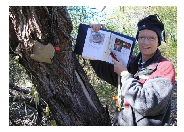
Demonstrating use of the new field book