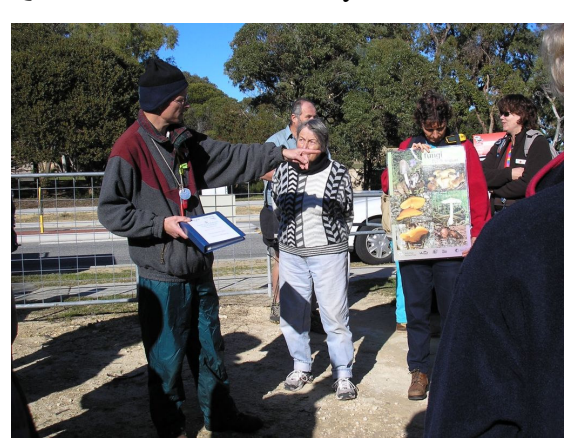
Project field book and poster on display Project.