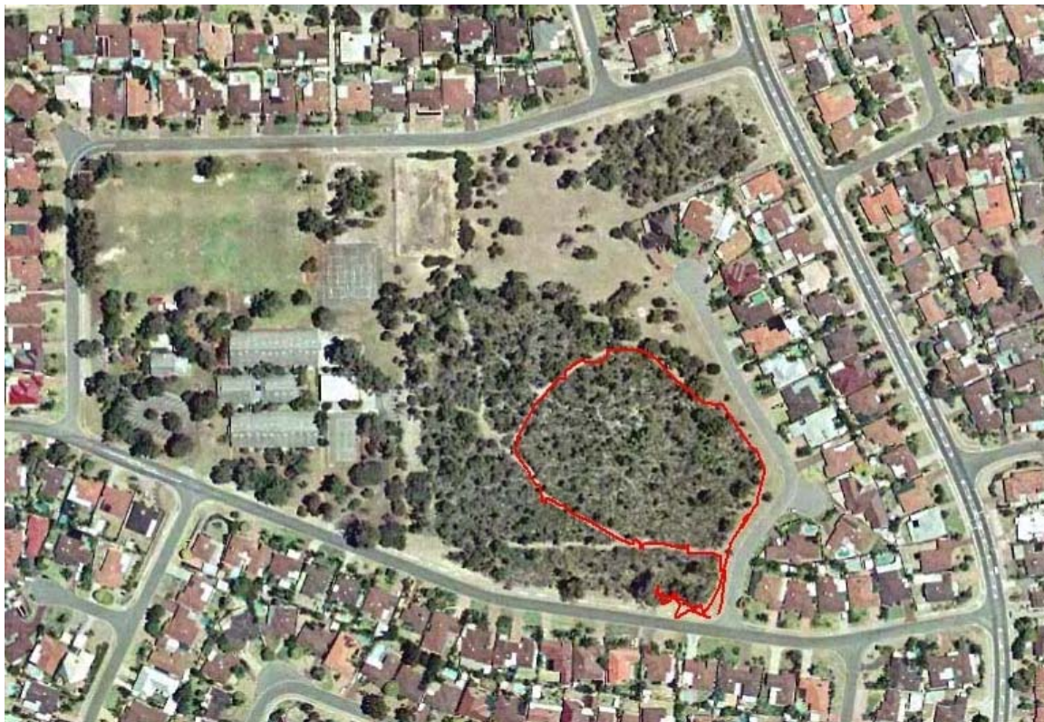
Figure 2 : Aerial photo showing track of Fungi walk in Cadogan Reserve