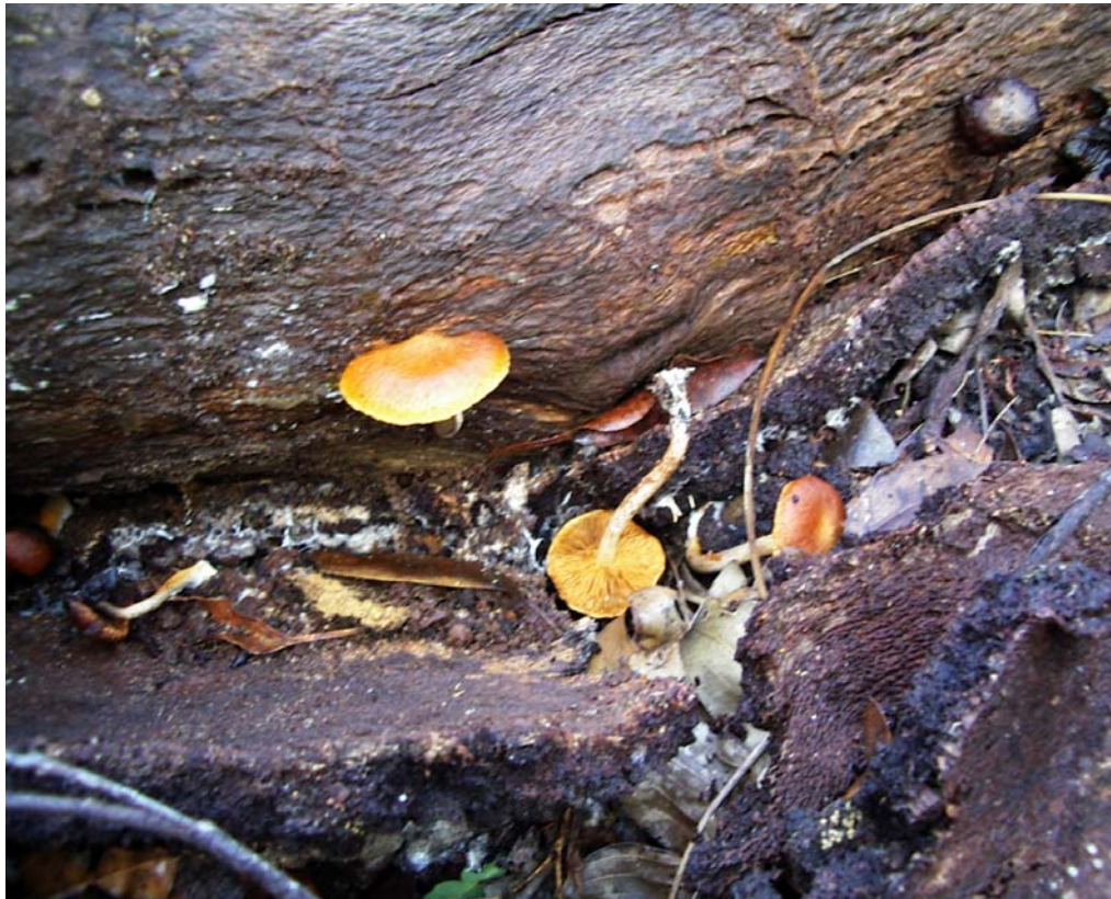
Golden Wood Fungus: Gymnopilus allantopus

Twelve species of fungi were recorded, the first fungi list that has been compiled for this reserve. It is important to realize that there are many more fungi species present, this list represents the fungi that were seen to be fruiting on this day only.