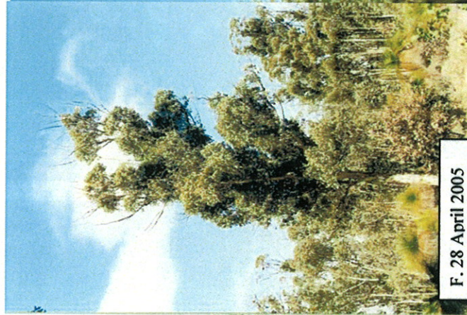
F. 28 April 2005