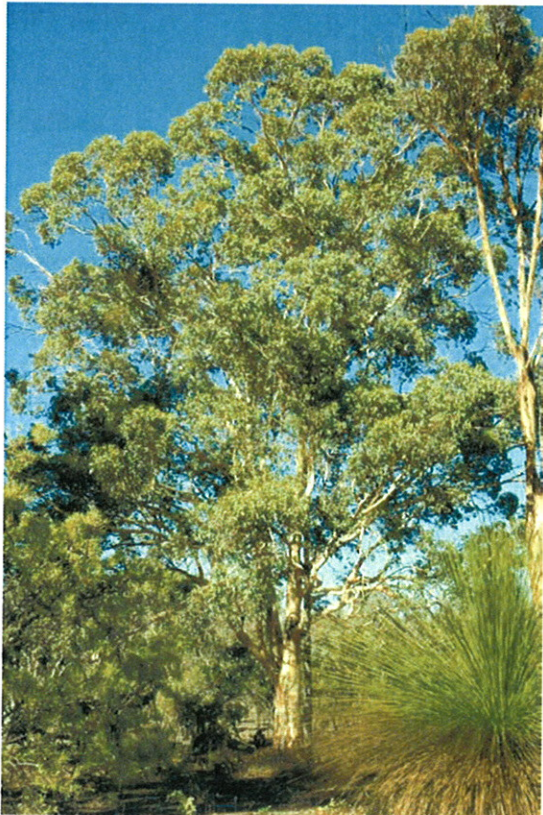
Plate 1 Upper, June 1999; lower, May 2006. An example of a tree showing minimal changes to the canopy since June 1999.