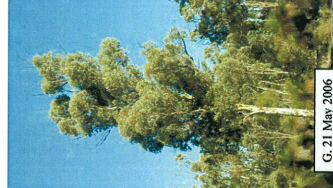
G. 21 May 2006