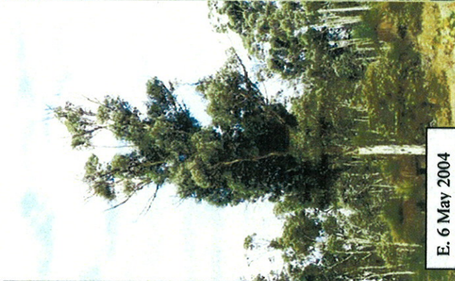
E. 6 May 2004