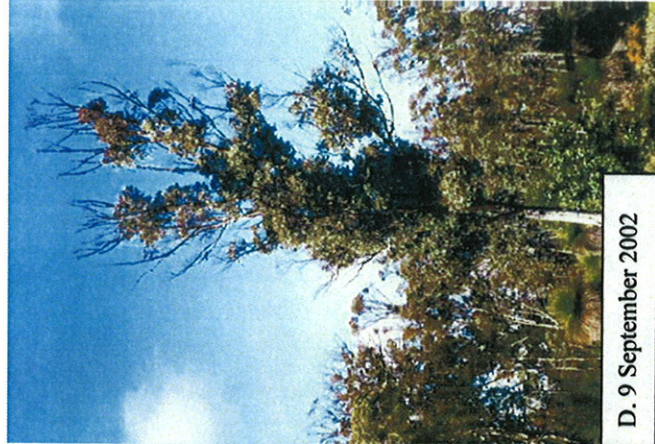
Plate 2 A-D. An example of the onset and progression of crown decline in one tree. A. Some thinning of foliage and initiation of epicormic growth prior to June 1999. B. Heavy thinning of foliage in upper crown and thickening of epicormic growth. C. Continued loss of terminal foliage, thickening of epicormic foliage, and flagging foliage. D. Some flagging, continued thickening of epicormic foliage