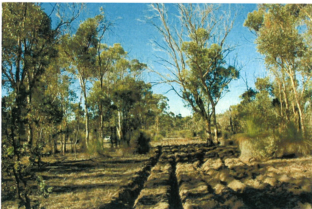
Plate 4. Shallow ripping around trees being monitored. Ripping done late summer or autumn 2006.