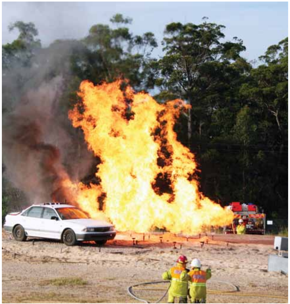
▲ Testing at the NSW Rural Fire Service Hot Fire Training Facility in Mogo.

untenable conditions. (Test 28, where an underburn only treatment was applied, the vehicle became untenable within 1.5 minutes, compared to the average time to toxic air untenability, which was 10.2 minutes).