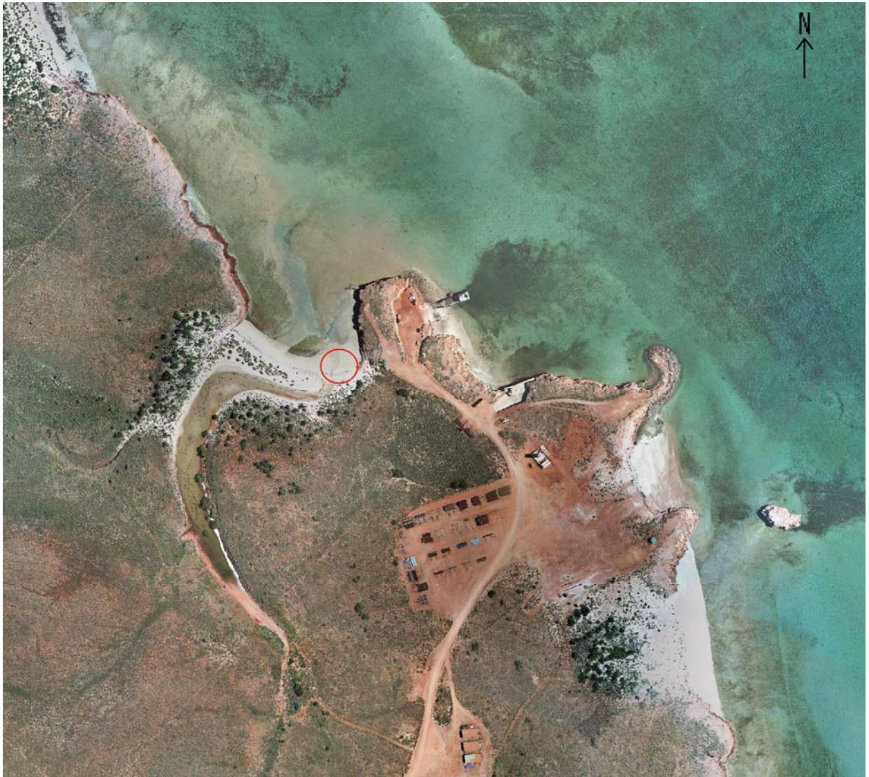
Figure 2. Area where small rodent tracks were observed on 29 October 2006 (denoted by red circle).