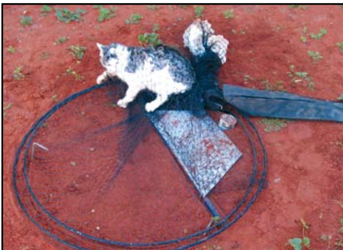
Cat captured in net trap, Dan Hough