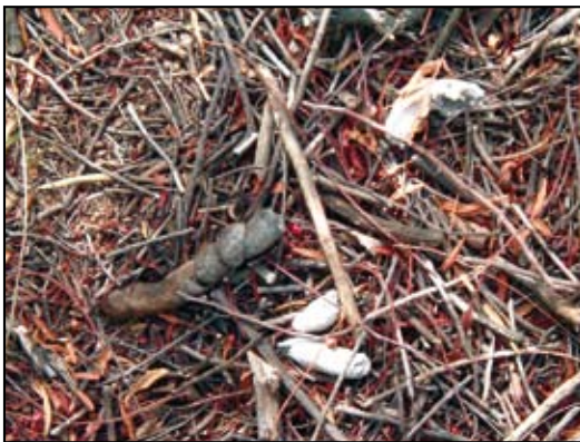
Cat scats on litter (arid)