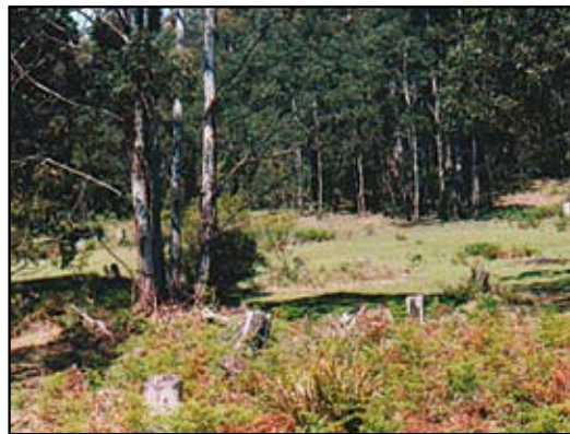
Poor tracking/scat collection habitat (forest), Elizabeth Denny