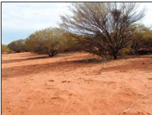
Good tracking/scat collection habitat (arid zone), Elizabeth Denny