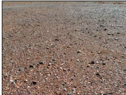
Poor tracking/scat collection habitat (arid zone), Elizabeth Denny