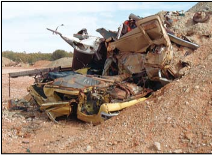
Resting/nesting area (arid tip site), Elizabeth Denny