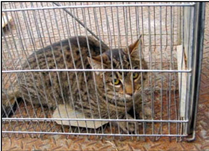
Cat captured in cage trap, Dan Hough