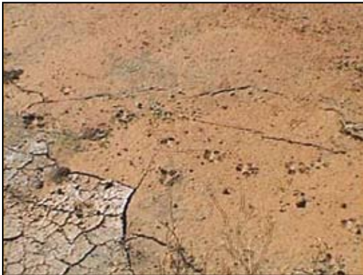
Cat tracks in mud