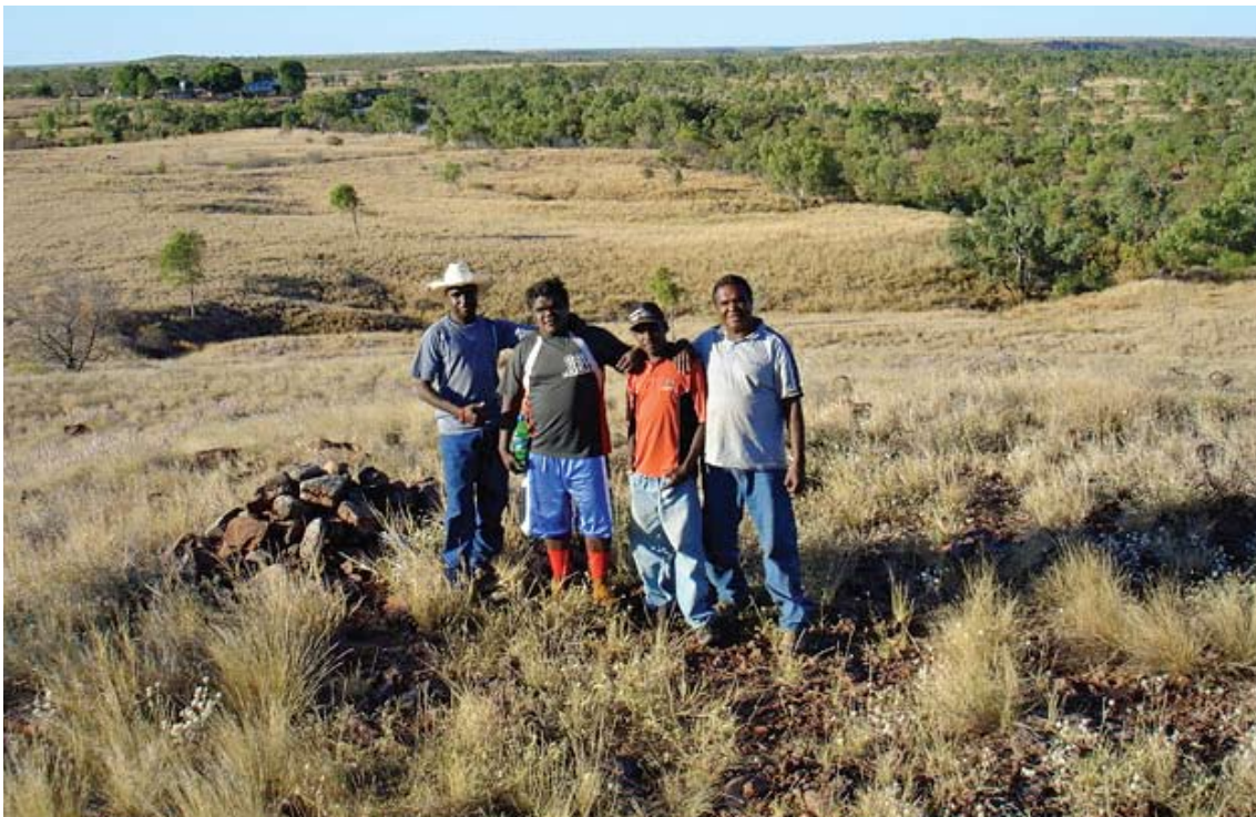
The next generation of Anmatyerr traditional owners and managers working towards culturally-based employment in natural resource management.