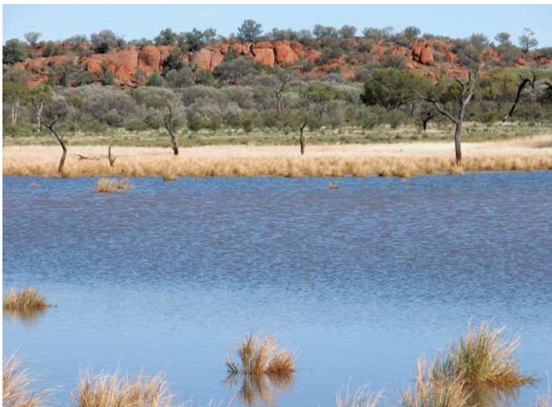
Mer Ywerternt is a large permanent swamp of special cultural significance and with historical heritage.

The agreement negotiated as part of this research project is not an authorised area agreement under the Native Title Act 1993 and therefore demonstrates how parks not on the schedule, and other non-reserve places, can have management arrangements resolved quickly and externally. This option is particularly valuable for situations which governments do not consider a high priority and which would rarely get the funding or attention needed. In a local setting and for local interests, agreements for such places can have far reaching benefits and make a big difference to individuals, families and communities. This type of agreement can be signed by any willing party (eg pastoralists, commercial interests, traditional owners and managers), including, but not requiring, government and representative bodies. It therefore has greater potential scope for matters to be discussed and emphasises the local context as a strong basis for workable outcomes.