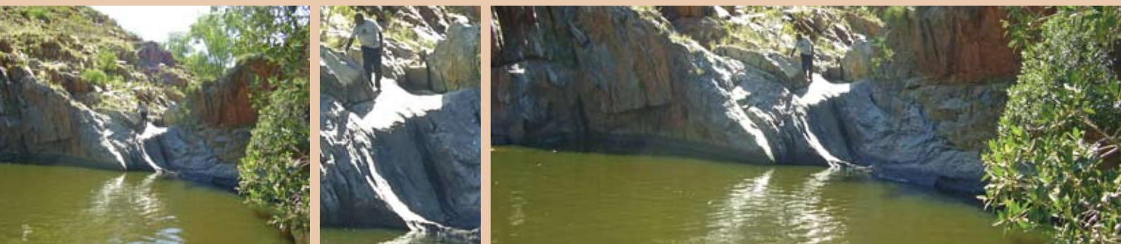
COVER PHOTO: Anna's Reservoir Conservation Reserve (Mer Ngwurla), a permanent waterhole in Central Australia near Alice Springs, Northern Territory.

Indigenous Law and cultural traditions remain strong and active in many parts of Australia.