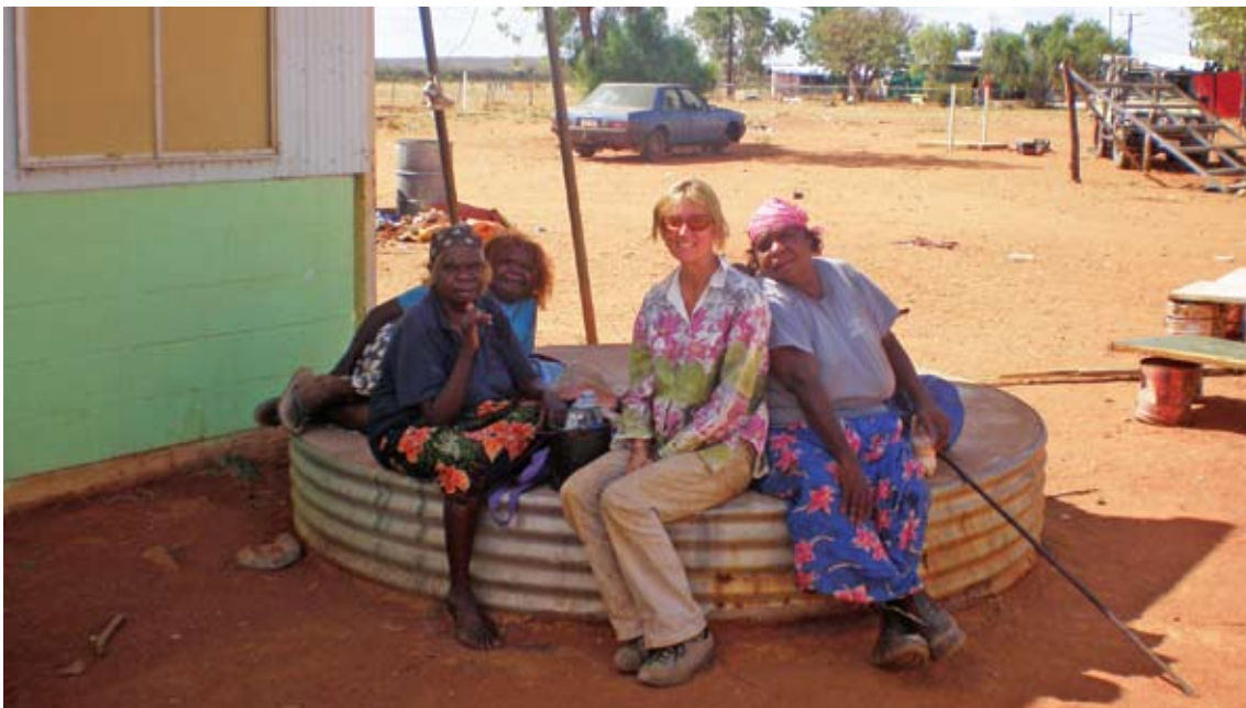
"Working together" on Anmatyerr country with women from Wilora. Generally, female researchers work with women and male researchers with men.

The Anmatyerr agreement process combined aspects of negotiated agreement making from the First Nation groups and governments in Canada as well as examples and experience from Australia. The process was also constructed in situ to ensure full understanding of all parties and adherence to the tenets of free and prior informed consent. The nature of the agreements was influenced by the opportunities and resources available and the willingness of various parties to prioritise and negotiate the issues of concern related to Mer Ngwurla in particular, as described in the following section 7.