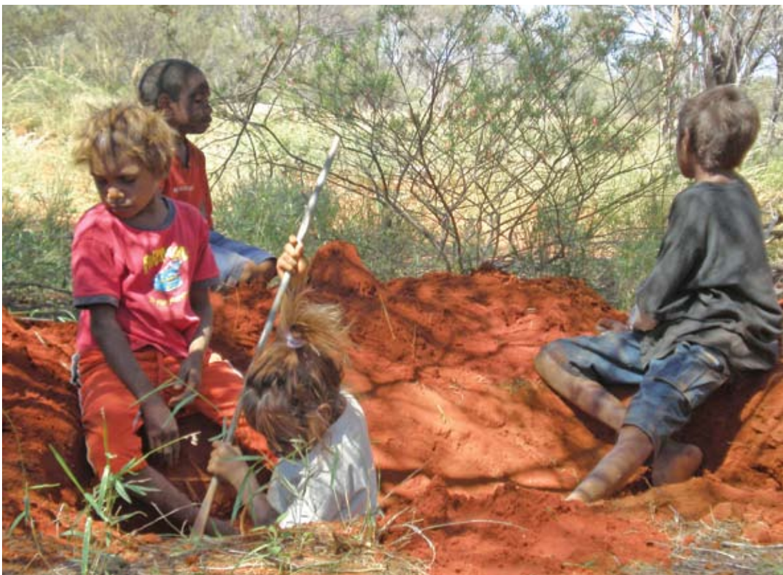
Children copy the adults by digging for their own yerramp (honey ants) which are harvested regularly after good rains.