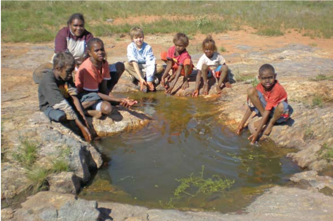
All time spent on country includes children who learn from adults.

The major difference between area and alternative procedure agreements relates to who can be parties and the notice provisions. All registered native title claimants (if any) must be parties to an area agreement. Registered native title claimants need not be parties to an alternative procedure agreement although all registered native title bodies corporate and representative Aboriginal or Torres Strait Islander bodies must be (Bartlett 2000).