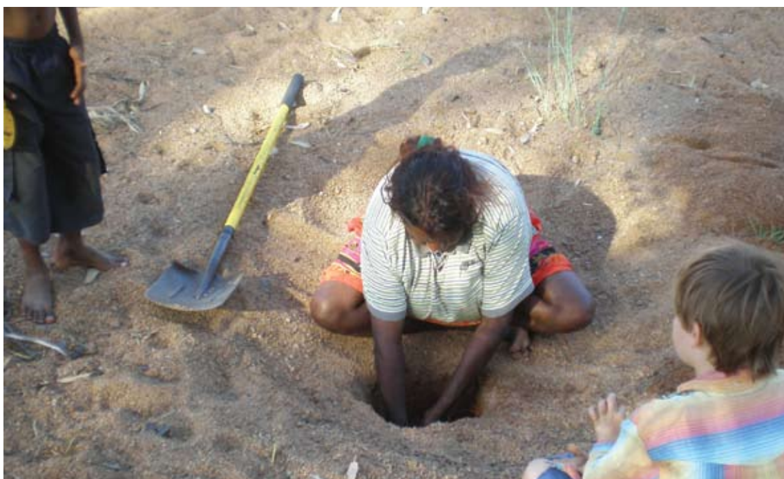
Digging for water provides a fresh supply of drinking water. Soakage water was frequently sourced during bush trips, with children always watching and learning the technique.

Regional agreements provide an important opportunity to negotiate new powers and resources for Indigenous local government, policing and community justice.