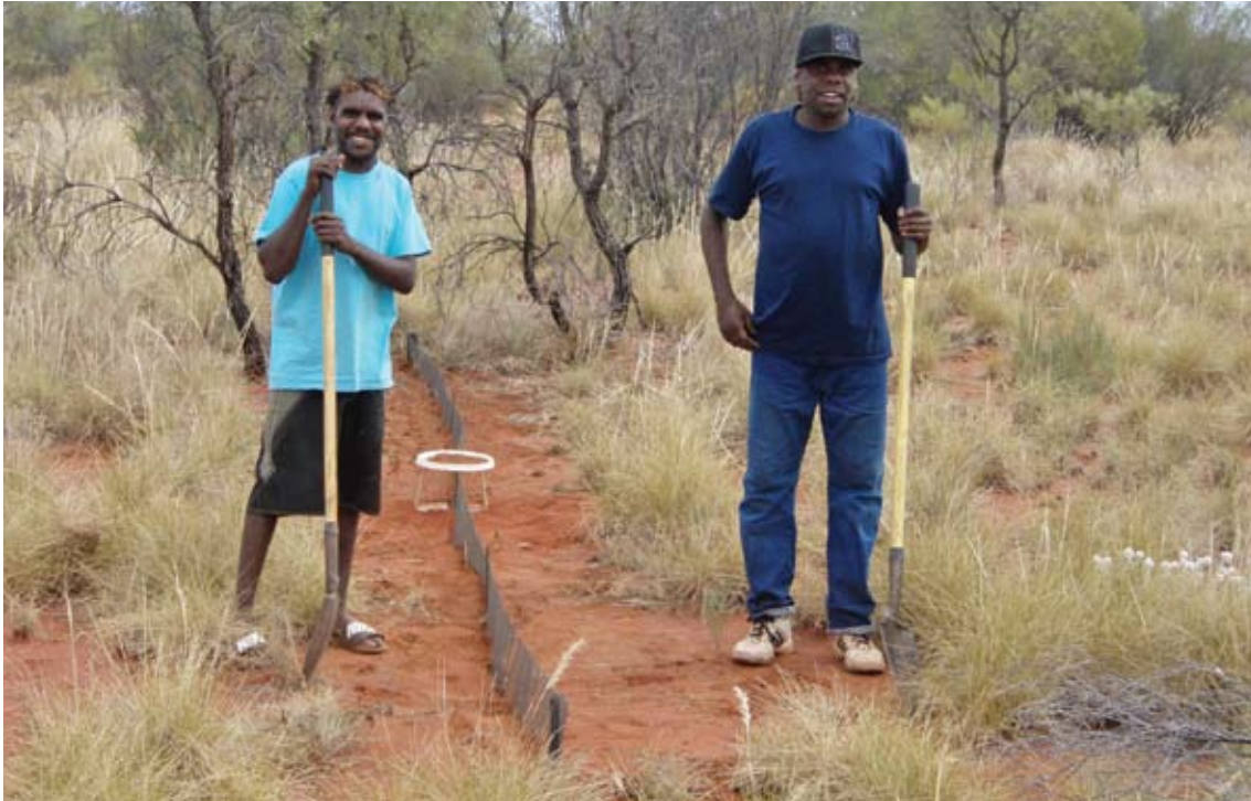
"Working together" on Anmatyerr country: Parks and Wildlife and Anmatyerr men participated in a regional bio-survey on Stirling Station (June 2006).

a mechanism for agreement without government involvement under certain circumstances and a more flexible approach to dealing with native title issues. These factors seem to have facilitated the conclusion of several agreements and the parties have often been creative and cooperative in arriving at compromises and mutually advantageous positions.