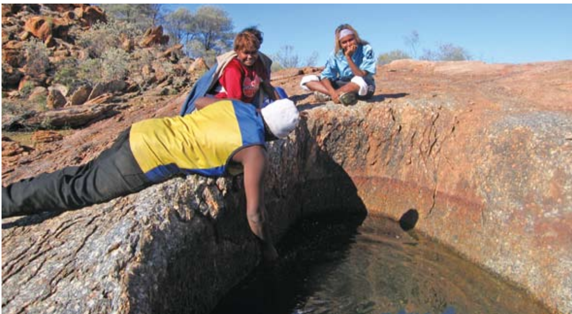
Young Anmatyerr people engaged in natural resource management training as part of developing sustainable livelihoods; a major way of providing for cultural values.

When an Indigenous group applies for a determination of native title, there is a period of time in which mediation can occur with governments and other interested parties. An agreement can result from the mediation that recognises native title and outlines the relationship between native title rights and interests and any other rights and interests over an area. This sort of agreement can form the basis of a determination of native title. Joint management of national parks and protected areas will be a central feature of many determinations of native title. National parks were used in the Mabo judgement as an example of a land tenure that is consistent with the continued exercise of native title. Issues of biodiversity protection are likely to be considered in this context.