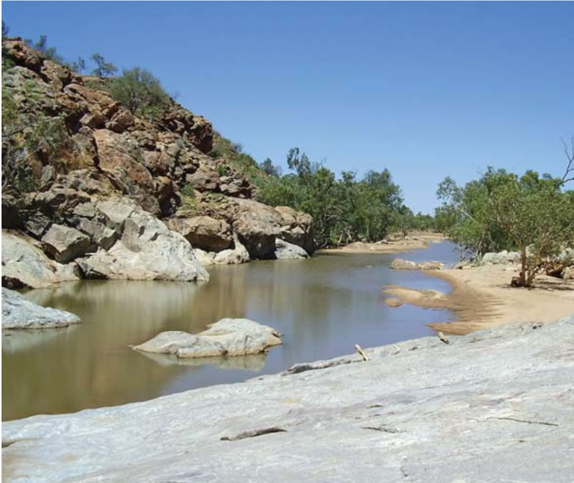
Surface waters need management guidelines to ensure that the allocation to environmental and cultural values achieve set objectives.

Minco approached the Tumut-Brungle Aboriginal Land Council, which advised that the wider local Aboriginal community would also have to be involved in the process. The Tumut-Brungle Aboriginal Land Council received assistance from the NSW representative body, the NSW Aboriginal Land Council, in the form of expert advice. Formal negotiations were commenced and the parties resolved to develop a protocol as a first step in the negotiation process. The protocol was a crucial element in the success of these negotiations as it set out the framework, timelines and objectives. Other important features of the protocol were: