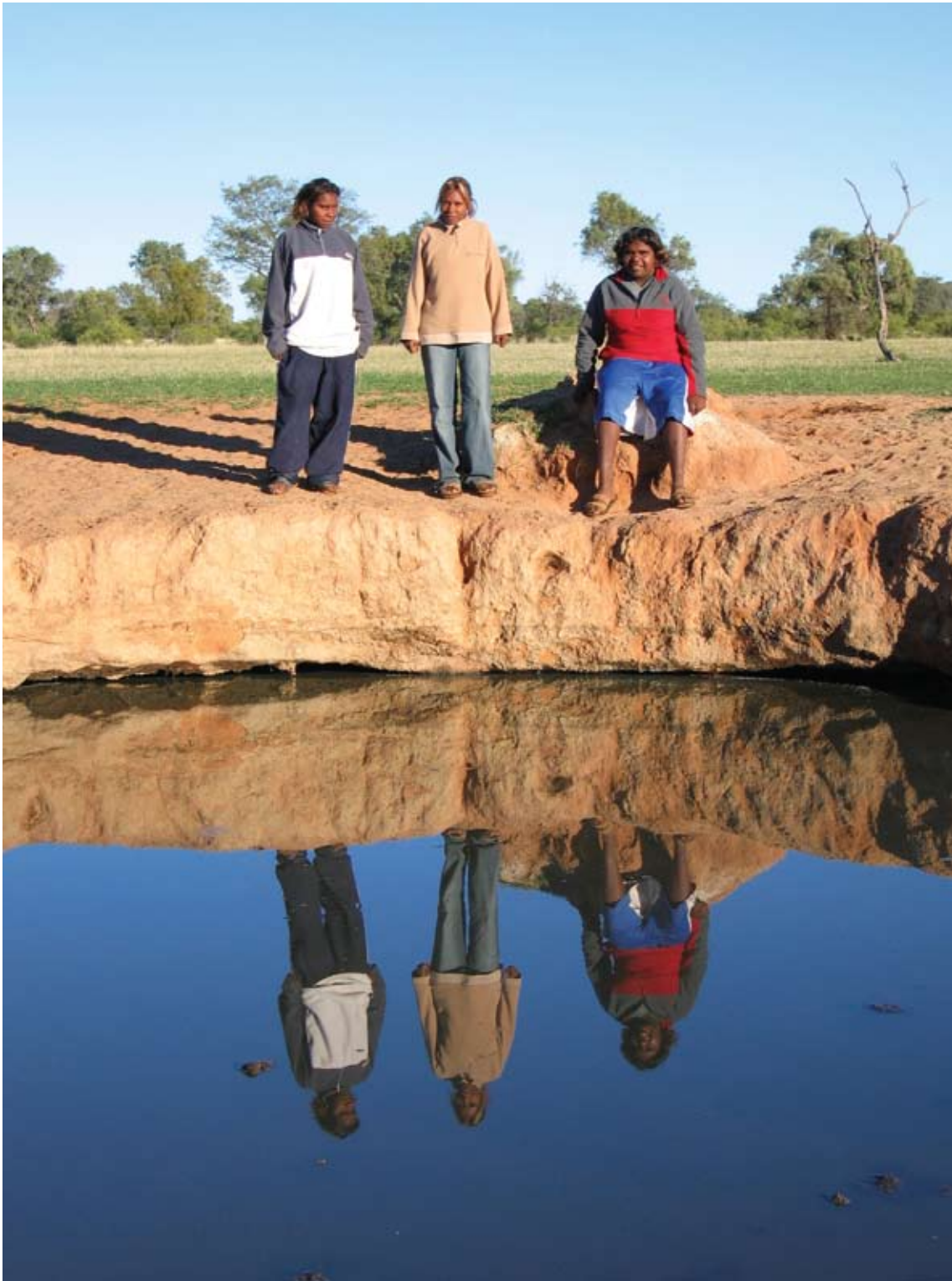
Young Anmatyerr women participating in resource management training and learning about Anmatyerr culture and history on a local pastoral station.