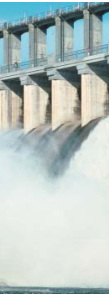
Hume Dam.

Most dams on inland rivers are built to divert water for humans, and they are often located upstream of major floodplain wetlands. These dams ‘capture’ the floods so the water can be released later for human use down the main channel of the river. This prevents many of the floods reaching the floodplain. About half the natural flow on the Murray River is currently extracted, and this has resulted in reduced flooding, with negative consequences for the ecology of inland rivers. Water plants reliant on irregular but reliable floods are gradually replaced by species more tolerant of dry periods, and this begins the process whereby the floodplain shrinks and biodiversity declines. Refuges can be lost, plant and animal breeding reduced and inland river ecosystems degraded.