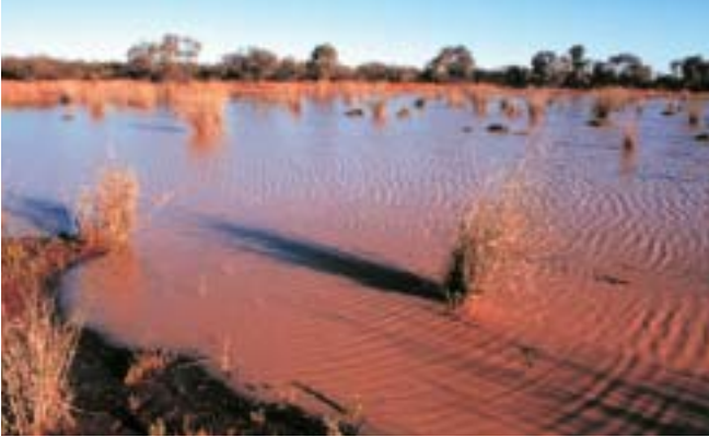
Canegrass swamp at Nocoleche with water in the 'boom' cycle (above) and without water in a 'bust' cycle.