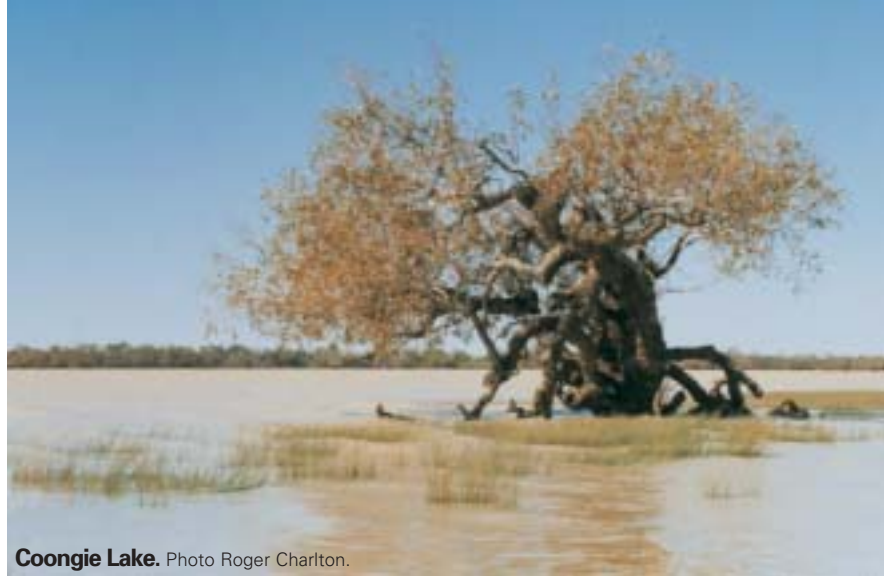
Coongie Lake.

Floodplains are the habitats and 'hotspots' for biodiversity on a river system. They are usually the areas where the river breaks its banks and floods freshwater lakes, saline lakes or floodplains. Sometimes these floodplains lie at the end of a river, but many are located in the lowest part of the catchment.