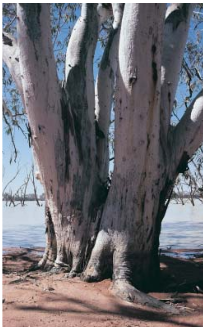
Red gum on a dry creek bed on the Paroo River where it depends on irregular floods for its survival, growth and reproduction.

Birds and frogs are the ‘obvious’ organisms we think about, but they are supported by a food web of plants, animals, fungi and bacteria. Intermittent floods produce the highest diversity and abundance of insects, often hatching with other organisms from sediments on the floodplain. Plants grow and germinate — with regeneration cycles for some floodplain tree species only occurring with medium to high floods, at frequencies of fifty years or more. Even land-based (terrestrial) animals build on the bonanza of food brought by a flood. Kites and eagles increase dramatically when inland rivers flood, feeding on the abundant fish and waterbirds.