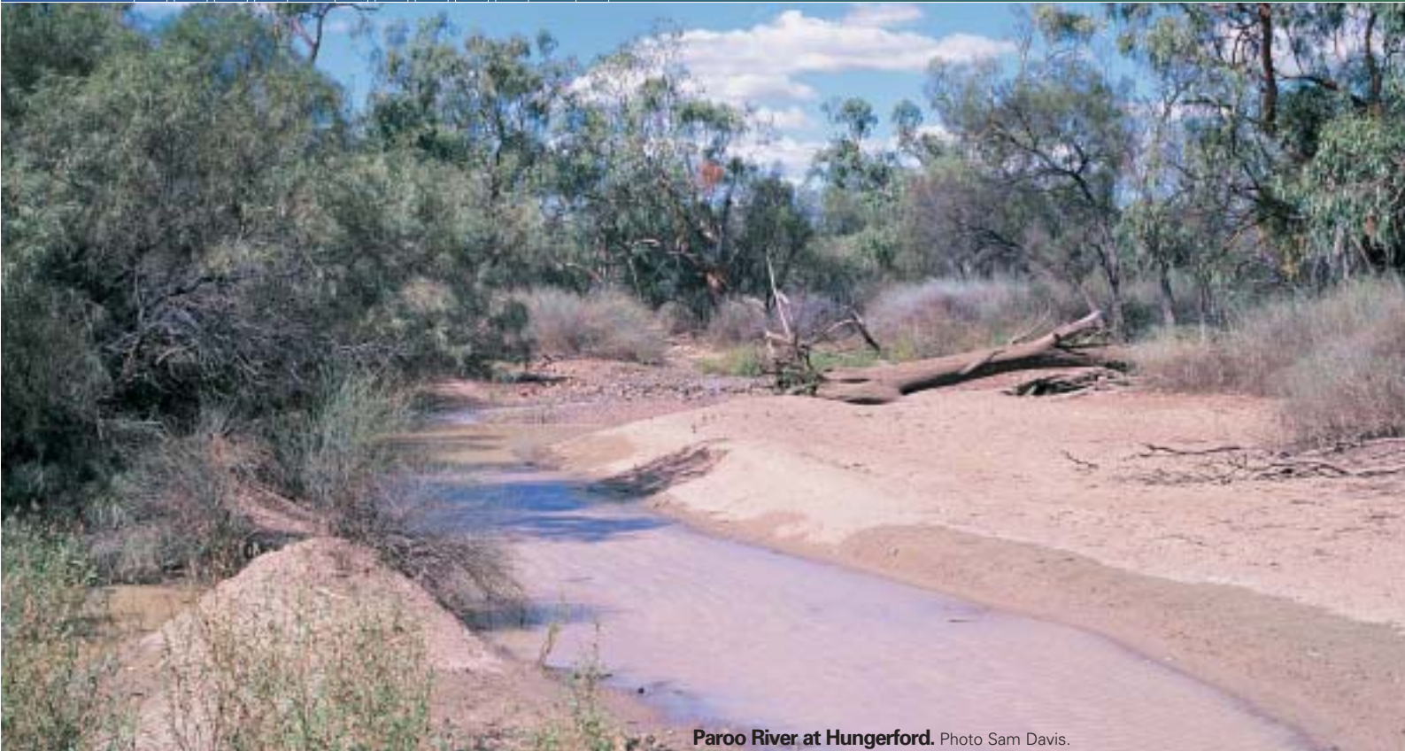
Paroo River at Hungerford.