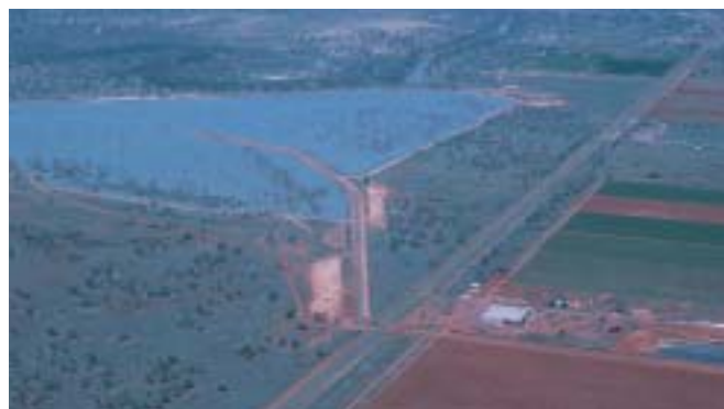
Off river storage.

By the mid 1980s, attention had turned to water resource development opportunities on the northern rivers and those in more inland regions (e.g. Gwydir, Namoi, Border Rivers and Condamine-Balonne). Government sponsored water resource development was replaced by private water resource development. Large dams (some up to 80,000 ML storage capacity) were built on the floodplain. Earthen walls of five metres or more encircle these ‘off-river storages’, and these are filled during floods by pumps (>600 mm diameter) which can extract water quickly from the river. On the Gwydir River, the storage capacity of off-river storages (386,000 ML) occurred over less than 20 years.