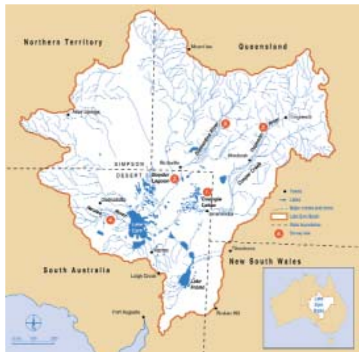
Inland rivers of the Lake Eyre Basin.

All inland rivers have one thing in common: they lie at the low end of the river range in terms of flow quantity, but they are at the high end of flow variability. This means that these rivers are incredibly complex and unpredictable. The explorer Charles Sturt could not believe Cooper Creek was much more than a creek, yet it forms one of the most magnificent desert river systems of the world. Henry Lawson similarly summed up this ‘perception problem’ in his 1918 poem of the Paroo River, because he could hardly describe such a watercourse as a river. During dry periods, the Paroo River in Australia is limited to a series of waterholes and some permanent freshwater lakes, however, large floods may see the river inundate nearly 800,000 hectares.