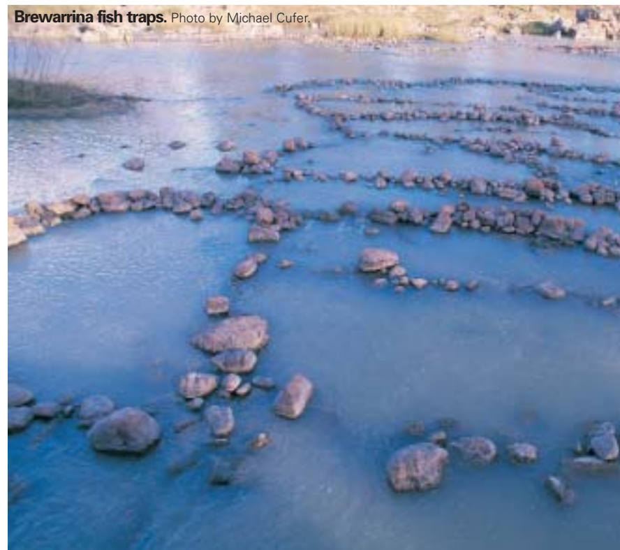
Brewarrina fish traps.

People have relied on inland rivers for tens of thousands of years for water, food, shelter and spiritual connection. Aboriginal people often centred their lives on an important waterhole or lake with mussels, crayfish, fish and wetland plants an important part of their diet. Water plants provided spring shoots of common reed that can be boiled or roasted, as well as Nardoo seed that is crushed for flour and baked. Floodplain eucalypts provided wood for shields, containers, weapons and canoes. Waterbirds were caught with nets or, when they were breeding, eggs were collected for food. Fish were also an extremely important food for Aboriginal people. These were caught in nets or intricate stone traps such as the famous Brewarrina fish traps on the Darling River.