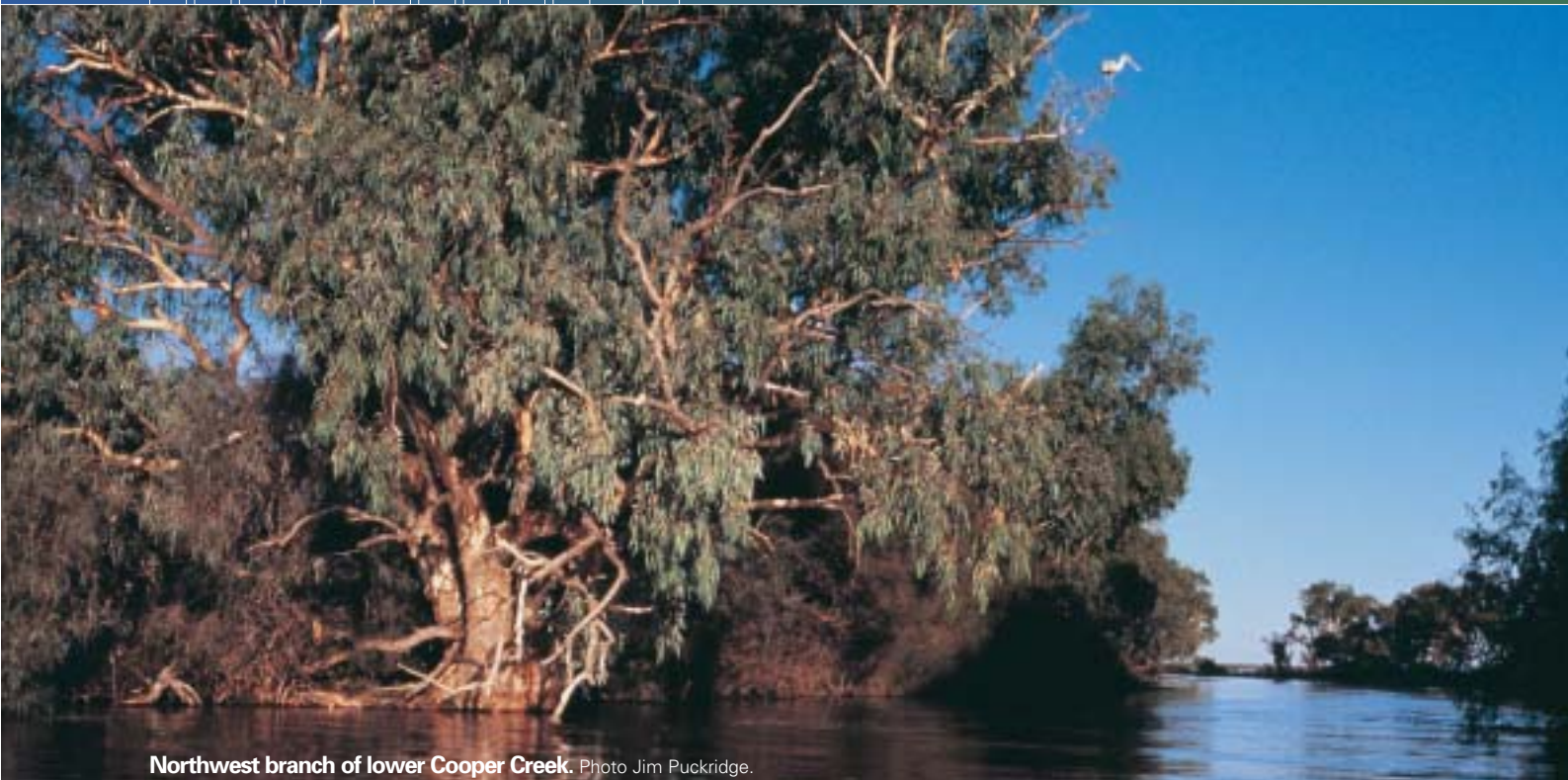
Northwest branch of lower Cooper Creek.