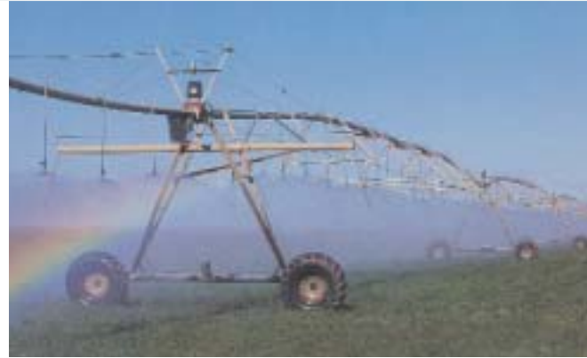
Travelling irrigator.

Our inland rivers support many rural towns, providing water for drinking and industry. Most of the water used by us from our inland rivers is for the irrigation of a wide range of crops: citrus, grapes, rice, cotton and wheat. Without the water from inland rivers, profits for growing these crops would not be realised.