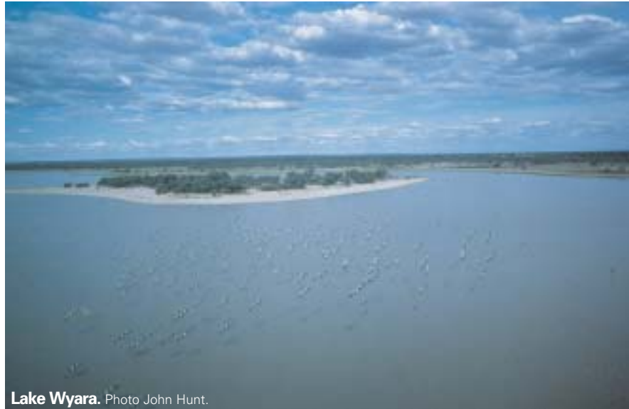
Lake Wyara.