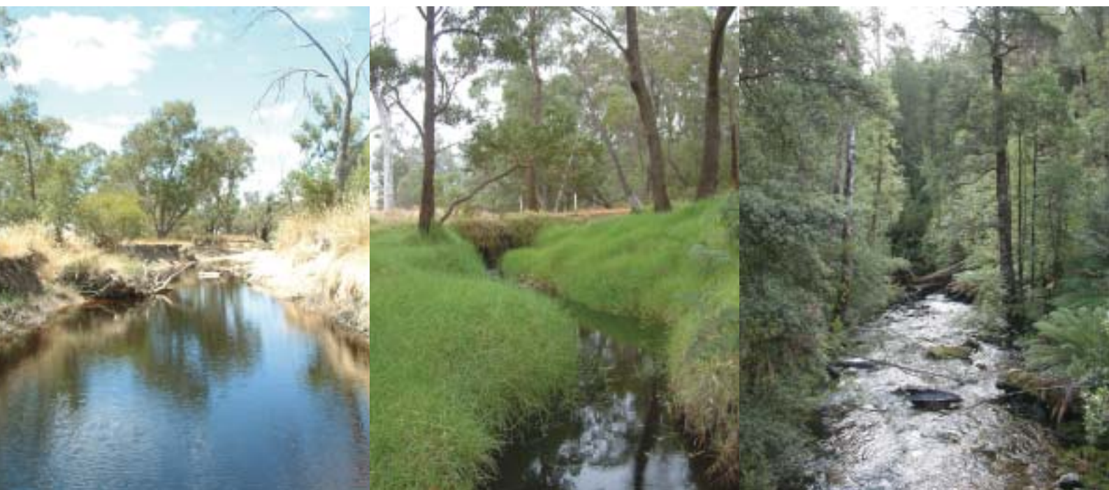
The degree of shading of a stream is a relatively easily measured surrogate indicator for some in-stream processes.

It is also necessary to determine the degree of accuracy (how close the measured data is to the actual value) and precision (how close are repeated measurements) required of the indicators. Accuracy is important in relation to the effects of detecting a false positive (recording change when in fact there is none) or a false negative (recording no change when in fact there is one). As there is often a power relationship between accuracy and the number of data measurements needed (e.g. four times as many measurements may be needed to halve the sampling error), it is important to pre-determine the level of confidence required in the results to trigger a management or policy decision. Is 100% confidence required, or is 90% or even only 20% sufficient? The answer will depend very much on the questions being asked — this will also determine whether false positives or negatives are the most dangerous. Determining a required level of precision is important when measurements made by different people, or measurements repeated over time, are to be compared. Statistical methods are available to help determine required levels of accuracy and precision.