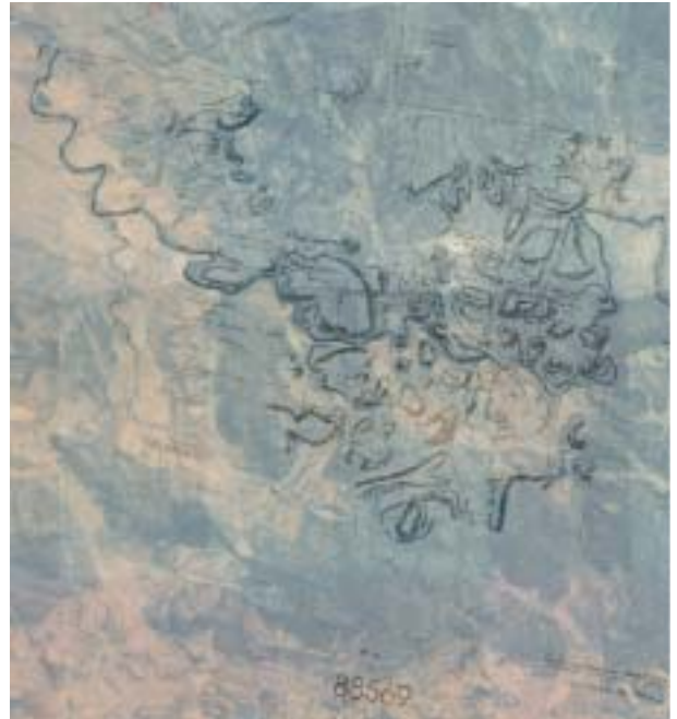
Monitoring sites must be located to ensure that you can assess whether the project objectives have been achieved.

Information (mainly field data) could be collected to demonstrate change over time, change from the base condition prior to treatment, change in relation to untreated control sites or to adjacent reference of 'natural condition' sites. Each approach can be valid depending upon the purpose of the riparian management and the resources available for monitoring. Statistically designed comparison of treated and control sites over an adequate timescale is the best option (the gold medal of Rutherford, Ladson & Stewardson 2004), but in practice has been uncommon. For many riparian rehabilitation projects, the emphasis will be on measuring change from the initial condition considered to be degraded or unsatisfactory, to one considered closer to natural or at least preferred. In the absence of a matching but untreated control site, comparison to an adjacent reference site is valuable to help distinguish treatment effects from natural background variability (the signal to noise issue discussed above).