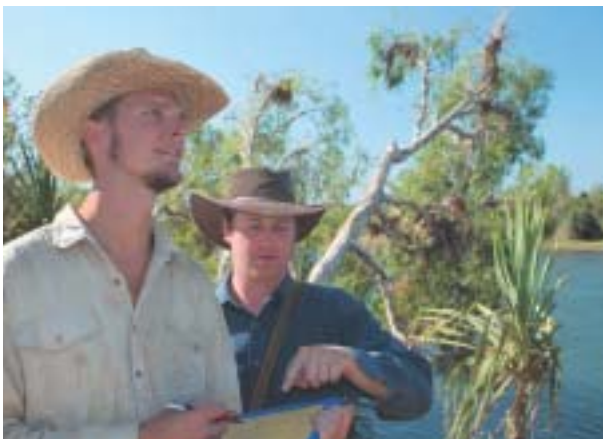
Undertaking the TRARC.

Many national, state and territory, regional, and local programs have been established in recent years for assessment of catchments, rivers, and riparian zones. Several are primarily concerned with monitoring and reporting change in extent, condition or ecological status (e.g. State of the Environment reporting), but some use the collated data for evaluation purposes related to management or policy (e.g. the National Land and Water Resources Audit). These programs use different approaches to assessment, a wide range of indicators, and different measurement methods. A list of programs and of websites with stored data is provided by Whittington (2002).