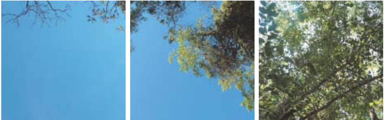
Indicators of physical condition such as canopy cover may respond faster and be easier to measure than changes in animal populations. Changing canopy cover can be viewed using a 'fish eye' lens to look up from the stream. Photos: (above) Ian Dixon, (below left) Australasia Grebe, Neville Male, (below right) Litoria caerulea , Angus Emmott.