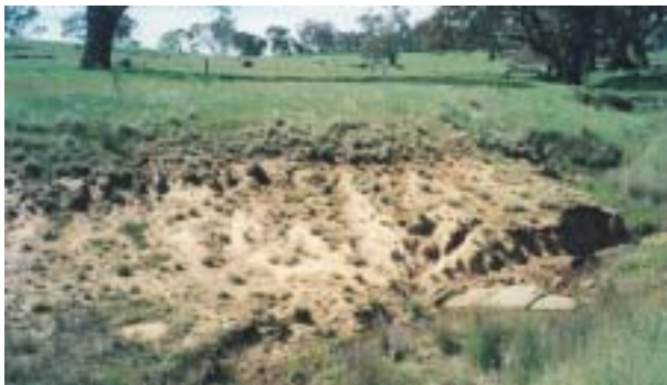
Landholders took these photographs to record their rehabilitation efforts over a period of nine years 1996 (left) and 2005 (right).

Where no comparison with other sites is possible, the collection of adequate baseline data from the treated site becomes paramount. Some type of before-after-control-impact (BACI) sampling design should be considered, with randomised or gradient sampling to take account of local spatial variability (Ellis & Schneider 1997). BACI monitoring systems are commonly used in environmental impact assessments, and for detecting the impacts of anthropogenic change. The length of the 'before' monitoring should be sufficient to provide information about the scale and direction of natural variability, and to capture the effects of significant natural events such as flood flows. In practice this is difficult due to the timing and funding processes for most riparian projects, although use may be made of local knowledge, oral histories, and past photographs or imagery.