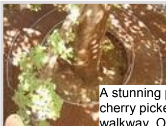
A stunning photo taken from a cherry picker showing the spiral walkway. One can see why it is a popular place for wedding photos.

A sketch of the valley as it may have been when Jecks settled there creates a sense of the isolation and hard work Portagabra Farm would have been.