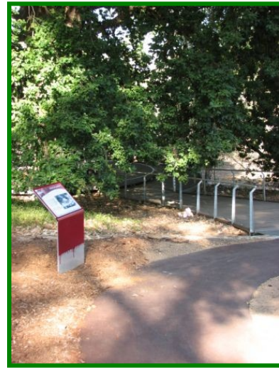
A view of the entrance to the walkway under the oak tree showing the gentle accessibility slope.