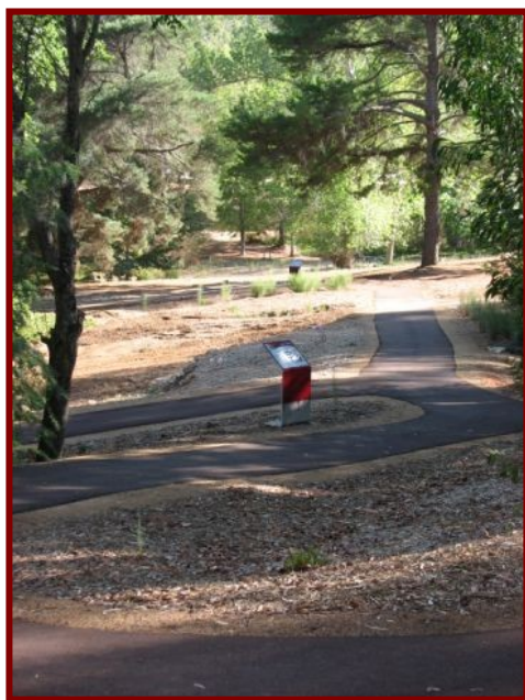
A view of one of the new interpretative signs and the meandering paths which encourage visitors to take in the landscape. Notice the modern slim profile of the sign.