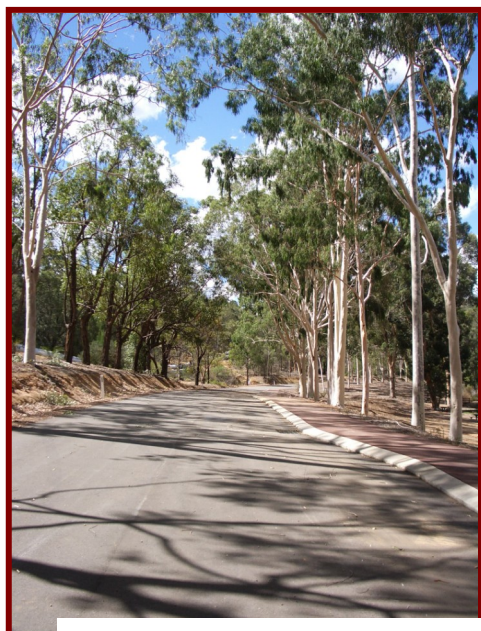
This avenue of lemon-scented gums forms the new one-way entrance to the park.

When the plans to replant the water-course with appropriate trees and shrubs are implemented, visitors will be more able to appreciate the sense of the original bush.