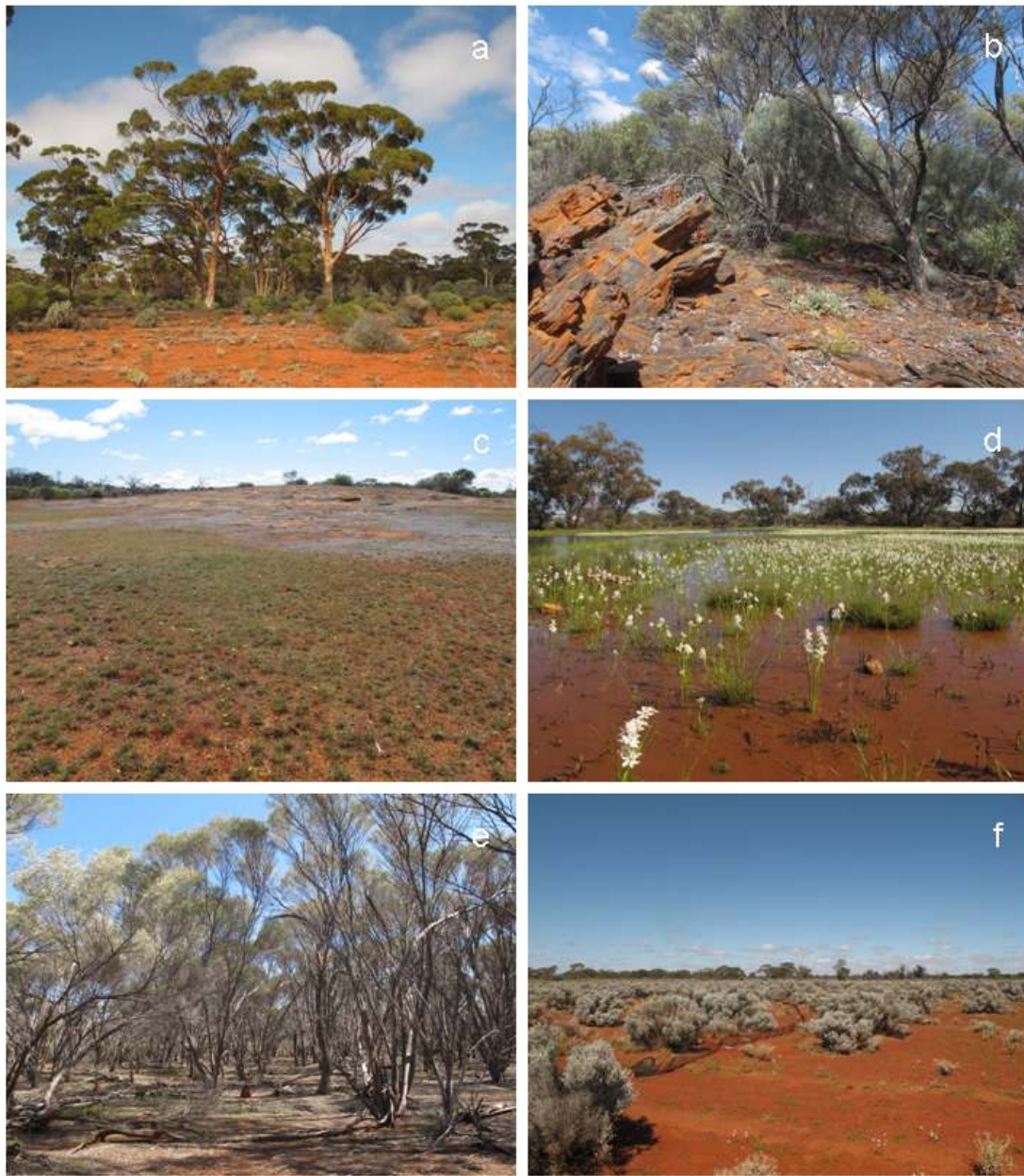
Figure 2. Some of the major habitat types covered in the survey. a) Salmon gum woodland (undisturbed), b) Banded Iron Formation ridges, c) Granite inselbergs, d) ephemeral wetlands associated with granites, e) Mulga woodlands, f) Chenopod shrublands with a vertebrate trapping line in the foreground.