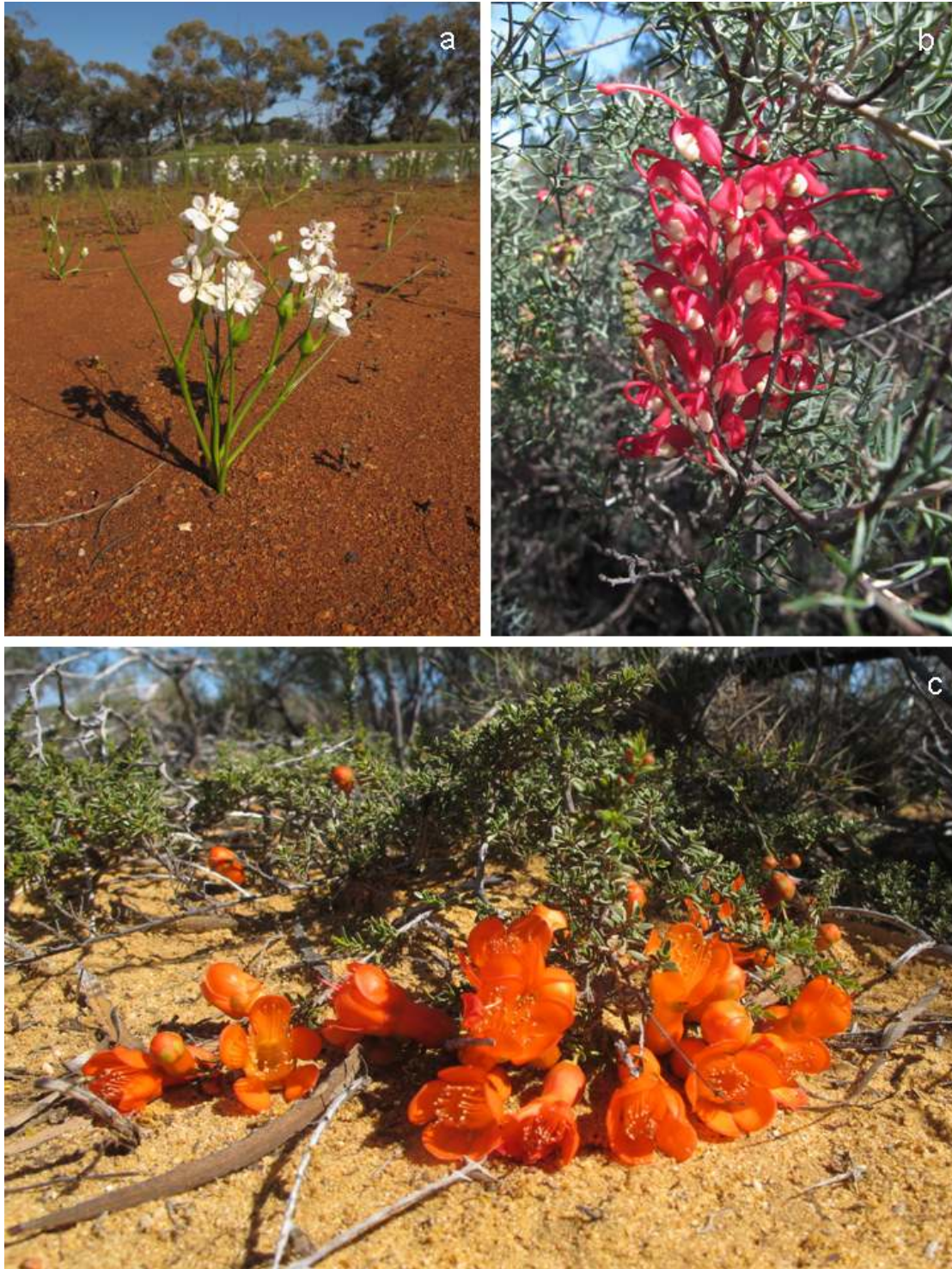
Figure 4. a) Wurmbea murchisoniana dominated the vegetation of an ephemeral wetland at Ularring Rock, b) Grevillea georgeana common on Banded Iron Formation ridges, c) Balaustion pulcherrimum common on the extensive yellow sandplains.