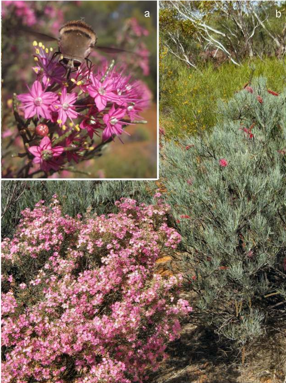
Figure 5. a) Bee fly (Family Bombyliidae) searching for nectar on Phebalium canaliculatum , b) Phebalium canaliculatum and Grevillea oligomera growing on yellow sandplain.

from mosaics of eucalypt woodland in the south to the more arid acacia shrublands of the interior.