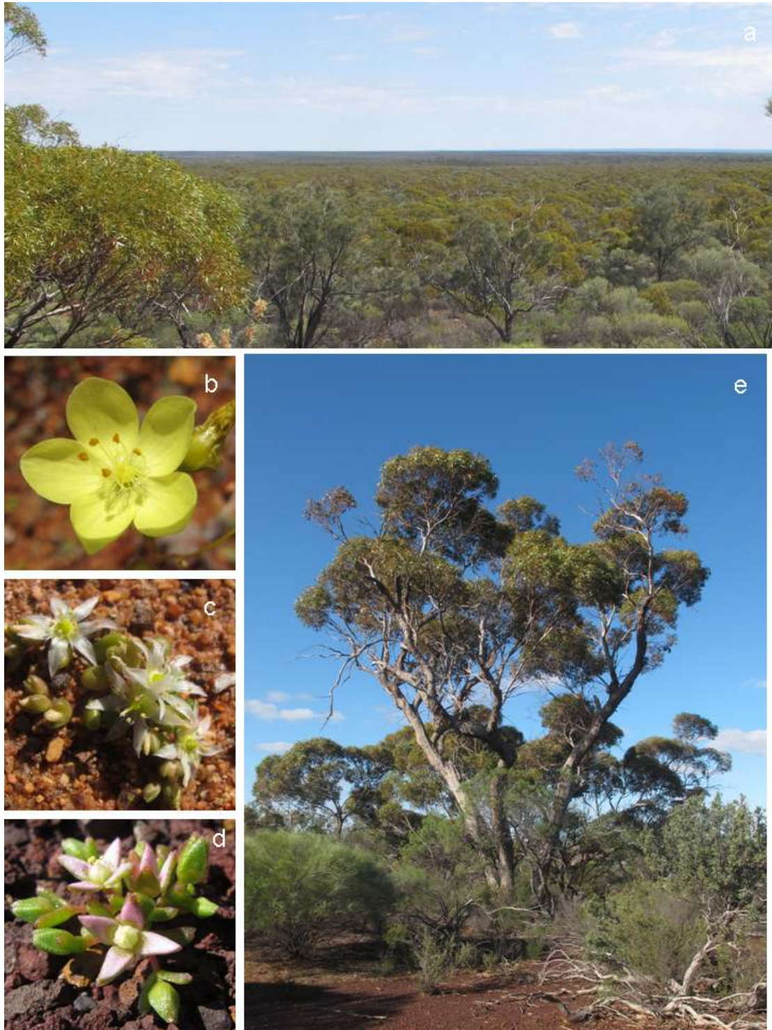
Figure 3. a) View across eucalypt woodlands which is one of the dominant vegetation types encountered on Credo, b) Drosera moorei and c) Calandrinia granulifera – both found in herblands on granite outwash areas, d) Gunniopsis saxicola and e) Eucalyptus oleosa (tree mallee) both found on lateritic ridges.