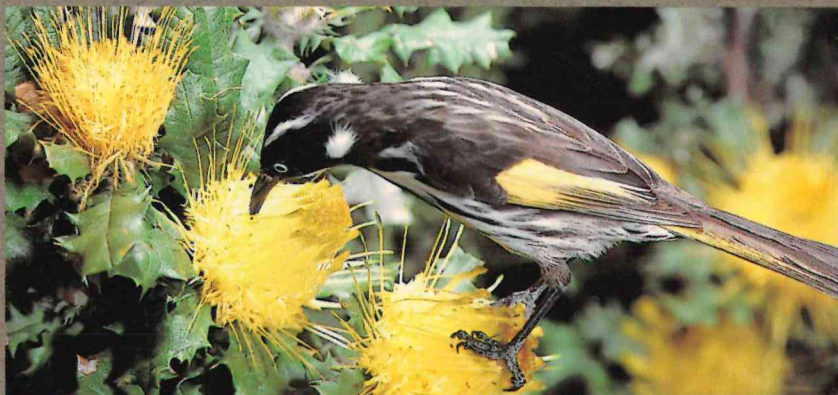
New Holland honeyeater