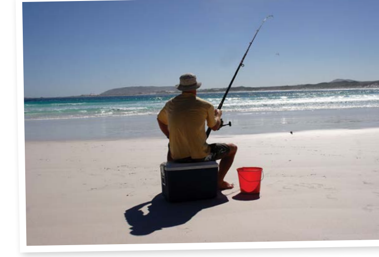
Above Fishing off Wharton Beach.

The marine environment of Western Australia's south coast is unique and includes outstanding natural values. The region supports diverse marine habitats, plants and animals, and is home to the Great Southern Reef – a system of temperate reefs dominated by kelp forests spanning more than 8000km from Kalbarri in Western Australia's Midwest, across Australia's southern coastline, and north as far as the subtropical waters of northern New South Wales. Australia's south-west marine environment is a global biodiversity hotspot, and the natural and cultural values found here provide a range of social and economic benefits, including generating employment and revenue for the region.