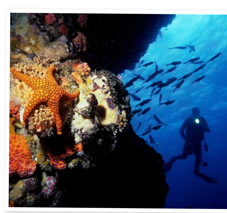
Above Diving.

Marine ecotourism activities, including dive charters and whale and dolphin watching, are increasingly popular and enable visitors to better appreciate and understand the region's natural values.