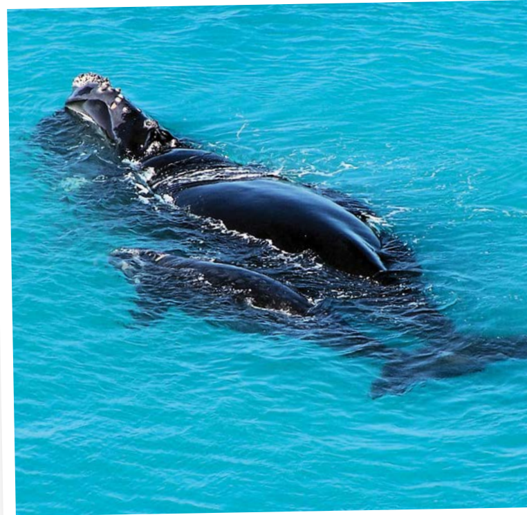
Top Marine parks provide for biodiversity conservation.

Some human activities can pollute, degrade and deplete the marine environment and put the survival of marine plants and animals at risk. Degradation of the marine environment can happen incrementally over long periods of time as populations and coastal water usage grows; or more suddenly such as when oil or other substances are accidentally released into the water. Marine parks provide tenure, long-term funding and a range of management tools to help to conserve marine ecosystems so that we can continue to appreciate and enjoy these areas into the future.