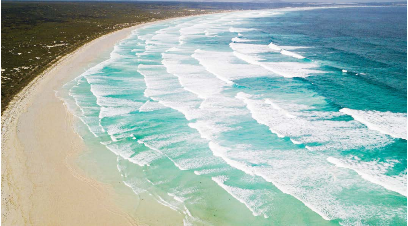
Part of the spectacular south coastline.