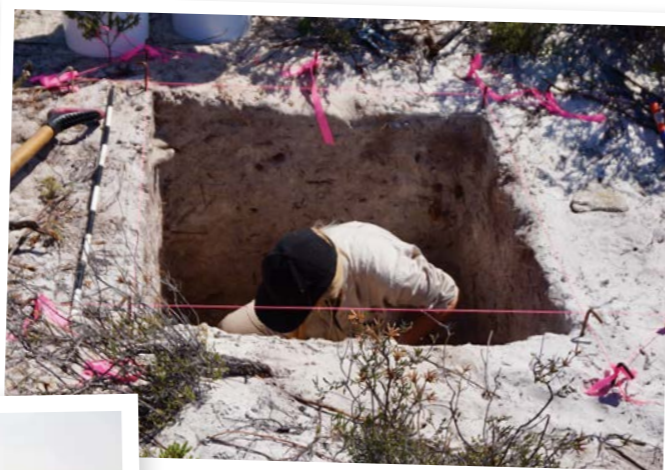
Above Carrying out a dig for Aboriginal artefacts.

The WA Mirning Native Title holders , who have exclusive and non-exclusive rights over areas of land to the low water mark between Point Dover and the WA/SA border.