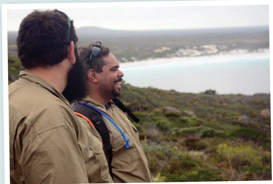
Left Rangers.