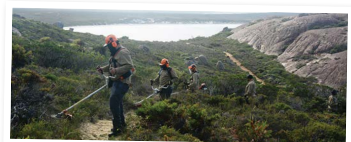
Tjaltjraak Rangers brushcutting.

Native title can be extinguished (i.e. recognition refused) because of things government has done, or allowed others to do, over a particular area or areas that are inconsistent with native title. If native title is extinguished over a particular area, it does not necessarily mean that native title never existed in that area, or that traditional law and customs are not still practised there. For example, the vesting of national parks in the south-west and Great Southern legally extinguish native title rights, but customary activities are still carried out in those parks.