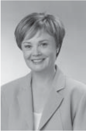
The Hon Dr Judy Edwards Minister for the Environment and Heritage