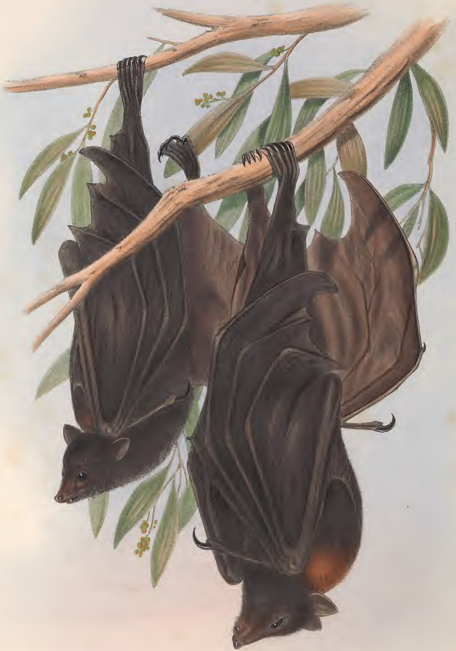
PTEROPUS FUNERÆUS; Temm.