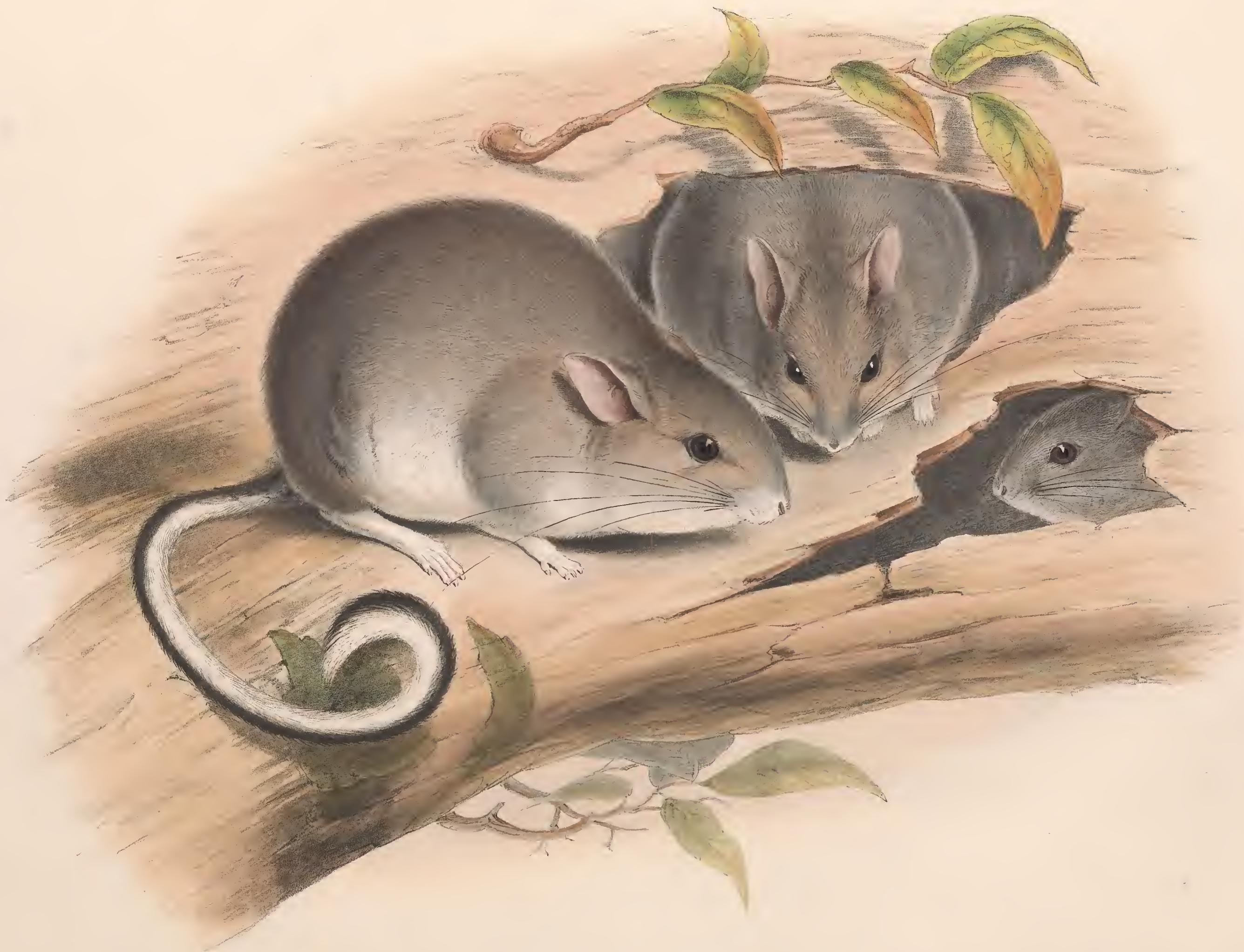
HAPALOTIS ALBIPES, Licht.

J. Gould and H. C. Richter, del et lith.