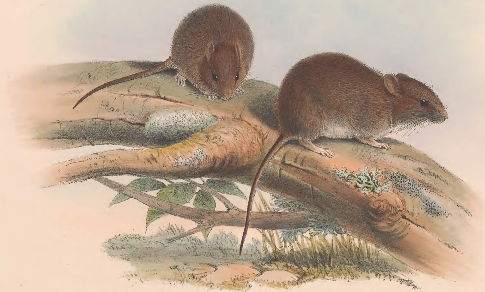
MUS NANUS, Gould