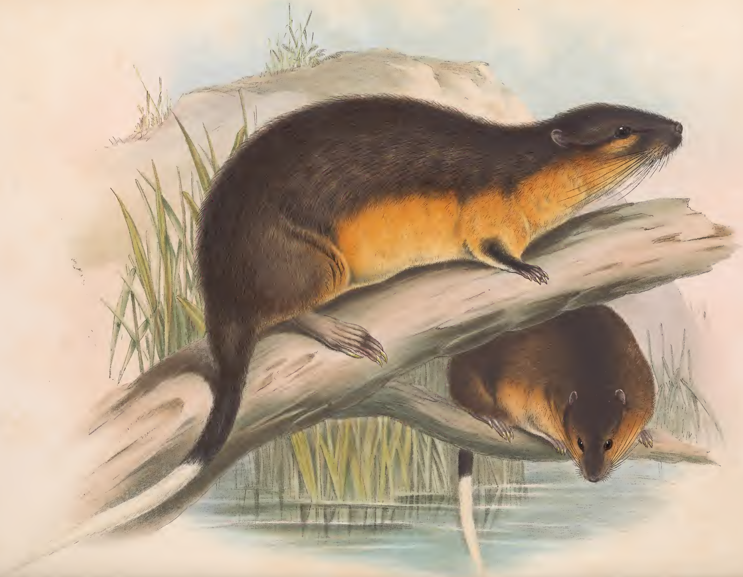
HYDROMYS CHRYSODACTYLUS (MILL.)