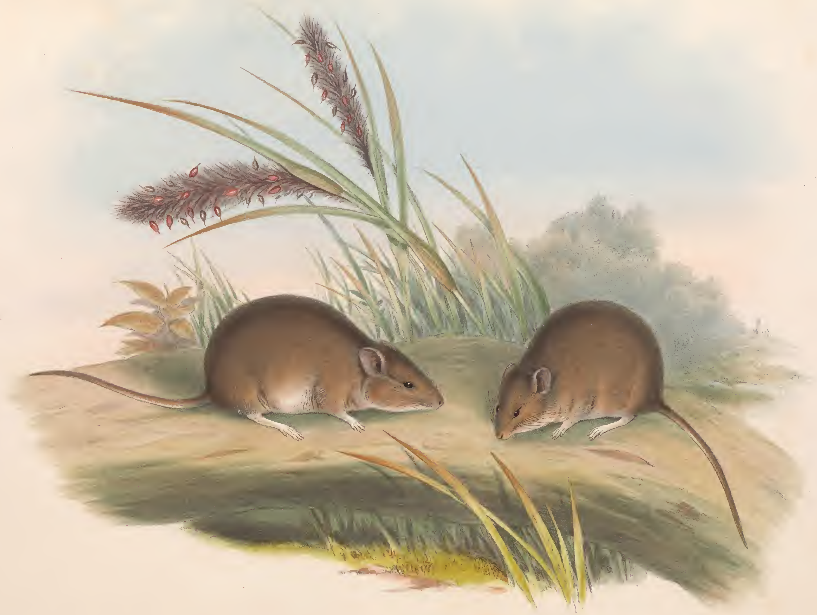
MUS GOULDI, Waterh.