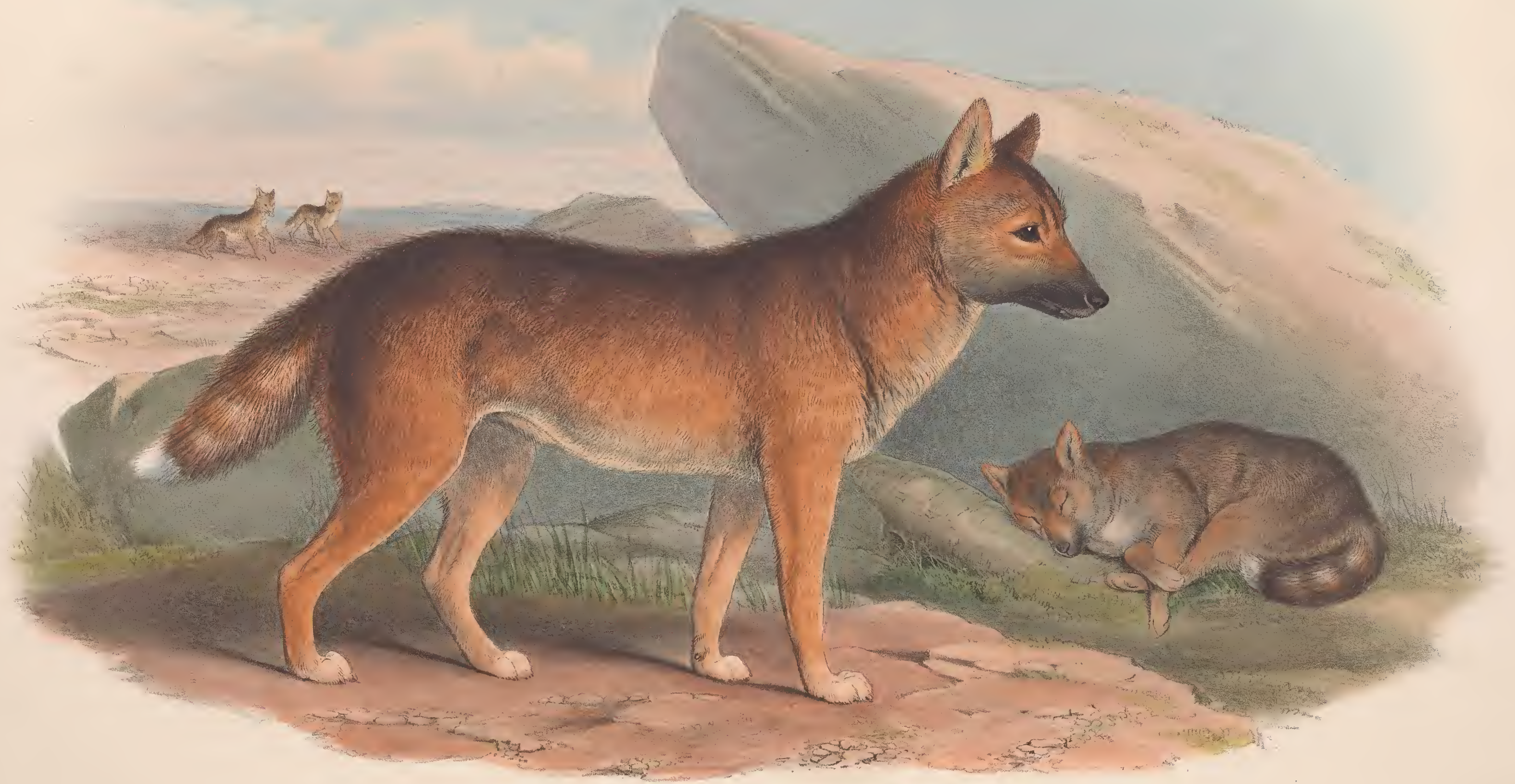
CANIS DINGO, Blumenb.