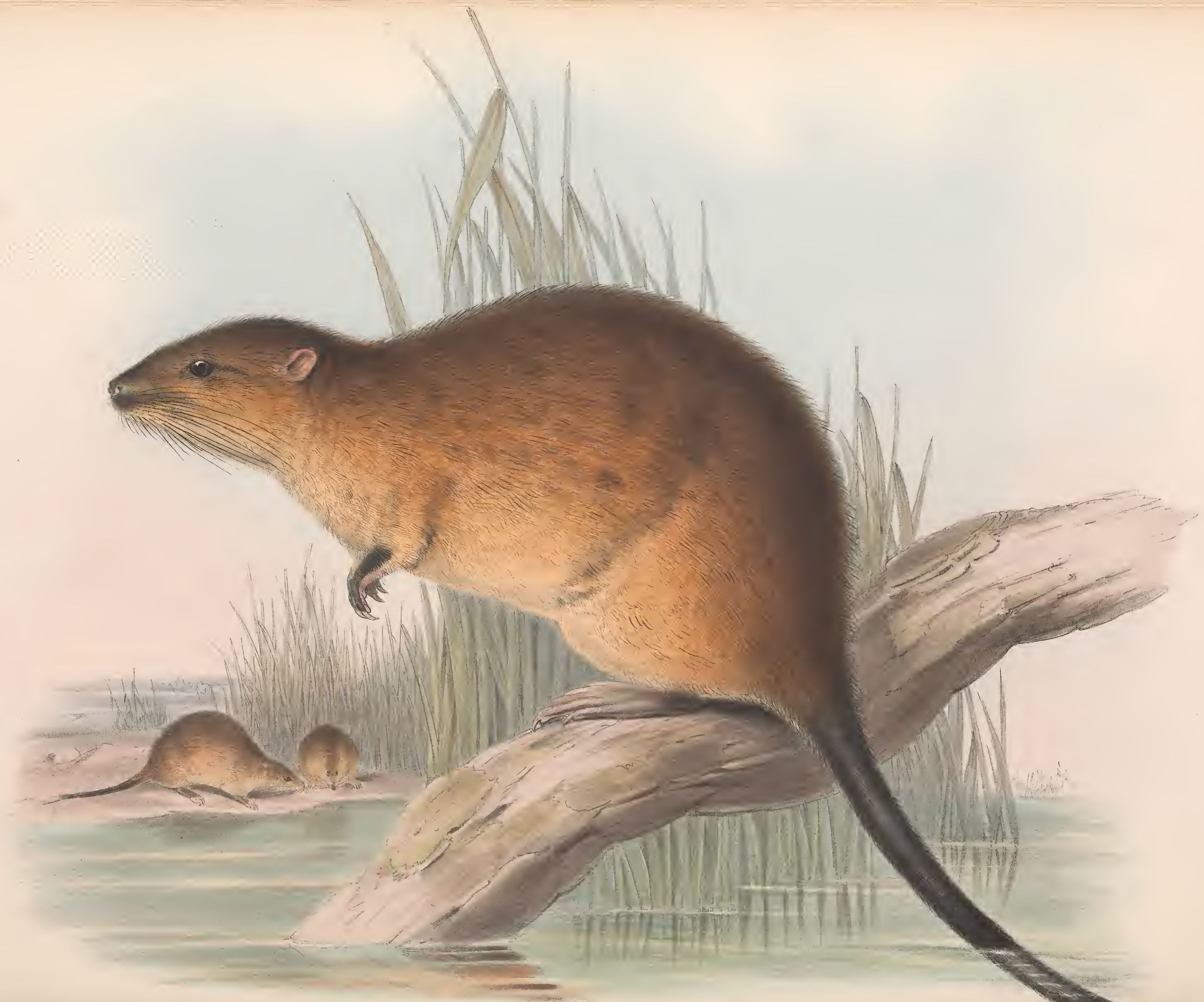
HYDROMYS FLINDLOVATTIS, Gould