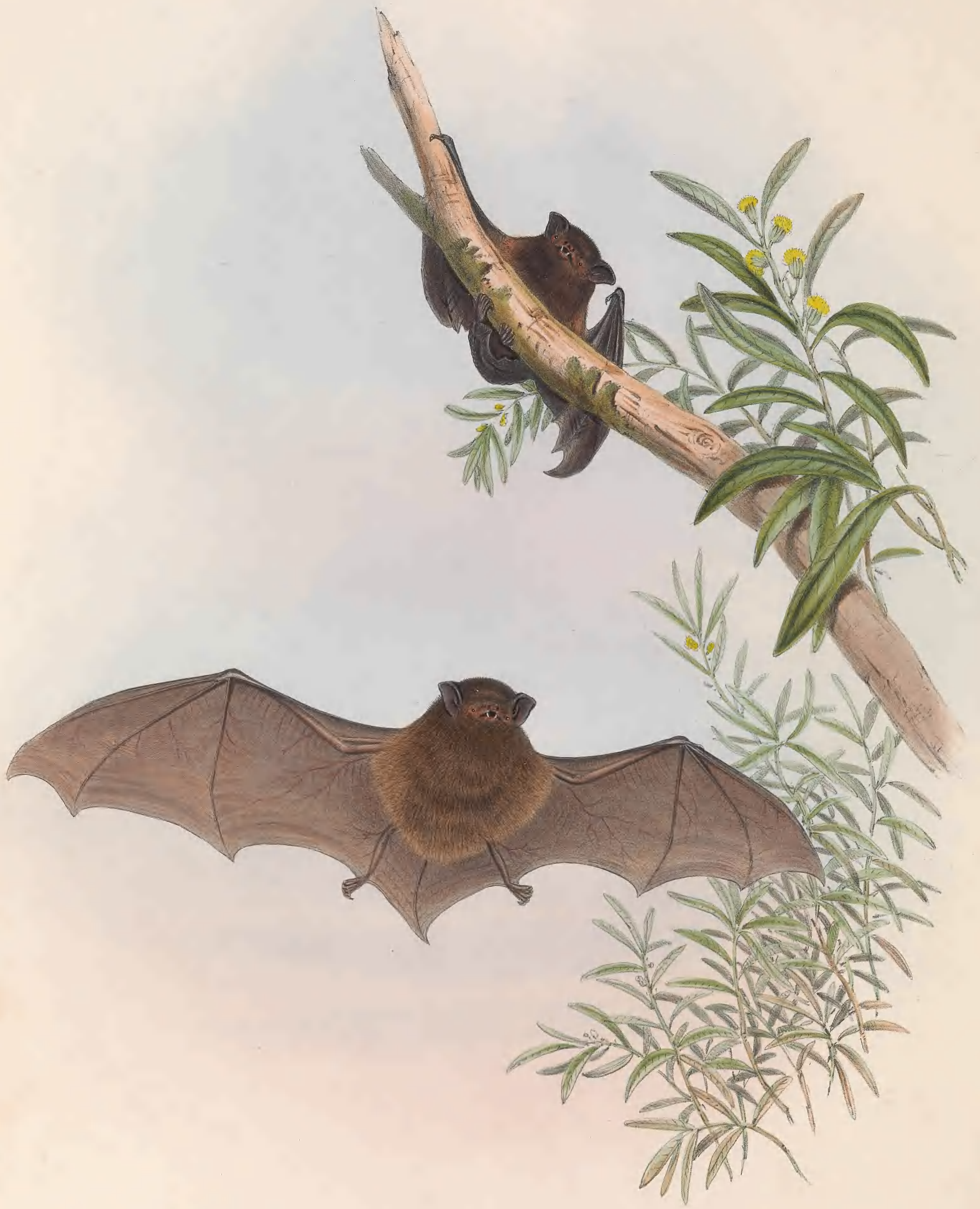
SCOTOPHILUS MICRODON, Tomes .

J. Gould and H. C. Richter, del. et lith.