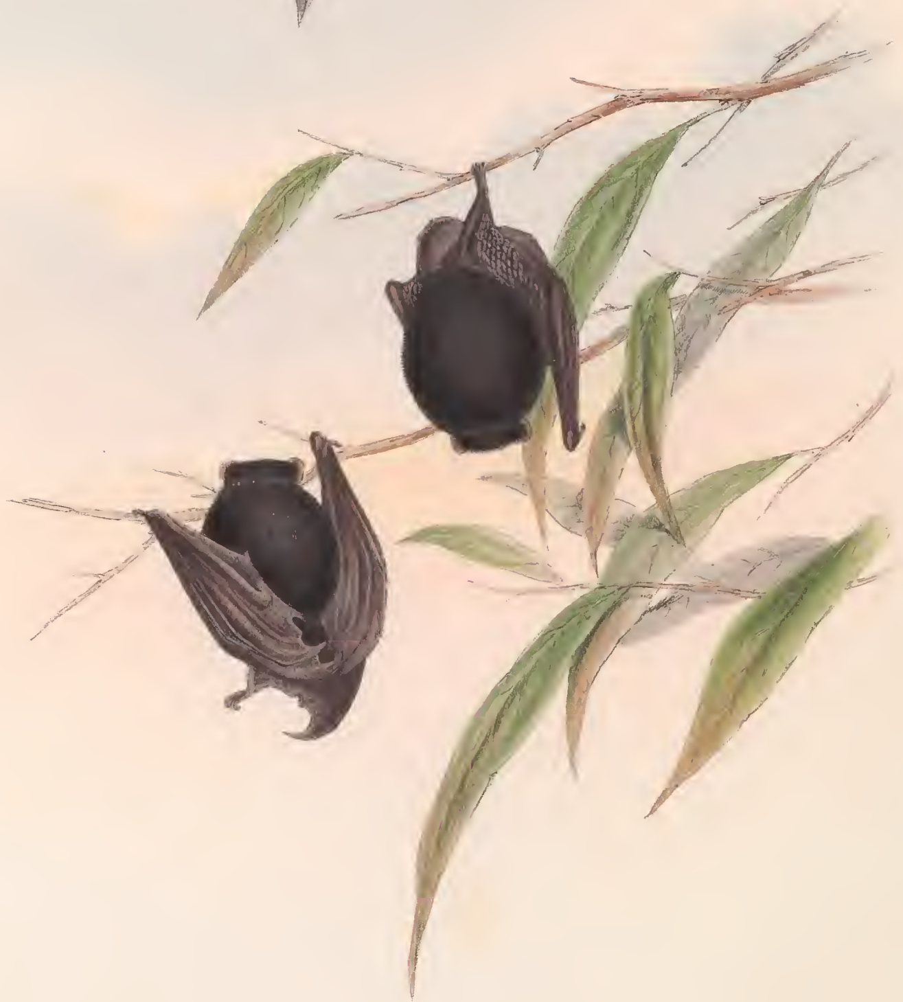
SCOTOPHILUS PICATUS, Gould.