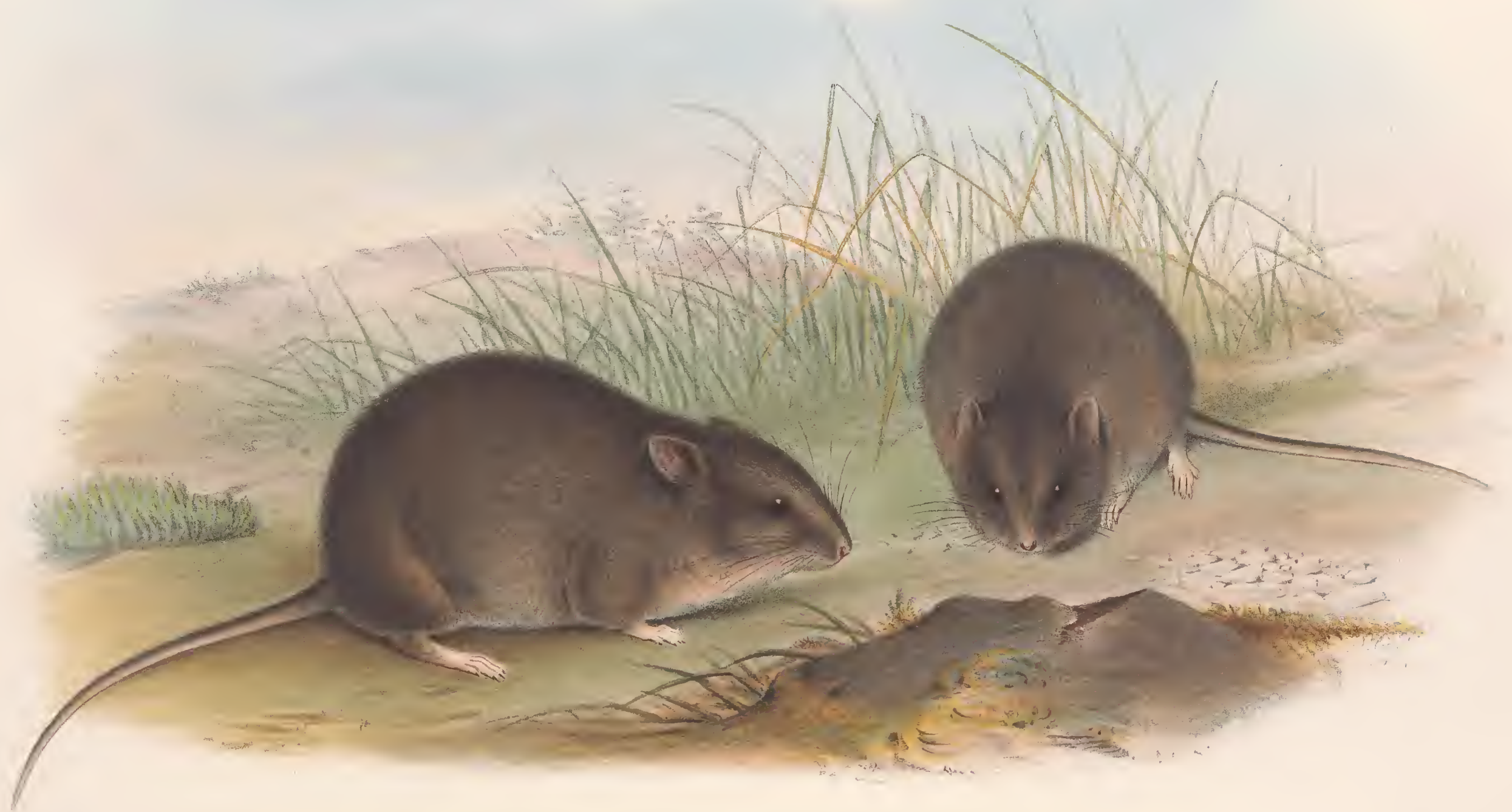
MUS LINEOLATUS, Coold