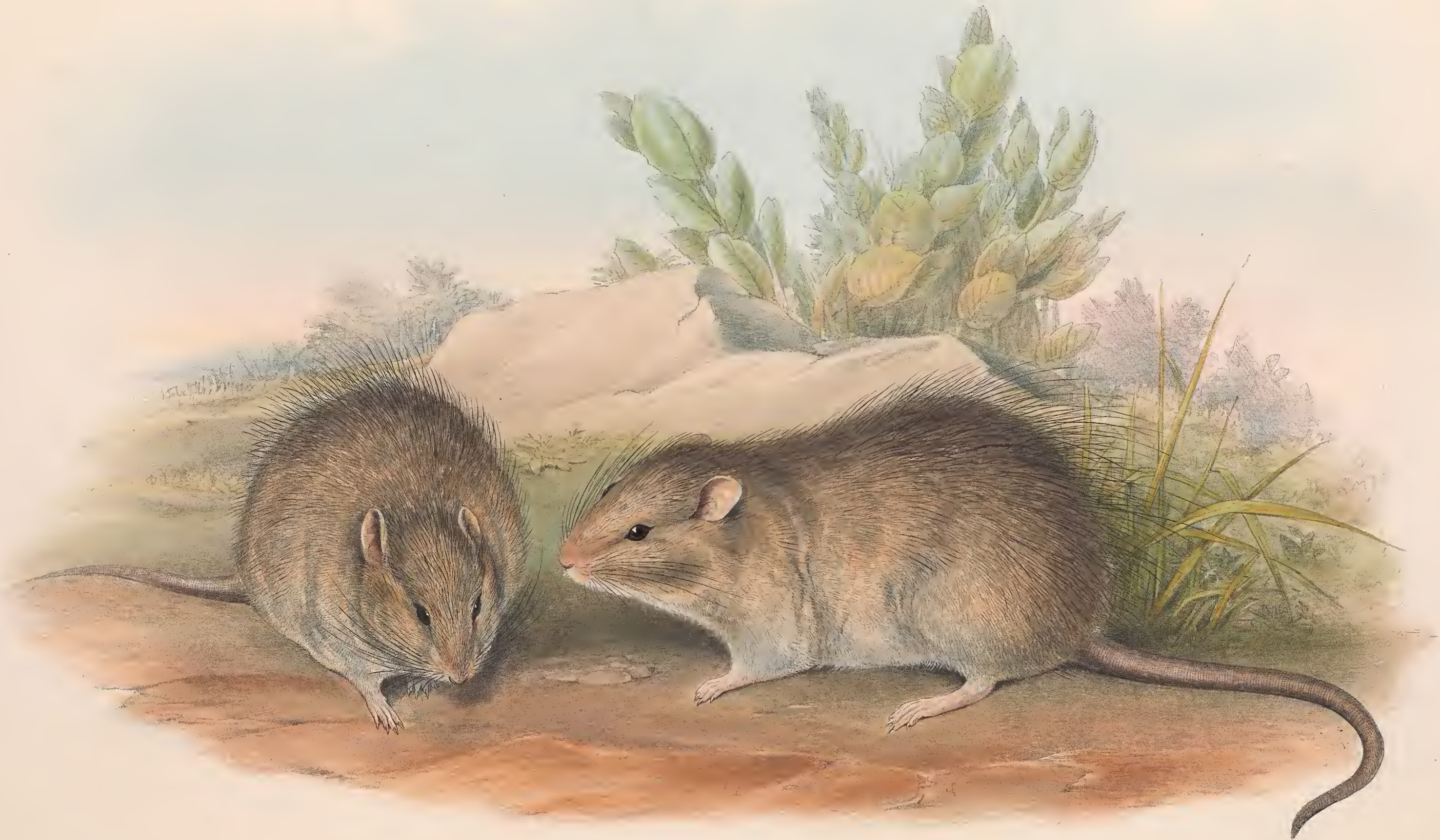
MUS LONGIPILIS, Gould .