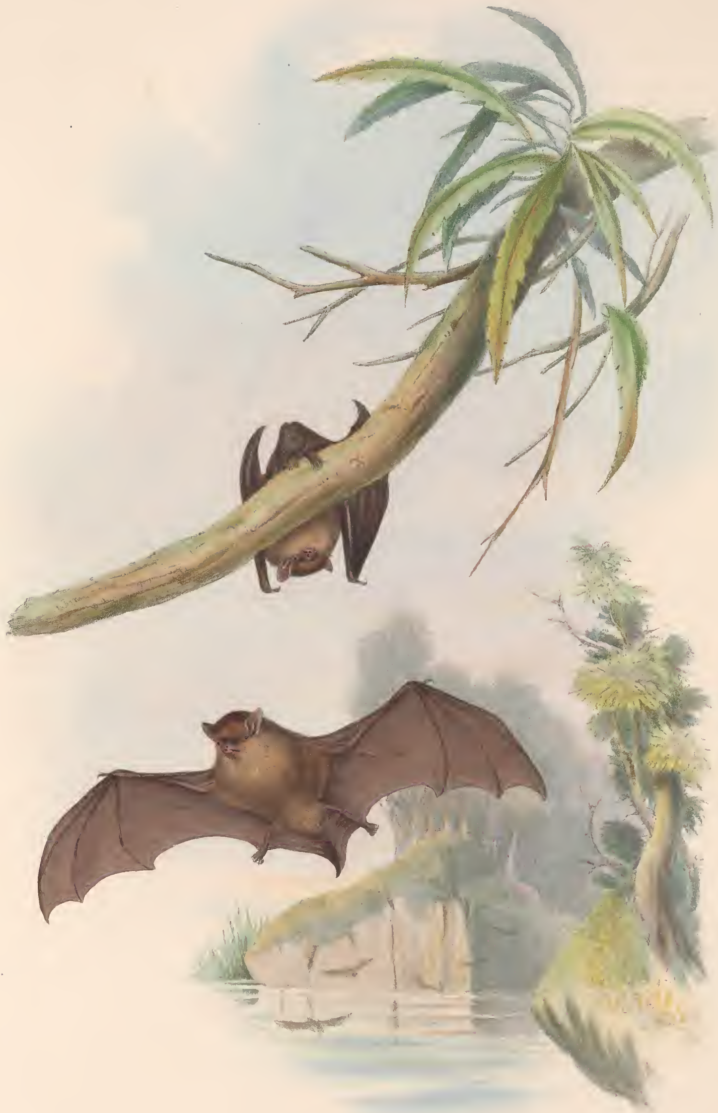
SCOTOPHILUS PUMILUS, Gray

J. Gould and H.C. Richter, del. et lith.