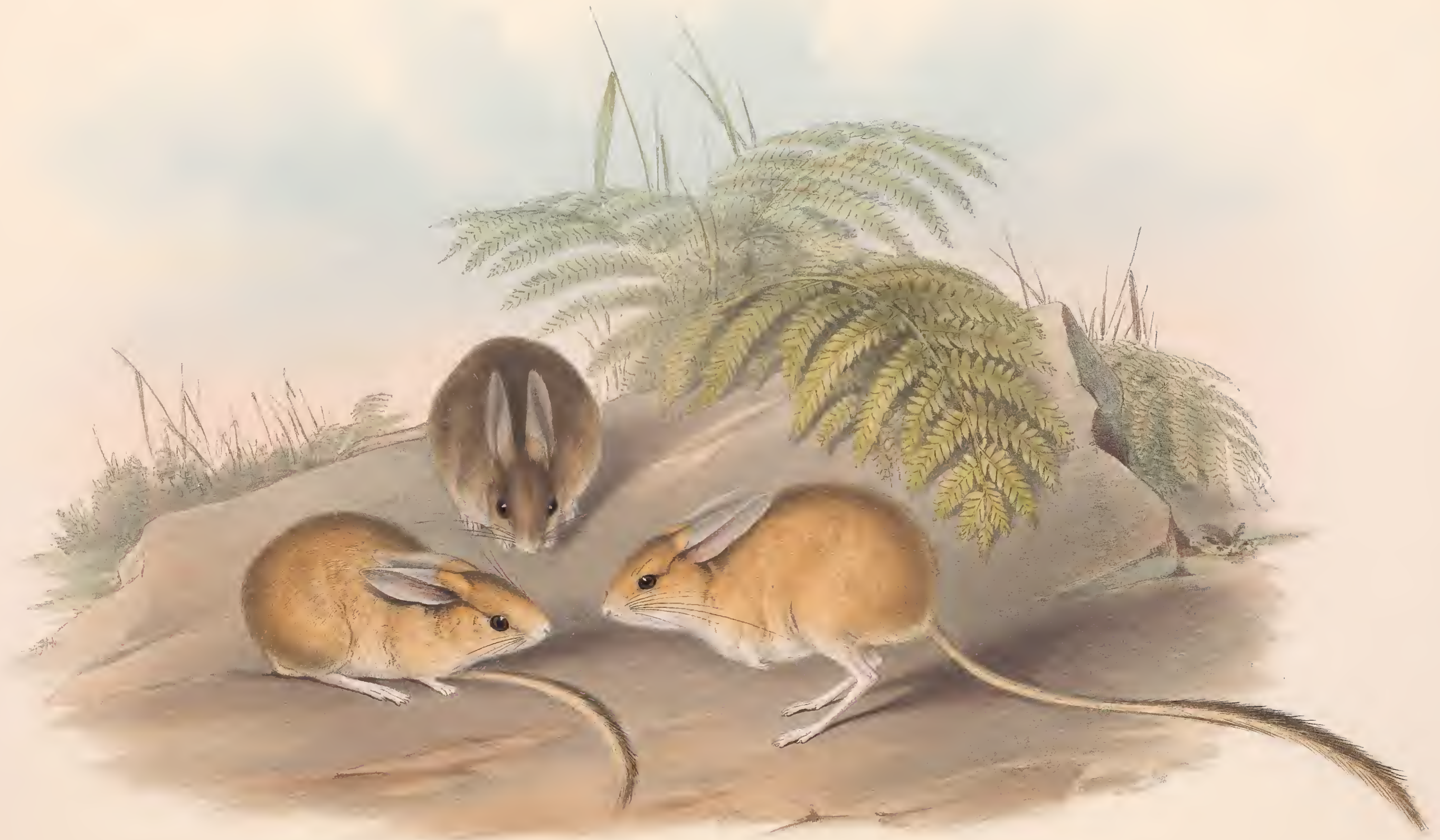
HAPALOTIS CERVINUS, Gould.

J. Gould and W. C. Richter, del et lith.