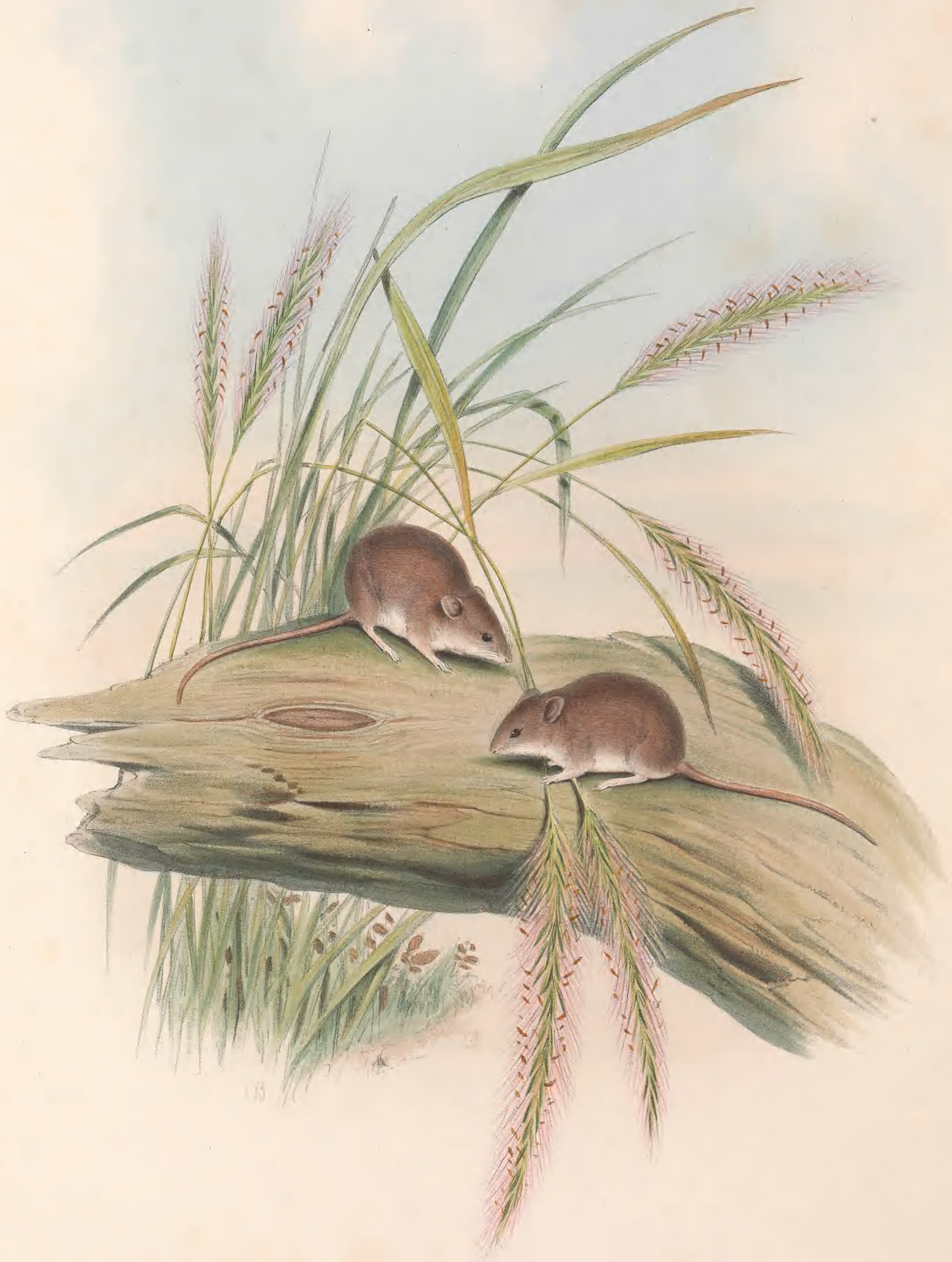
MUS DELICATULUS, Gould.