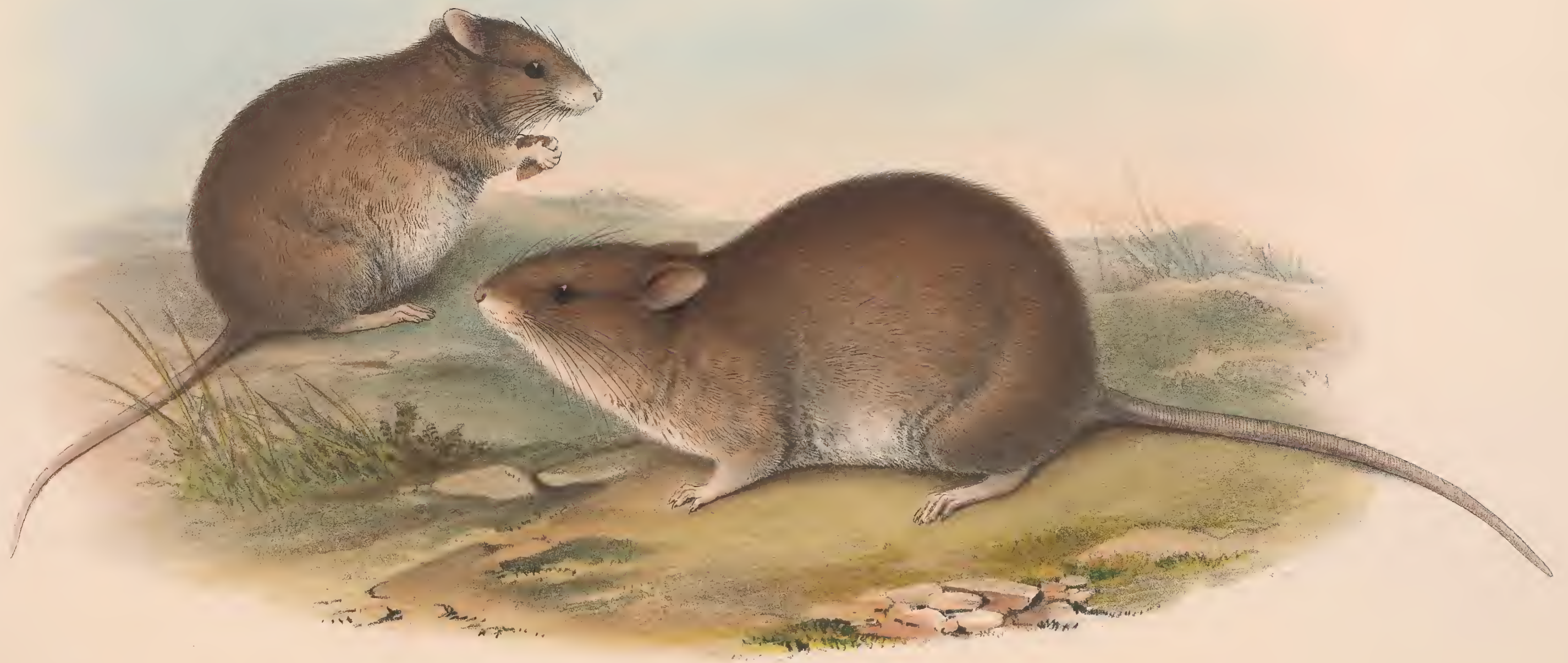
MUS ASSUMENS, Coold