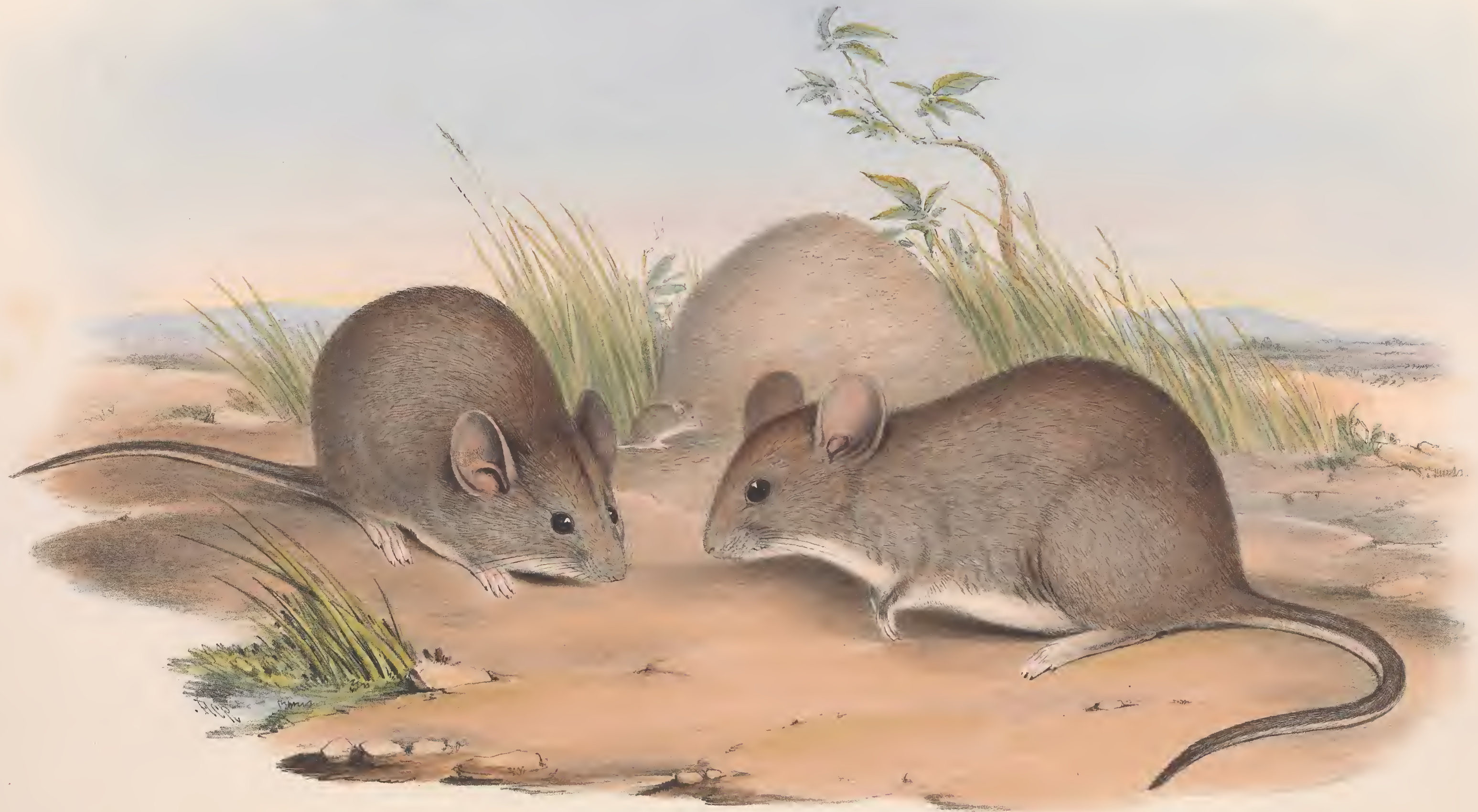
HAPLOTIS CONDITOR: Gould

J. Gould sculp. H.C. Richter del. et lith.