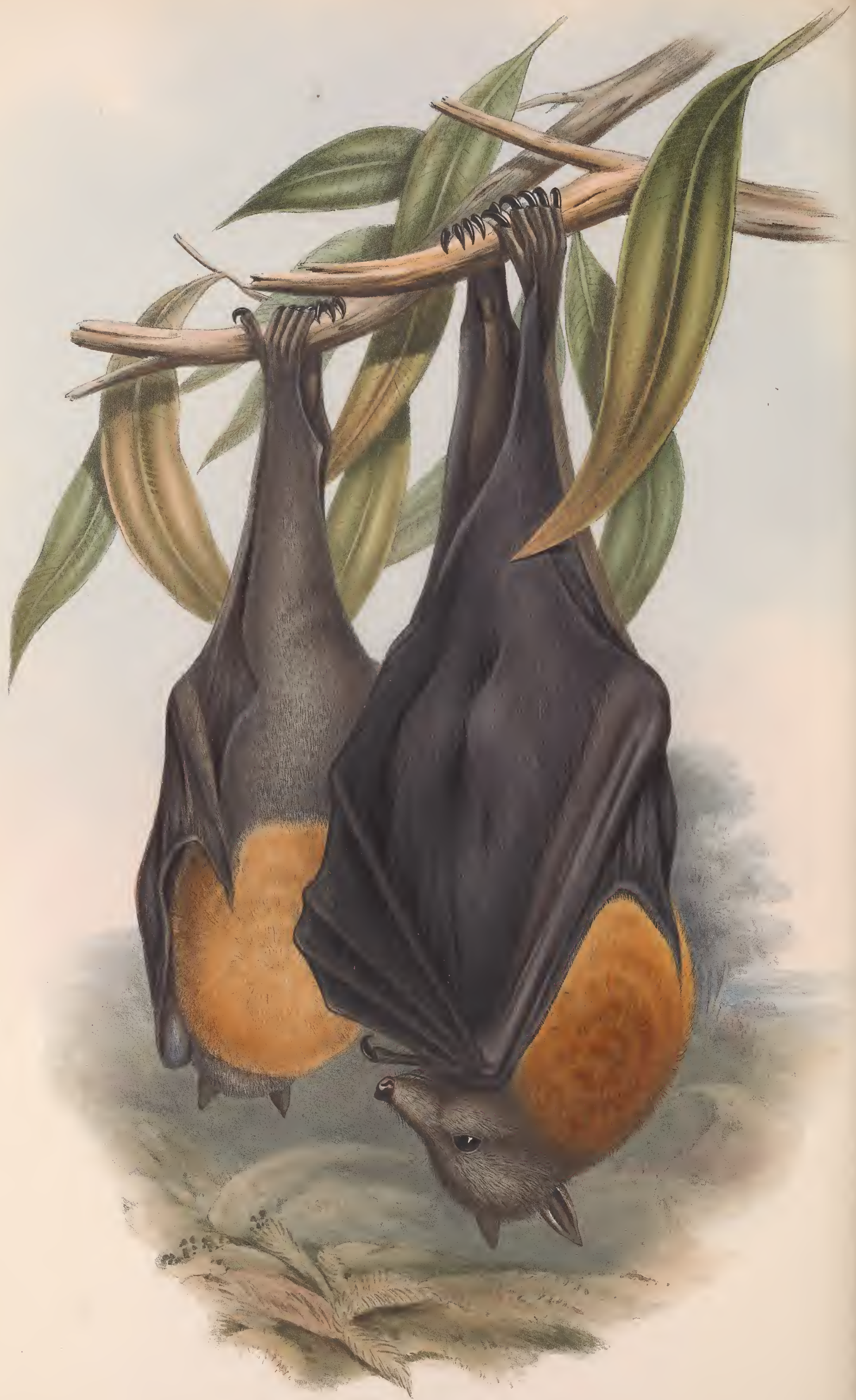
PTEROPUS POLIOCEPHALUS; Temm.