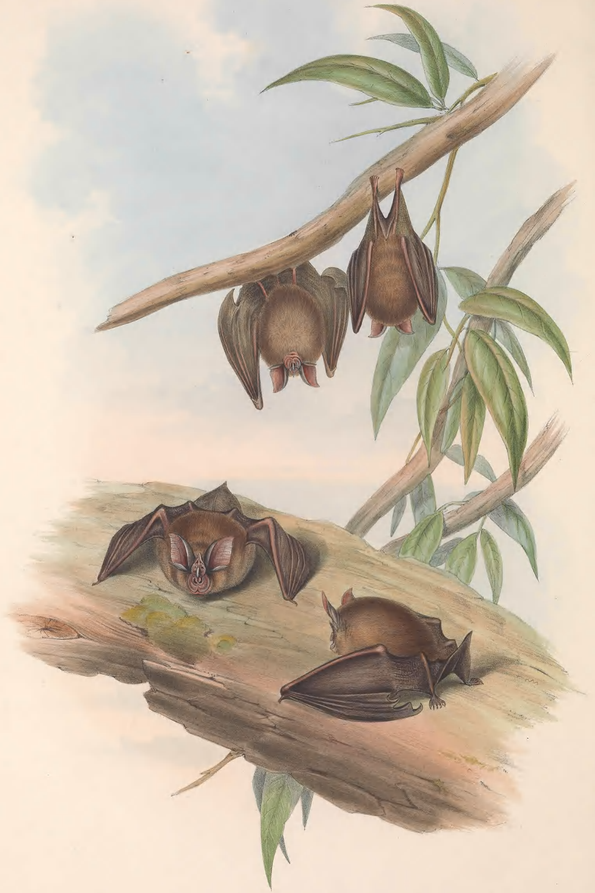
RHINOLOPHUS MEGAPHYLLUS, Gray