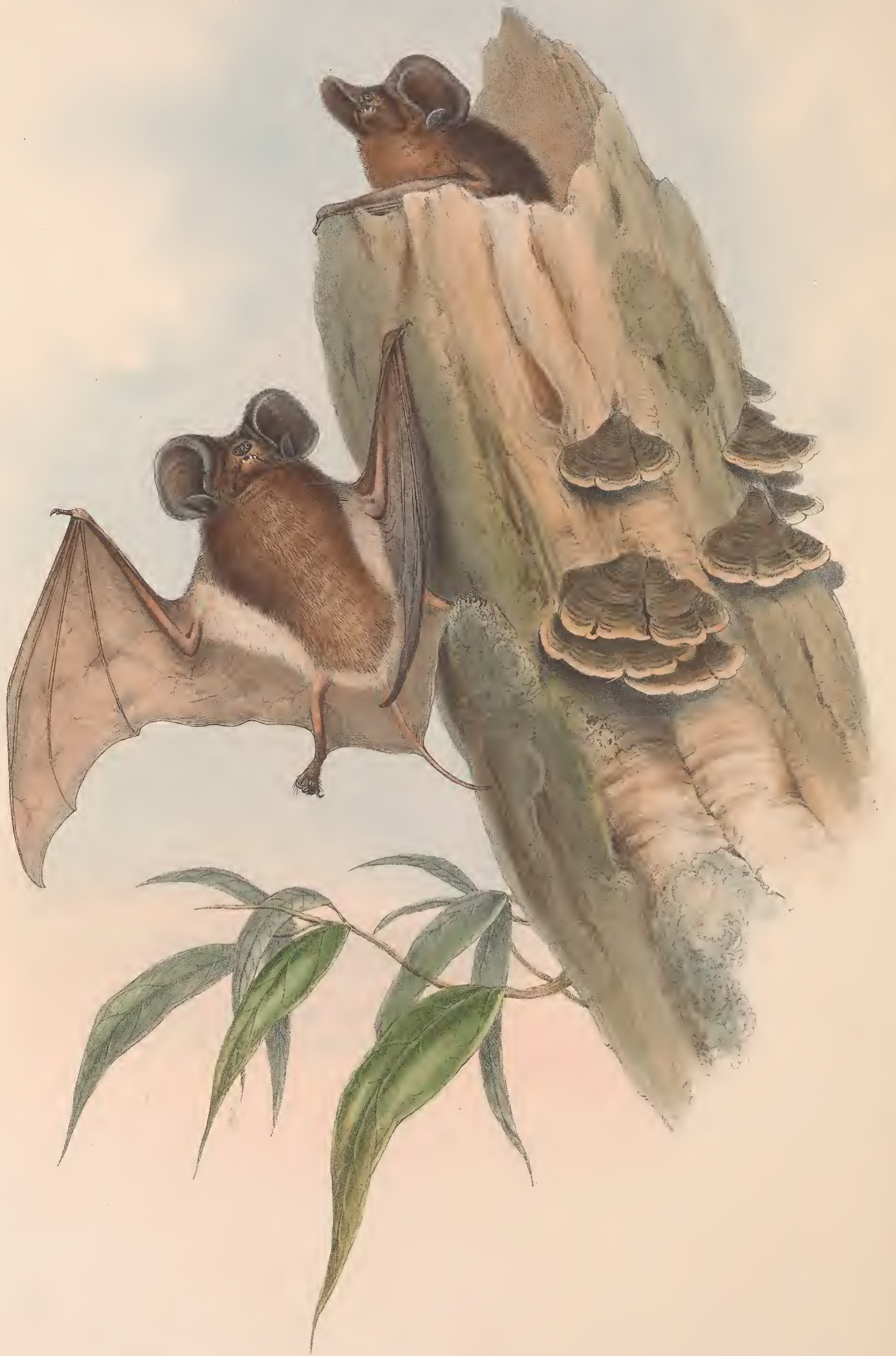
• MOLOSSUS AUSTRALIS, Gray