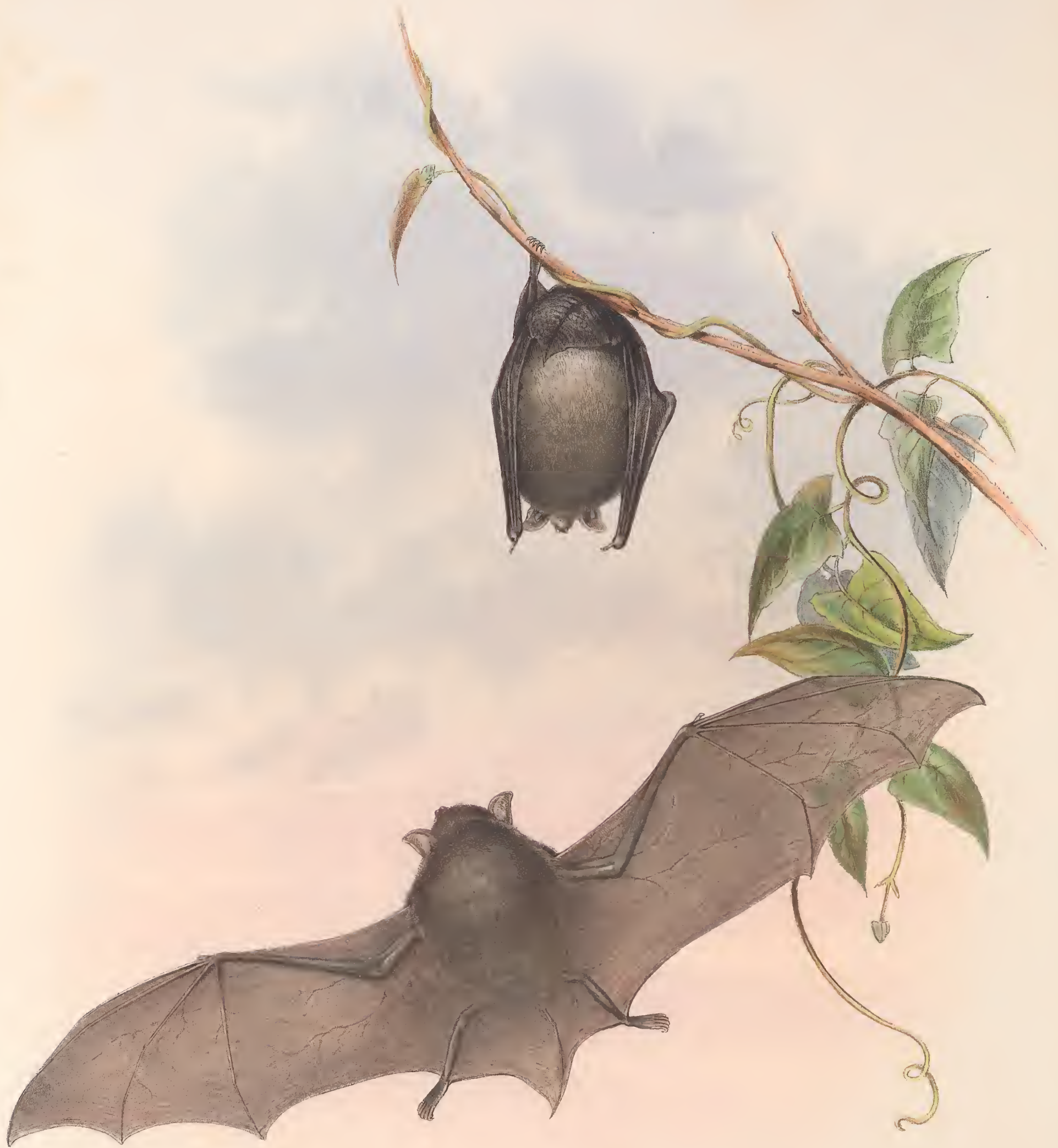
VEPERTILIO MACROPUS, Gould