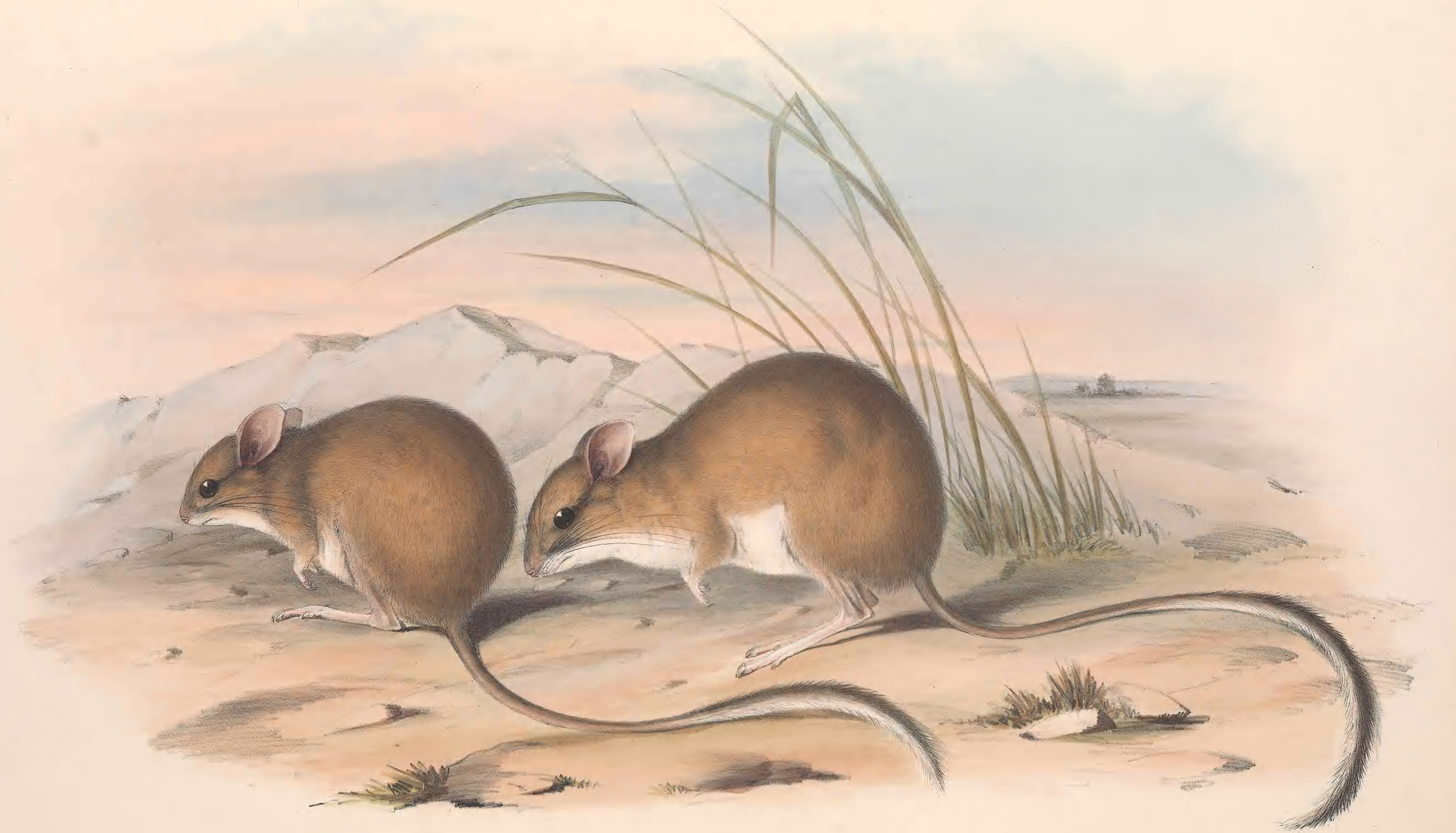
HAPALOTIS LONGICAUDATA: Gould.