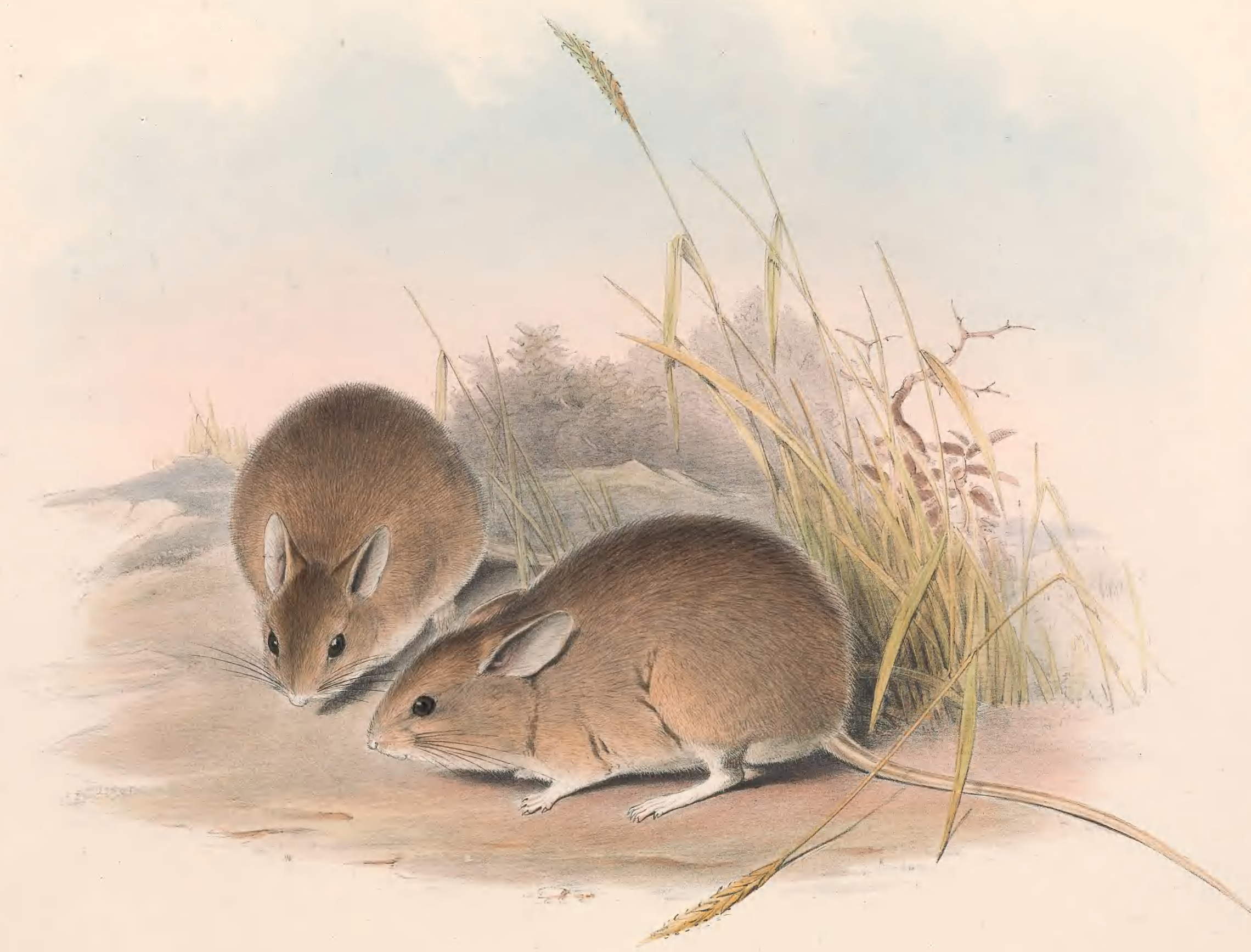
HAPALOTIS MURINUS, Gould.

J. Gould and H. C. Richter del. et lith.