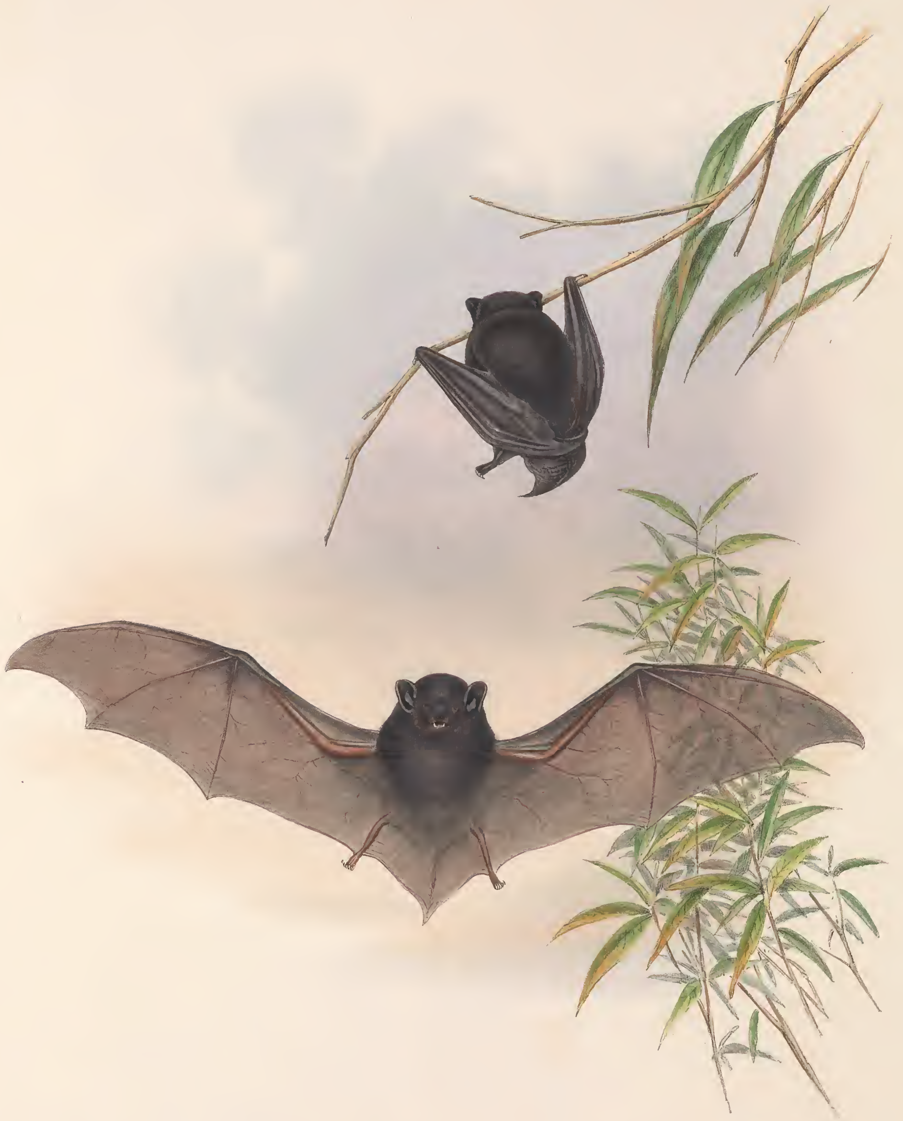
SCOTOPHILUS NIGROGRISEUS, Gould.