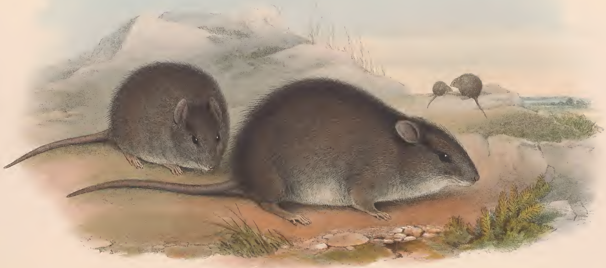
MUS SORDIDUS, Gould