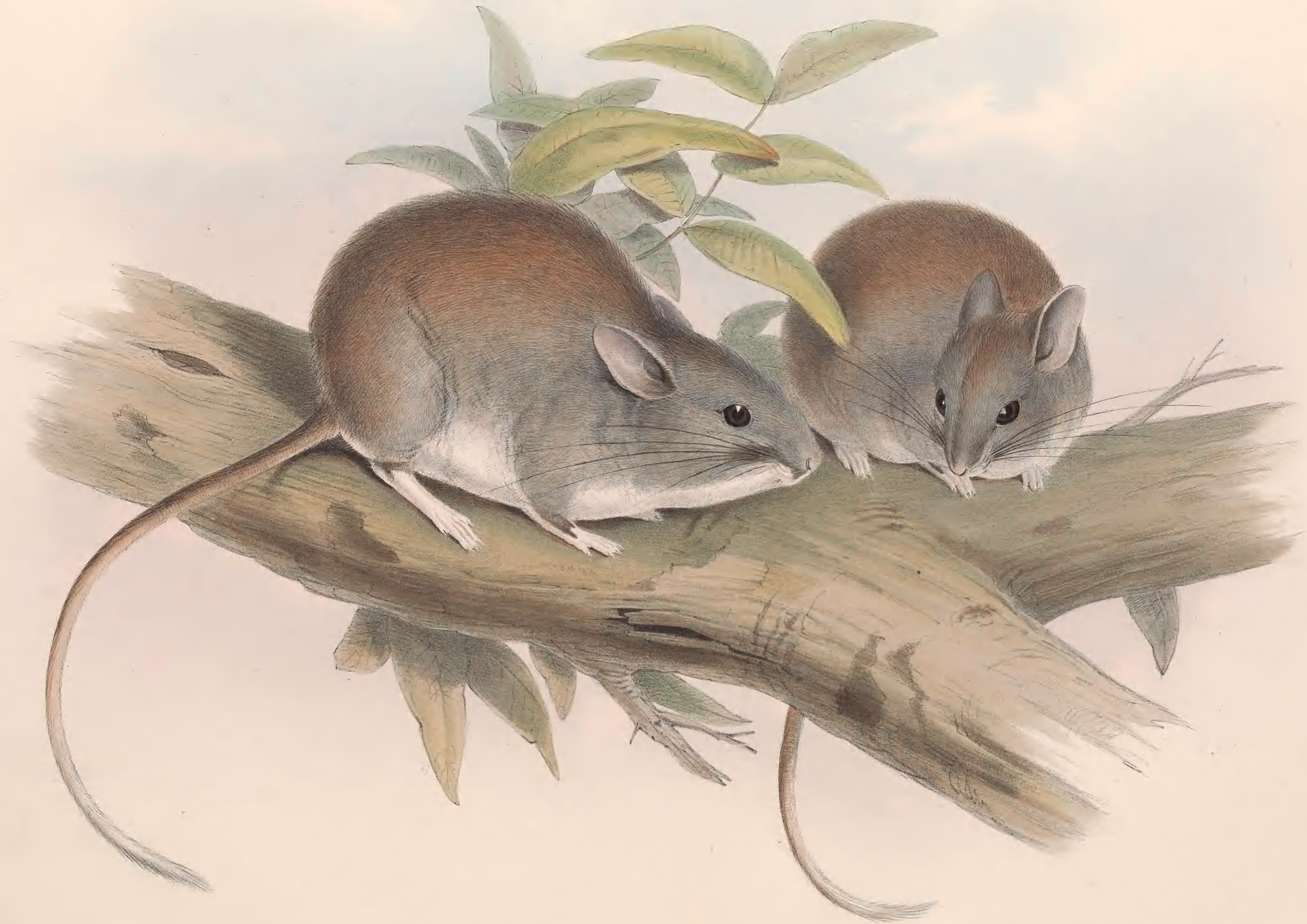
HAPALOTIS AFRICANA, Gould.