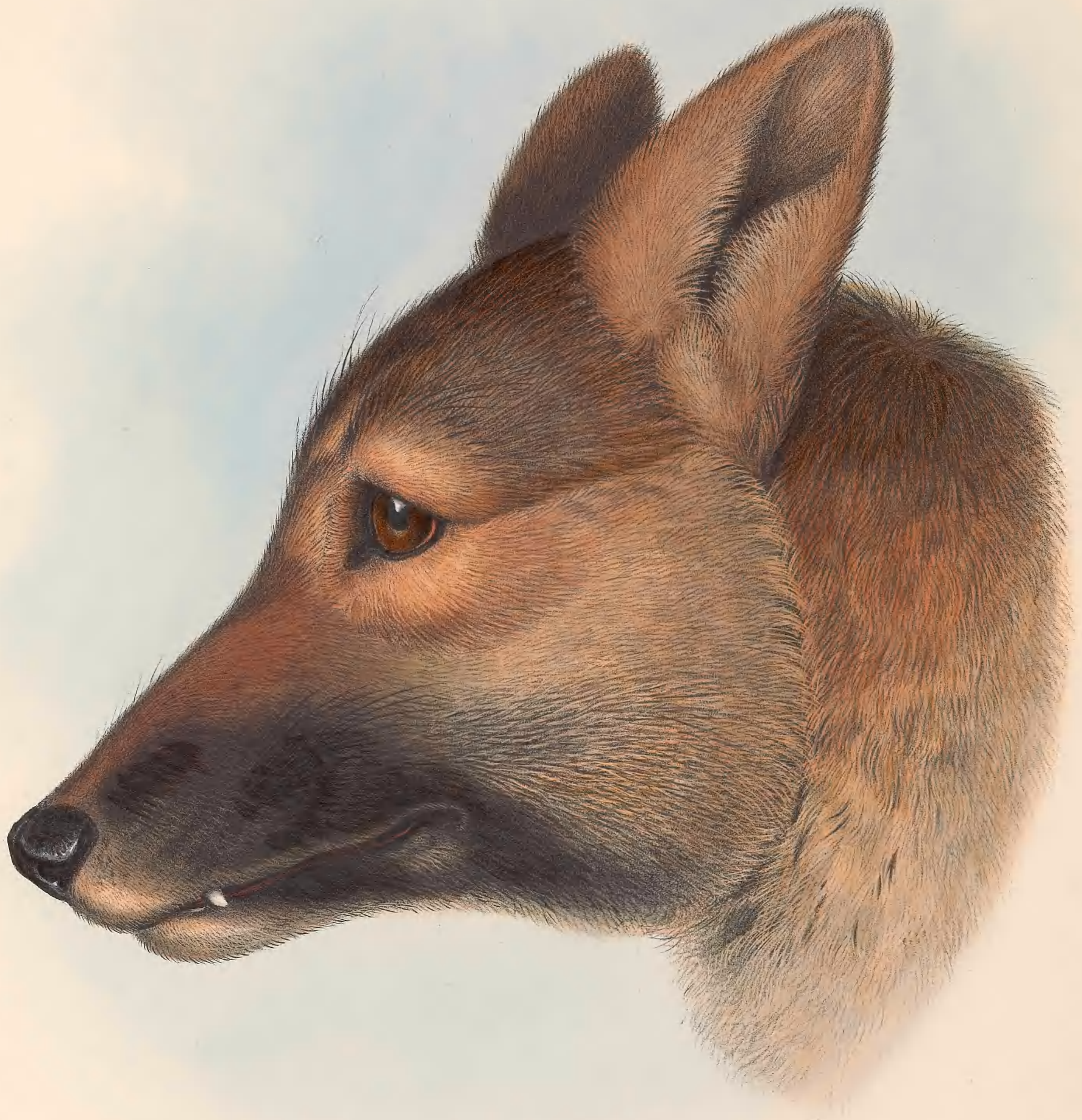
CANIS DINGO, Blumenb.

J. Gould and H. C. Richter, del. et. 1877.