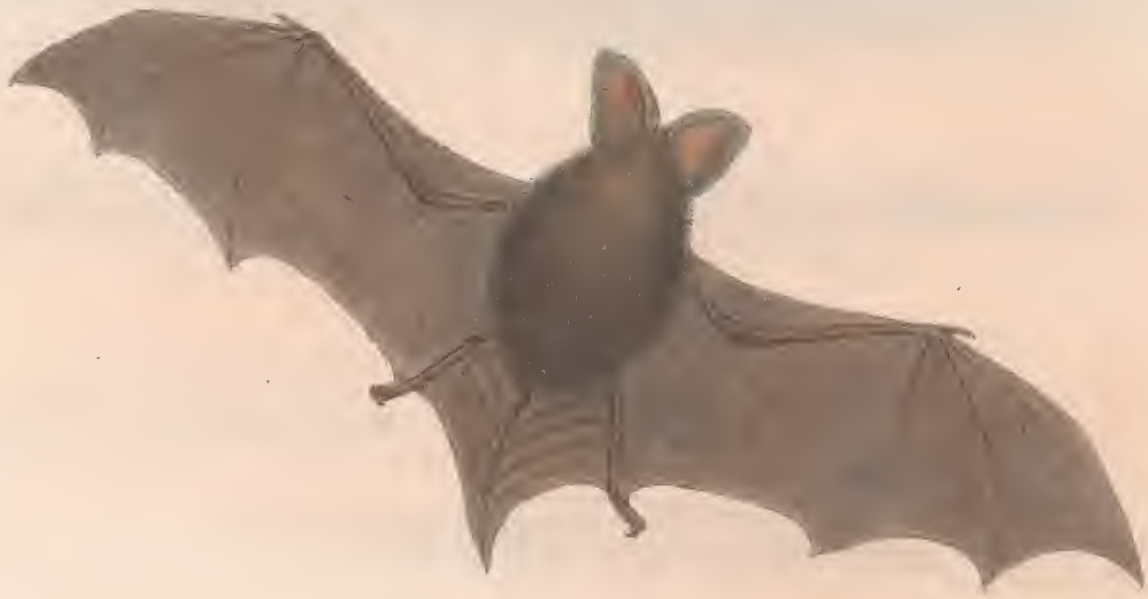
NYCTOPHILUS UNICOLOR, Tomes.

J. Gould and H. C. Richter, del. et lith.