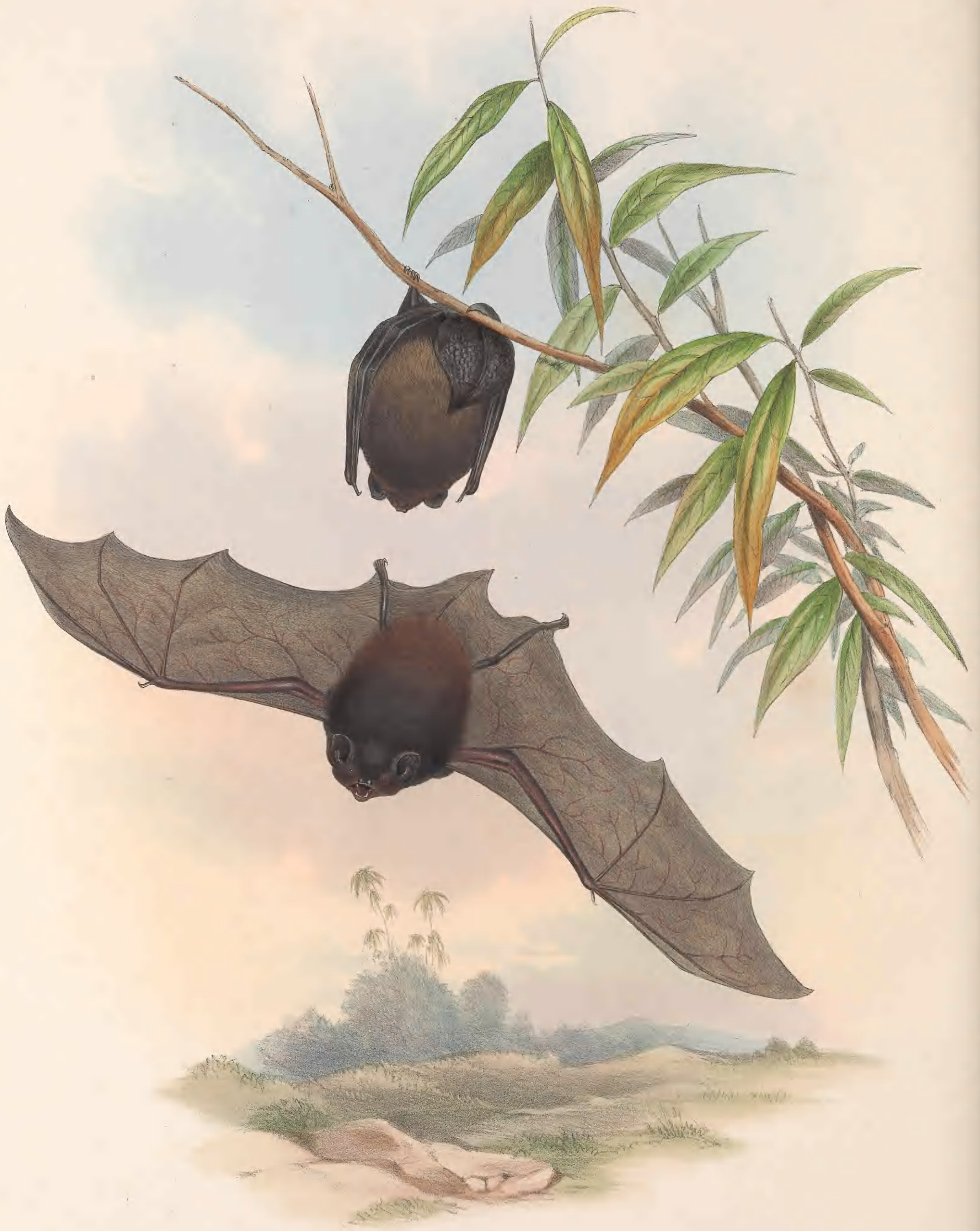
SCOTOPHILUS GOULDI, Gray