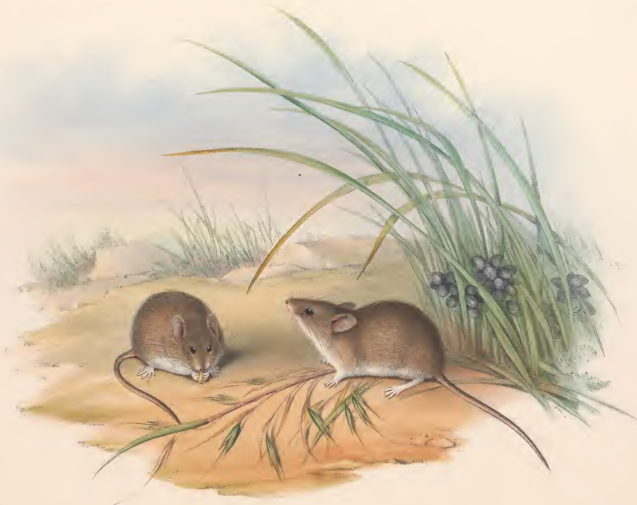
MUS NOVE-HOLLANDI, Waterh