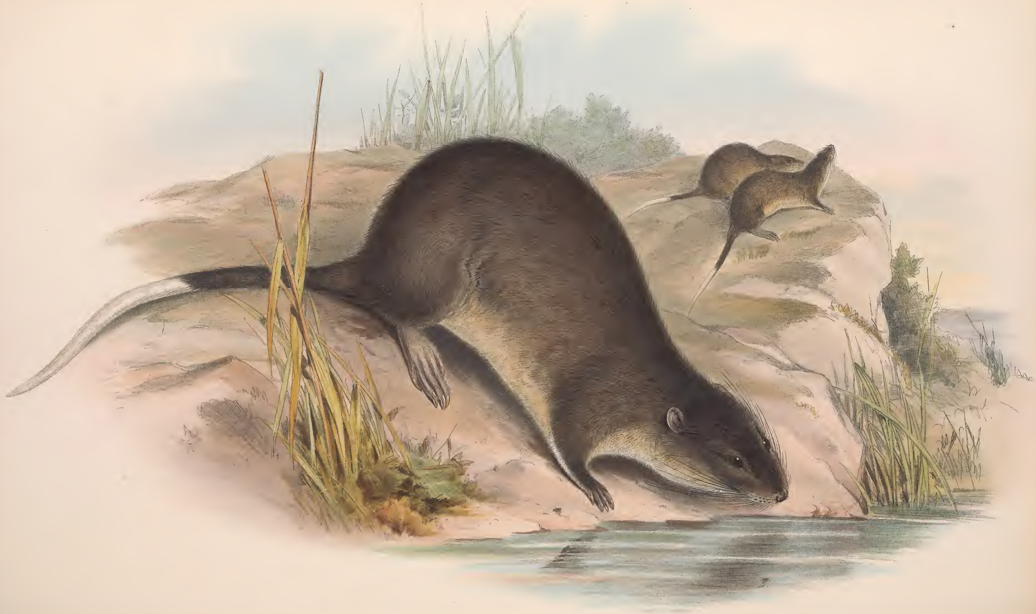
HYDROMYS LEUCOGASTER, Geoff.