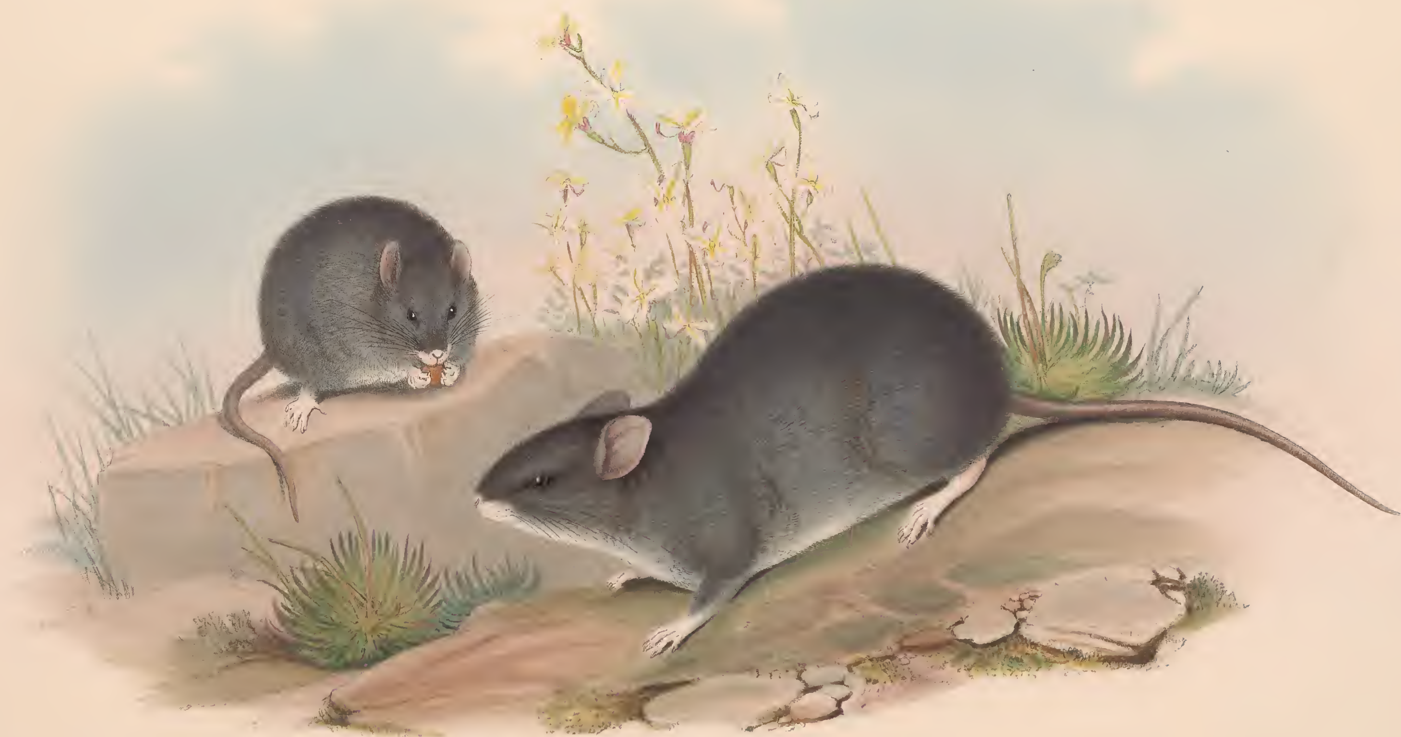
MUS MANICATUS, Coult