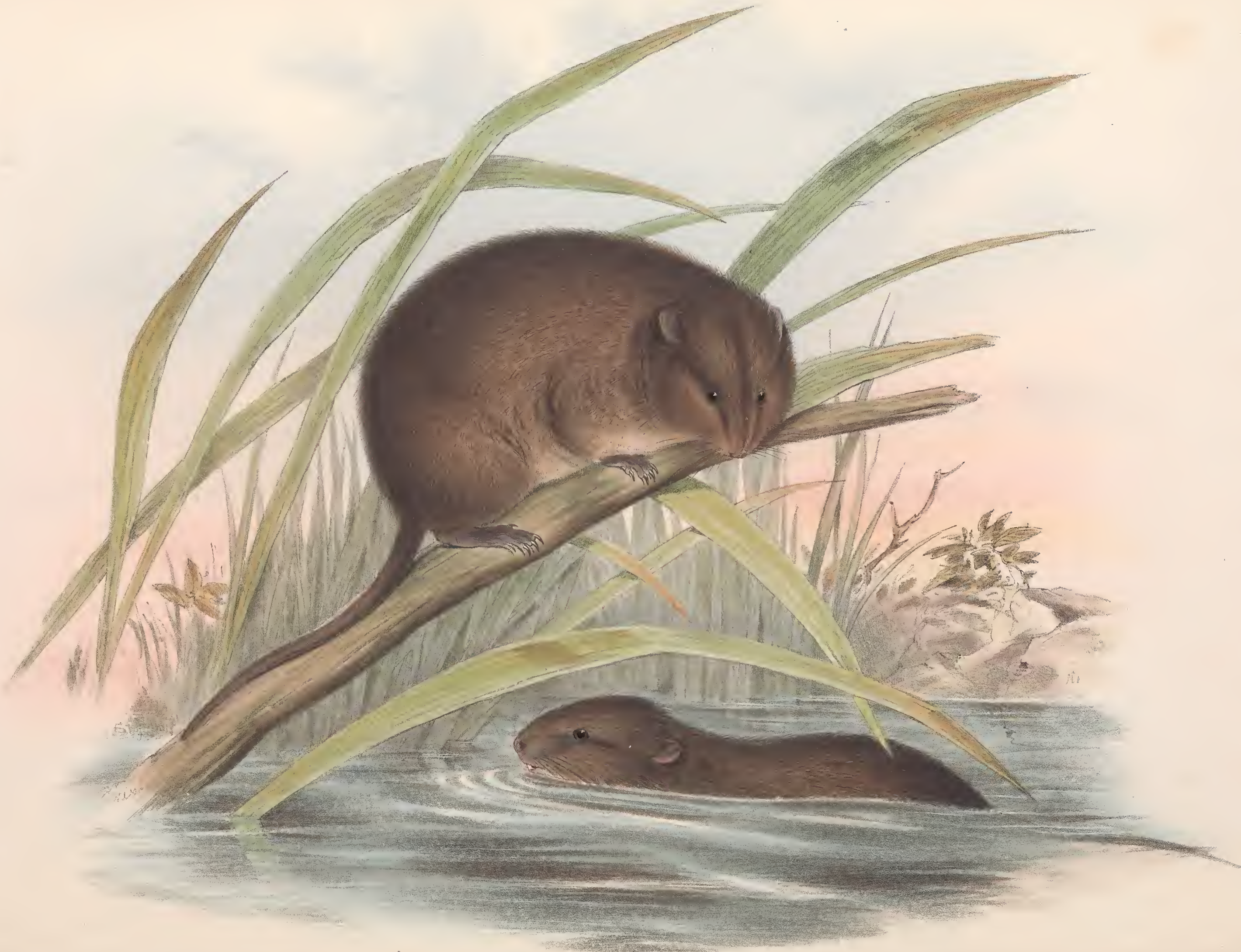
MUS FUSCIPES, Waterh.