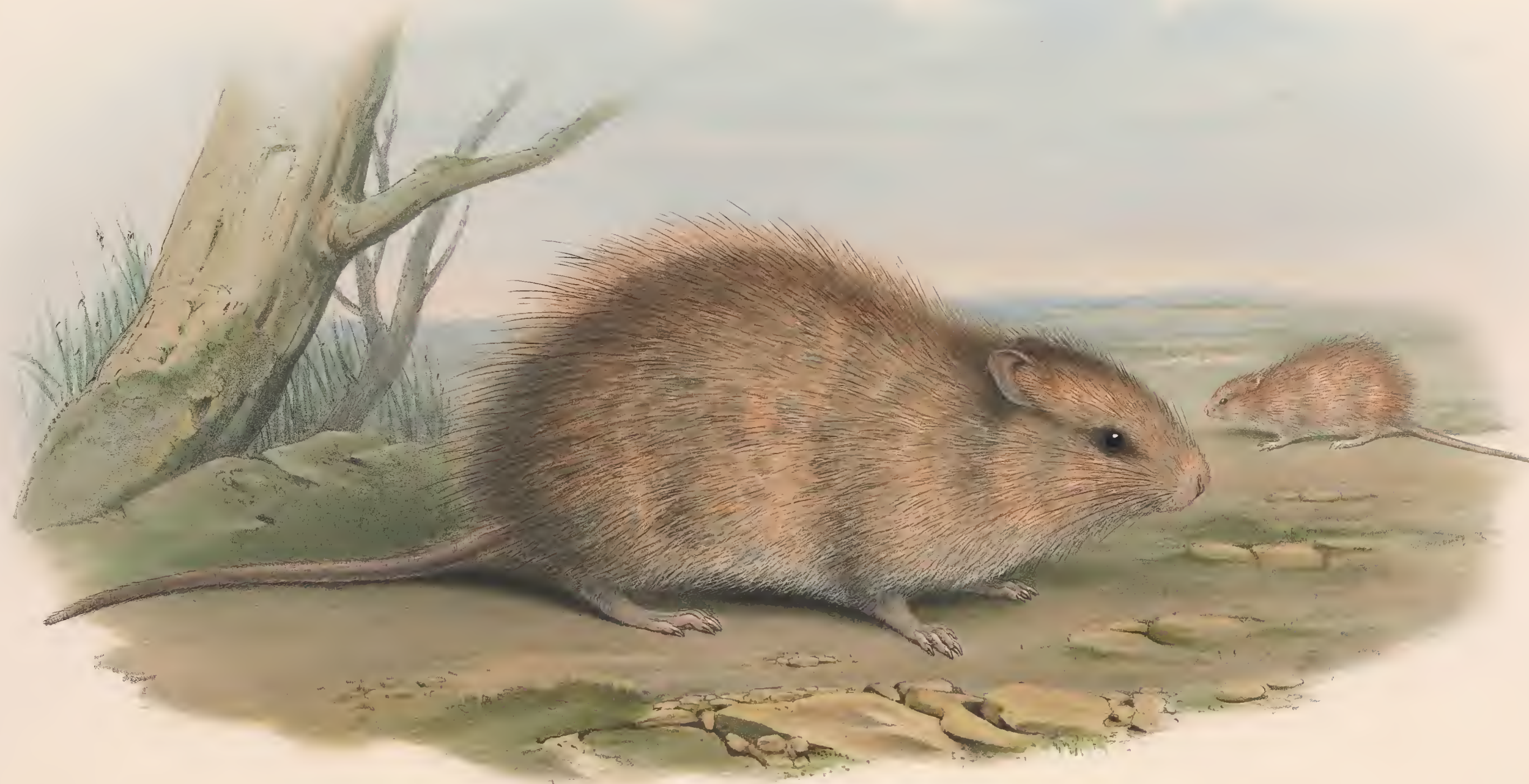
MUS VELLEROSUS, Gray