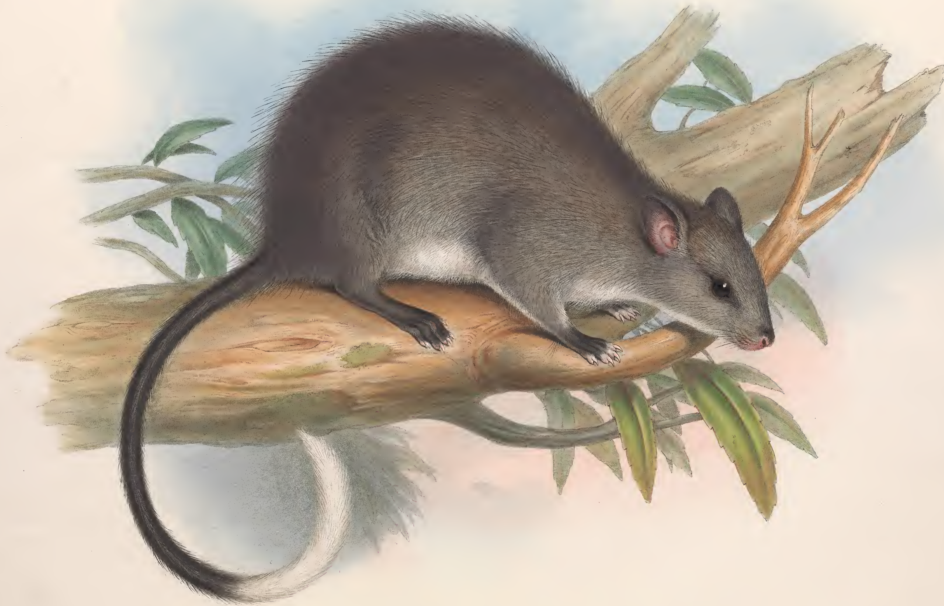
HAPALOTIS ? HIRSUTUS, Gould.