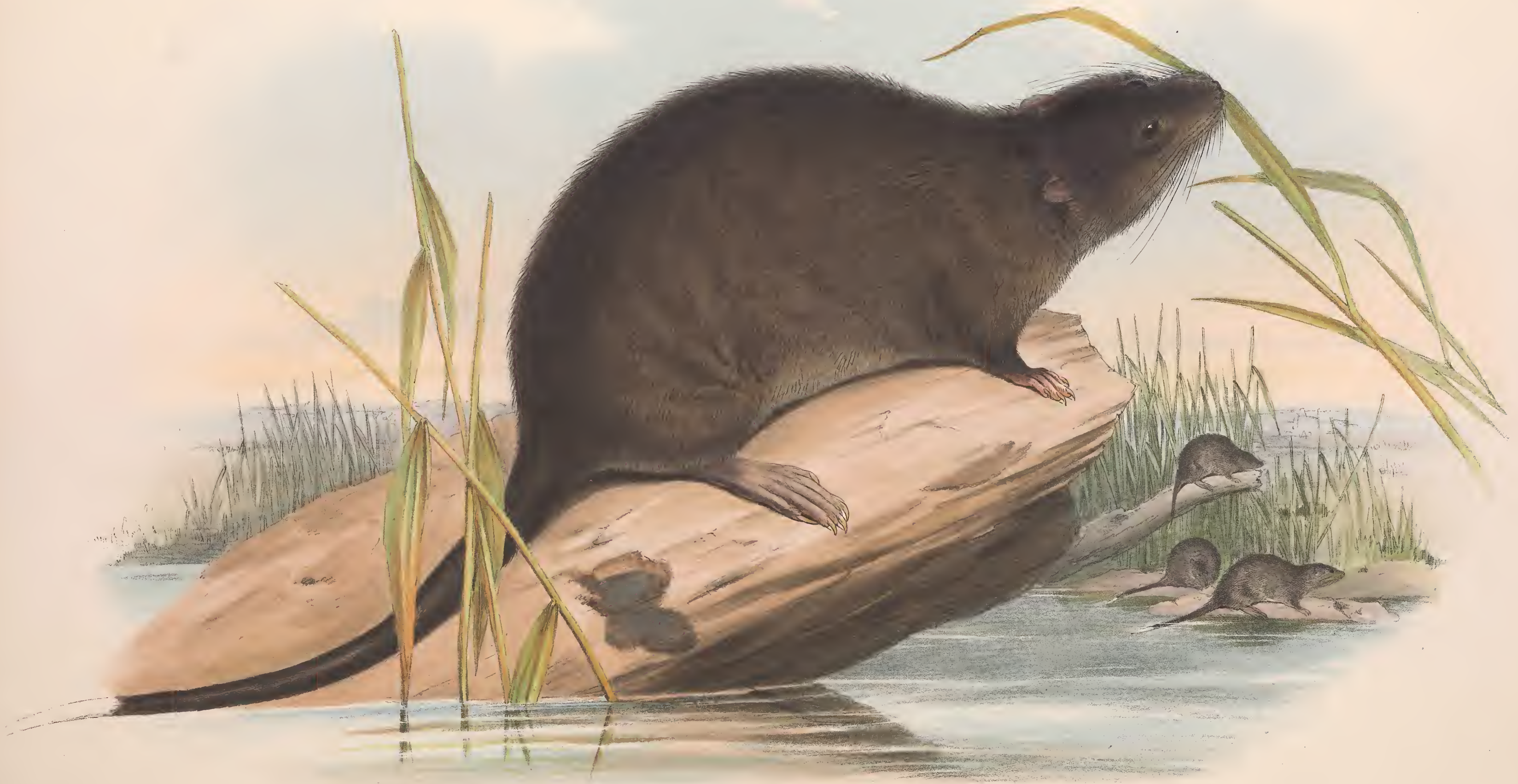
HYDROMYS PALMERI, NOSES. 1871