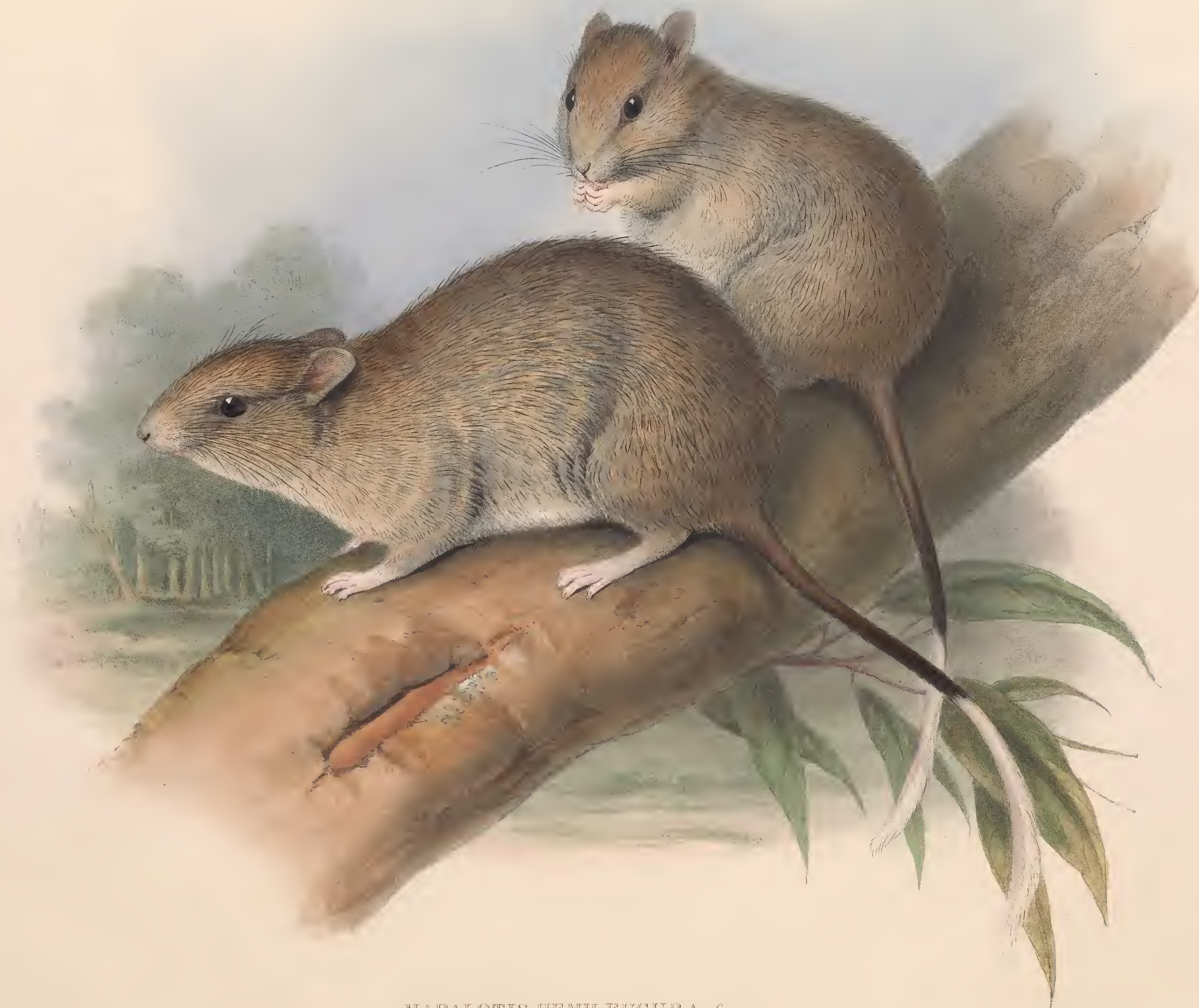
HAPALOTIS HEMILEUCURA, Gray