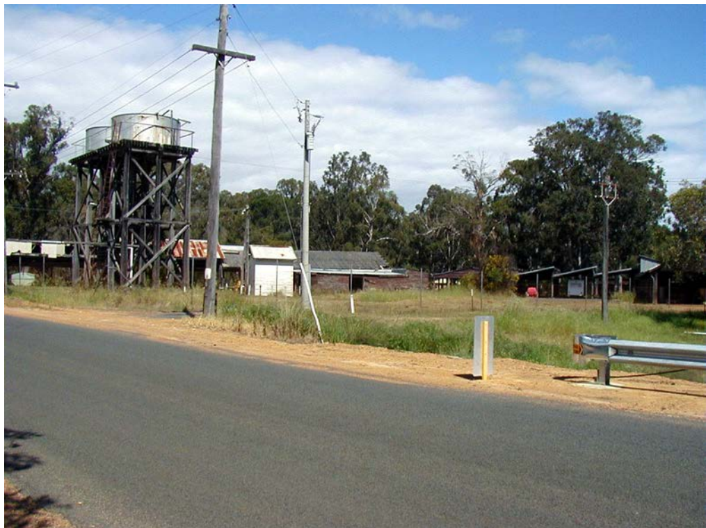
Photo 2 Western view to the Sawmill and Workshops from the bridge over the Ludlow River