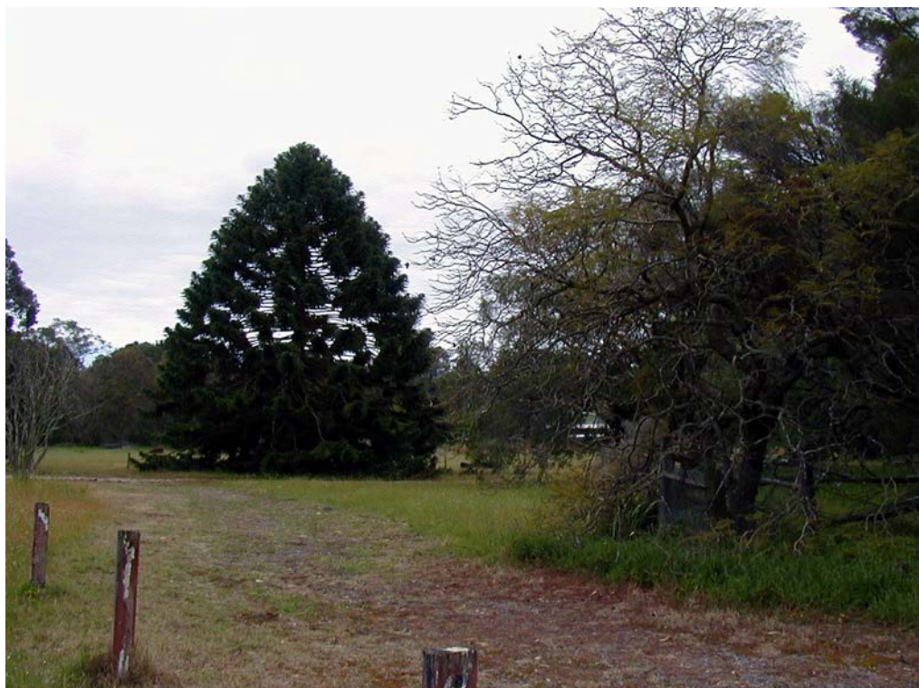
Photo 8 Hoop Pine near the former site of the 1921 Forestry School