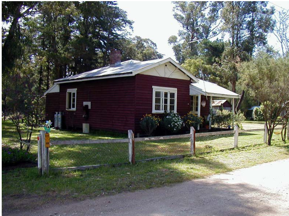
Photo 15 Building 852 - Forestry Cottage Type 8d [c1950] [Building 638 similar]