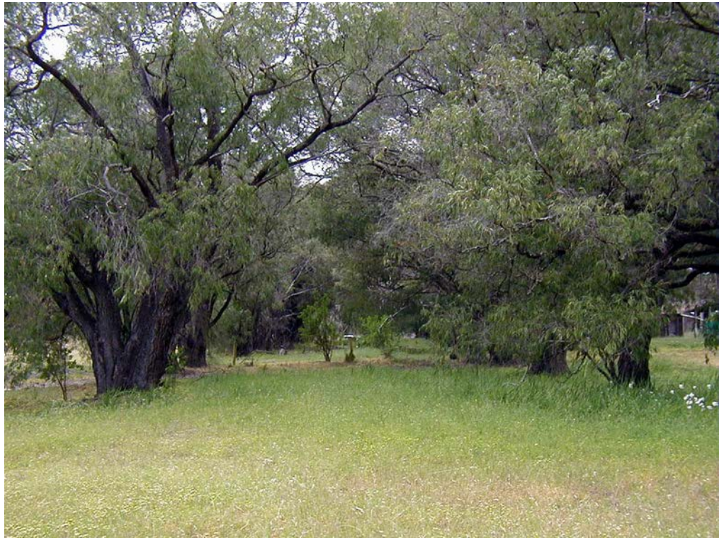
Photo 7 Avenue planting between the former site of the 1921 Forestry School and the Workshop area