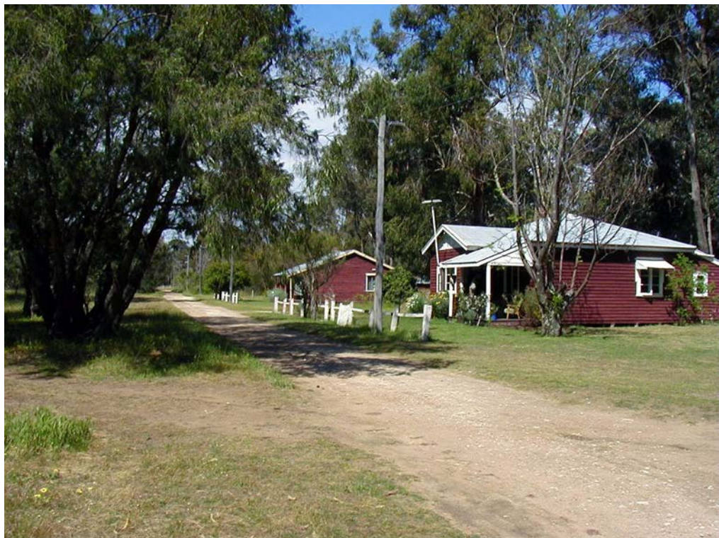
Photo 6 Access track to the North West Cottage Group