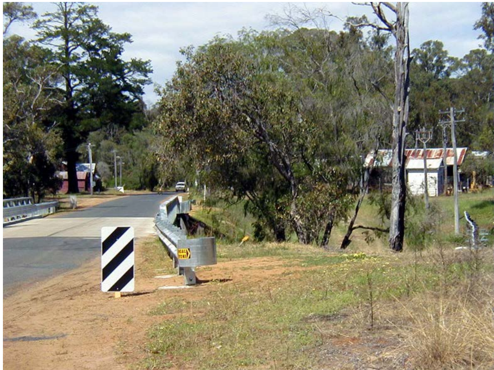
Photo 1 South-west view along Ludlow Road from the bridge over the Ludlow River