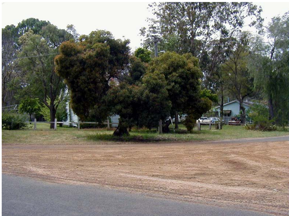
Photo 4 Junction between Ludlow Road and the access track to the South East Cottage Group