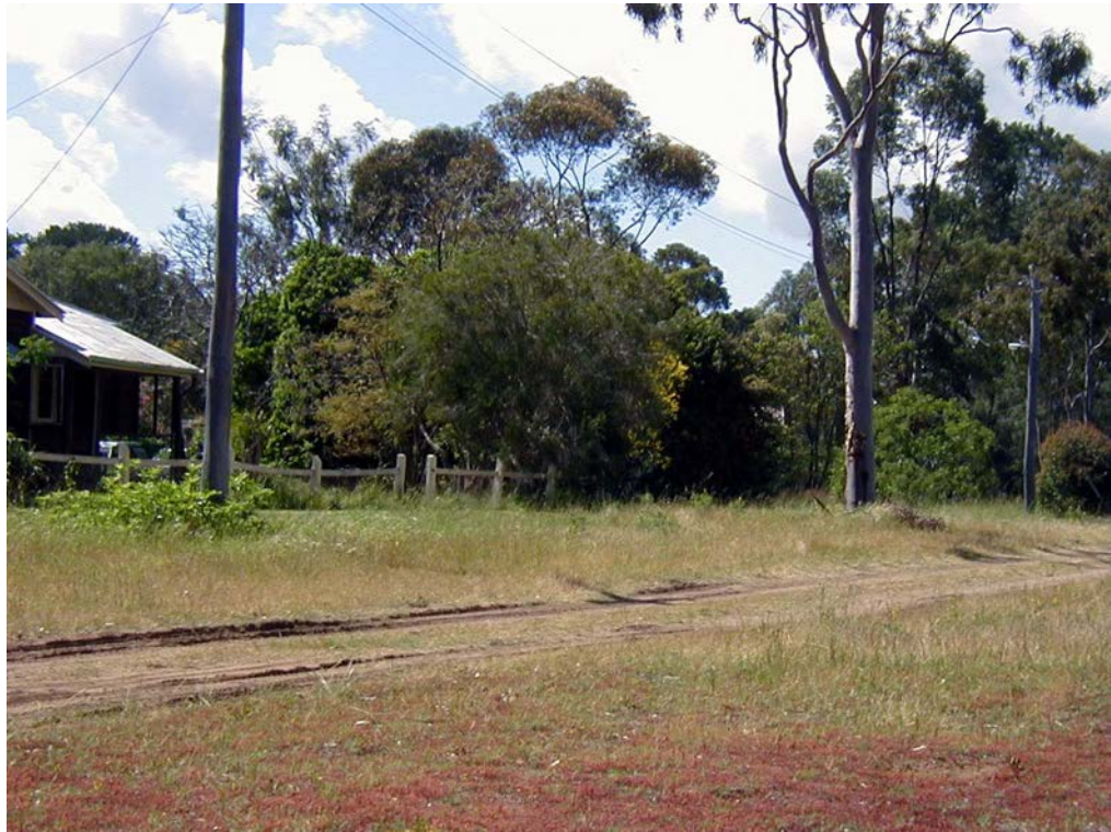
Photo 5 Access track to the North East Cottage Group