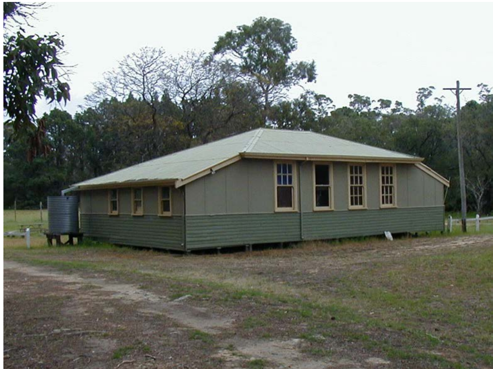
Photo 21 Building 2357 - Tuart House [undated - relocated to this site, post 1972]