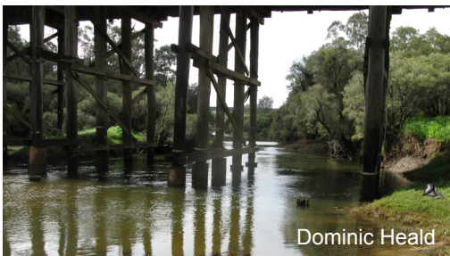
Sampling site at Great Northern Highway, August, 2012. Dominic Heald

Water quality samples are collected fortnightly near the Great Northern Highway to indicate the nutrient contribution from the Avon catchment. Note that the values determined may not represent nutrient concentrations in upstream tributaries. Flow is measured at the Department of Water and Environmental Regulation's gauging station located just downstream of Walyunga National Park.