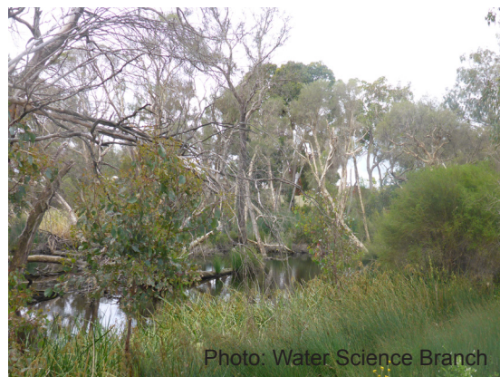
Living stream site on Bannister Creek, four years after restoration works, October 2016.

Water quality is monitored fortnightly at a site near the catchment's lower end close to Hybanthus Road, shortly before Bannister Creek flows into the Canning Estuary. Flows were recorded at this site between 1988 and 1993; however, since then only water quality has been monitored. The site is positioned to indicate what nutrients are leaving the catchment and entering the estuary. In 2007 a Department of Water and Environmental Regulation gauging station was constructed at Acacia Place in Lynwood.