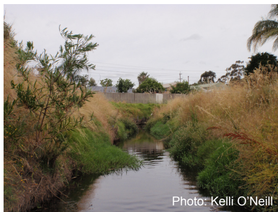
Bannister Creek is a drain along much of its length, like this section here. November 2012.