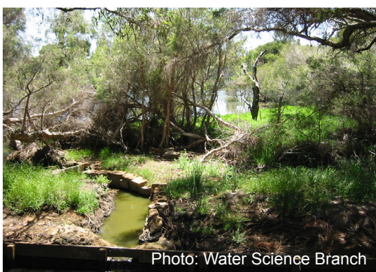
Outlet of Eric Singleton Bird Sanctuary, November 2015.