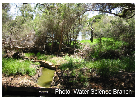
Outlet of Eric Singleton Bird Sanctuary, November 2015.