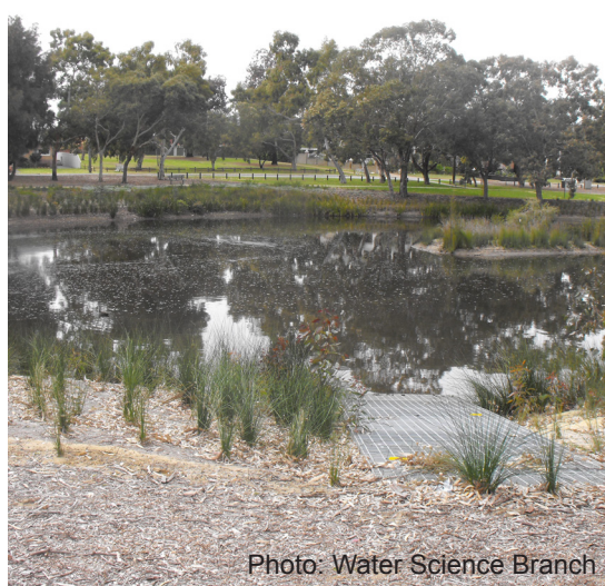
Revegetated urban wetland in Dog Swamp Reserve, August 2010.