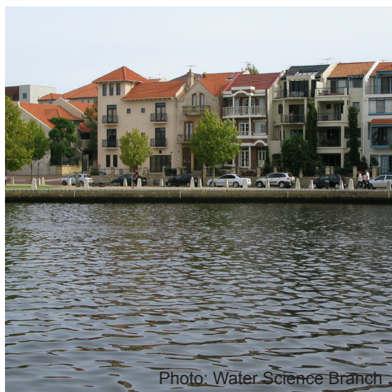
Houses in Claisebrook Cove, March 2010.