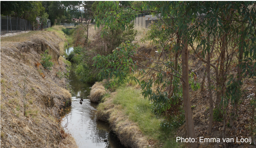
Helm Street Drain in Maddington, March 2016.