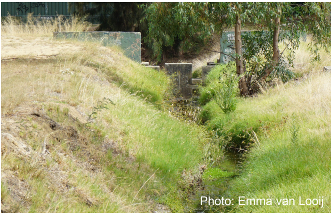
A flow control structure in Helm Street Drain, March 2016.