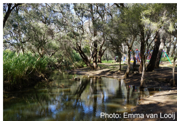
The Canning River in Kelmscott, August 2016.