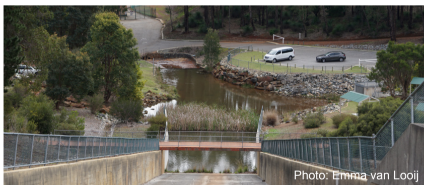
The spillway at Churchman Brook dam which is just upstream of the Upper Canning catchment, August 2017.