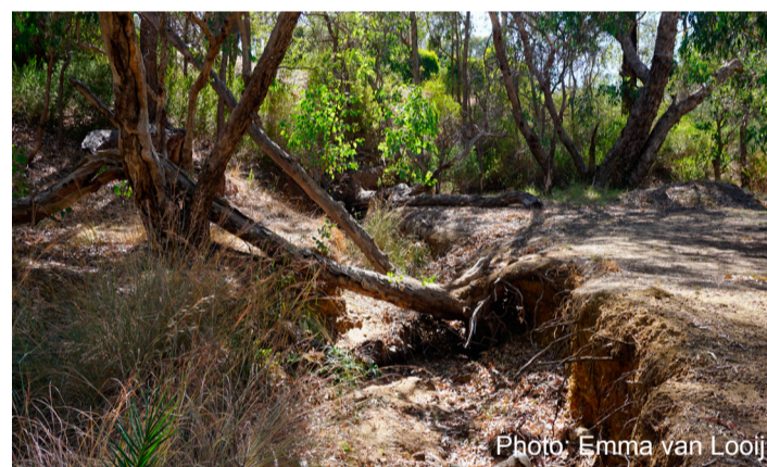
Poison Gully Creek in Maida Vale, March 2016