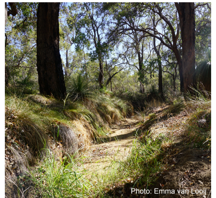
Crumpet Creek in Maida Vale, March, 2016.