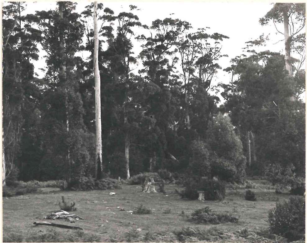
Potential field study centre site at SW corner of 7788 photo looking to SW at NP boundary

As above looking to West, with NP boundary to left. Note several tall karri trees at right on block