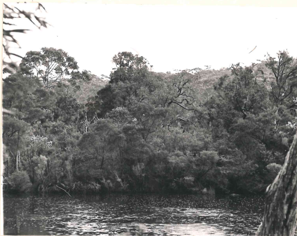
Looking north across a deep pool in Deep River, from track south of river in National Park between blocks 7788 and 1239