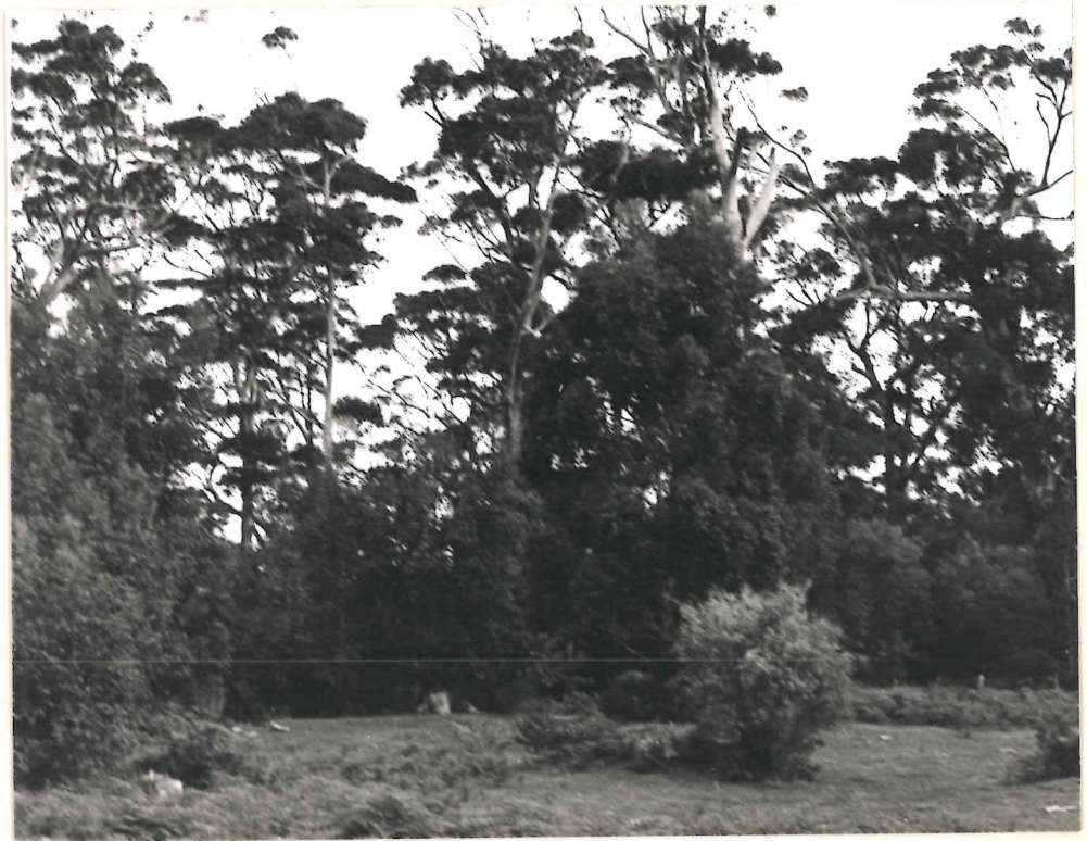
As above looking SSW at National Park boundary

Potential building site at SE corner of 7788. This view is to SE, with perennial stream to left of photo. The karri trees are inside the National Park, with a fence separating the partially cleared grazing land - this land at this point has several tall karri still present.