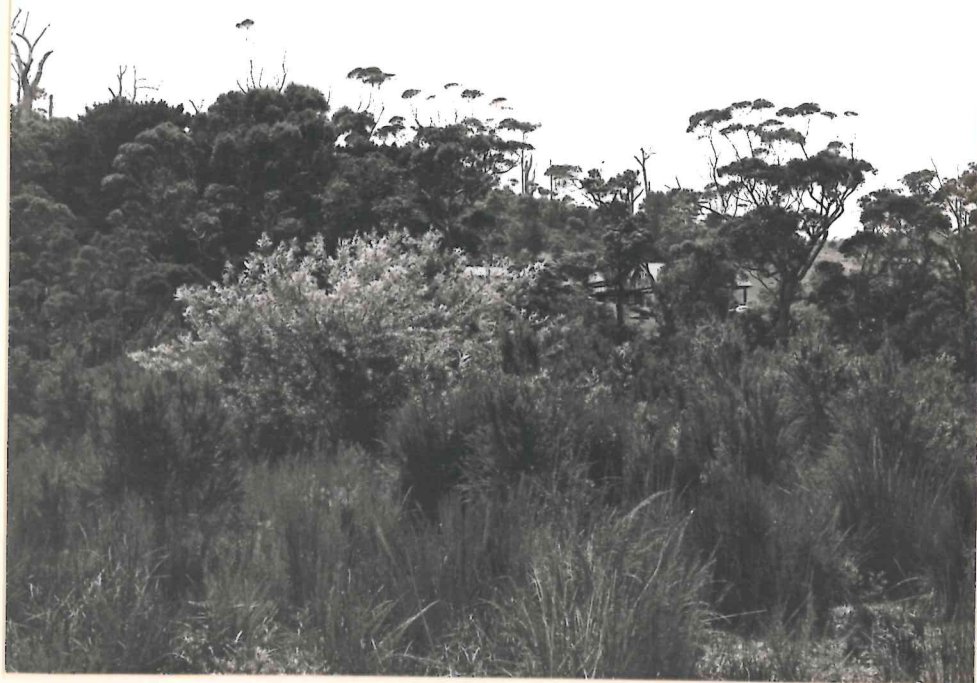
West of creek in 1239 (Proposed study area) looking NNE to Tinglewood Lodge, just across Deep River.

Looking NW from same location as above across the river. Foreground is grazed swampy area, with National Park karri and tingle in background.