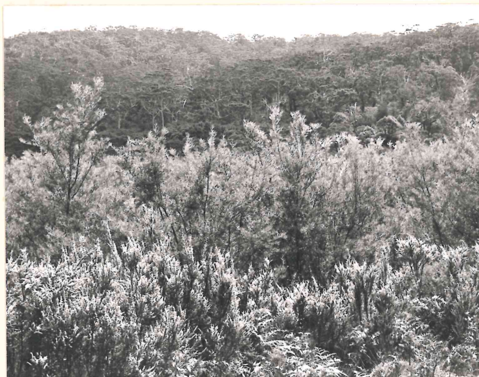
As above, looking NW at karri/tingle in National Park, across Deep River