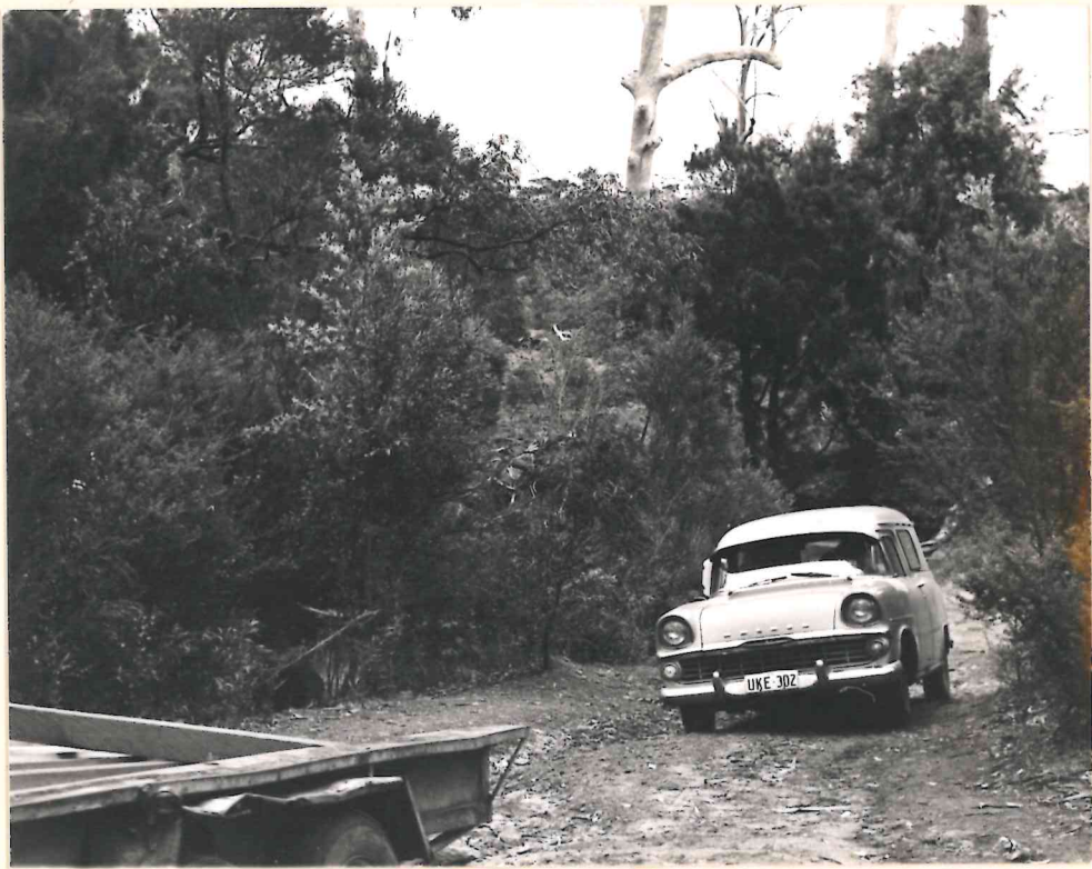
Bridge access into block 7788 at Tinglewood Rd/Shedley Dr pictures looking south across Deep River