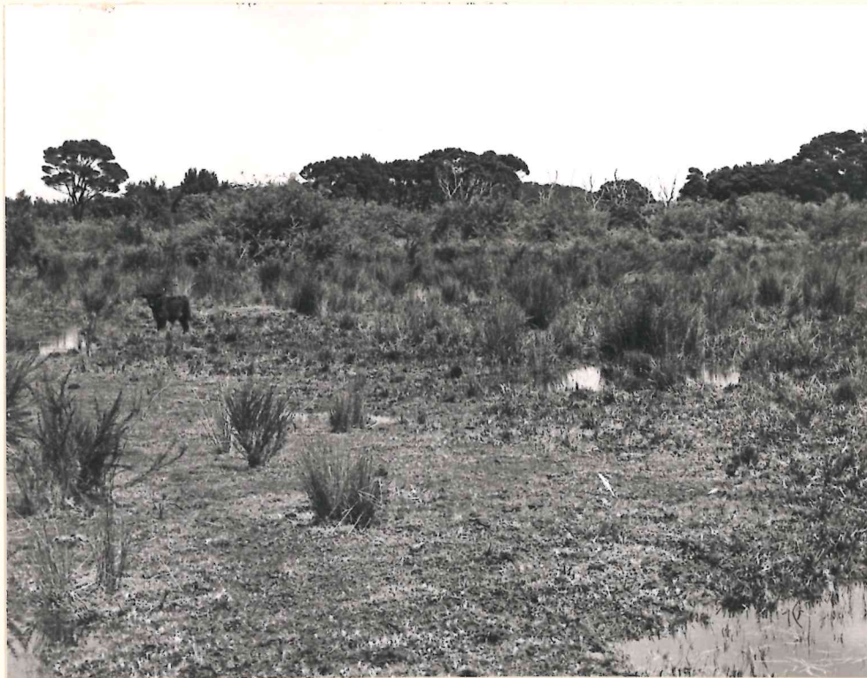
Looking SW from same location as 30/31, with grazed swampy area in foreground, and Melaleuca swamp to the right.