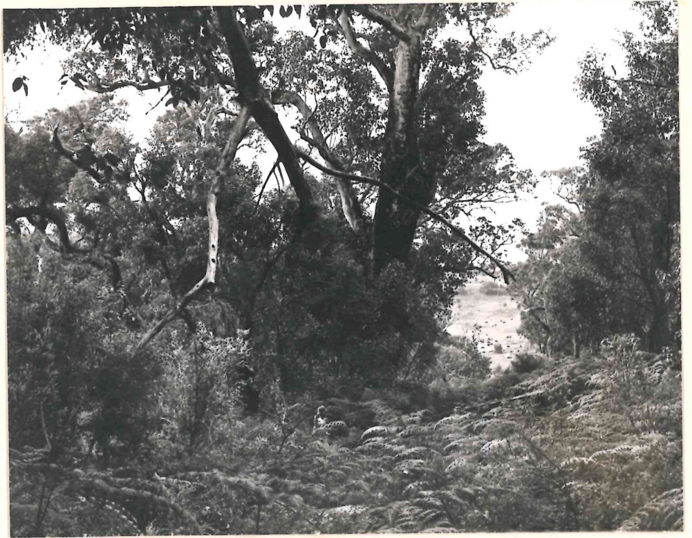
Eastern boundary of 1239. North of karri regrowth stand, trees now marri. These photos looking north to river and cleared land. Top one to left is block 1239, bottom one to right is National Park land.