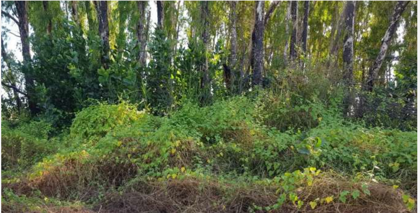
Figure 1. Invasion of the weed Passiflora foetida at BIGS02 following a fire in 2017-18.

in the spring. A single plant of Mimosa sp. was also recorded along the eastern fenceline of the spring in 2019 and was immediately cut stumped (pers. comm. [REDACTED] 1 ).