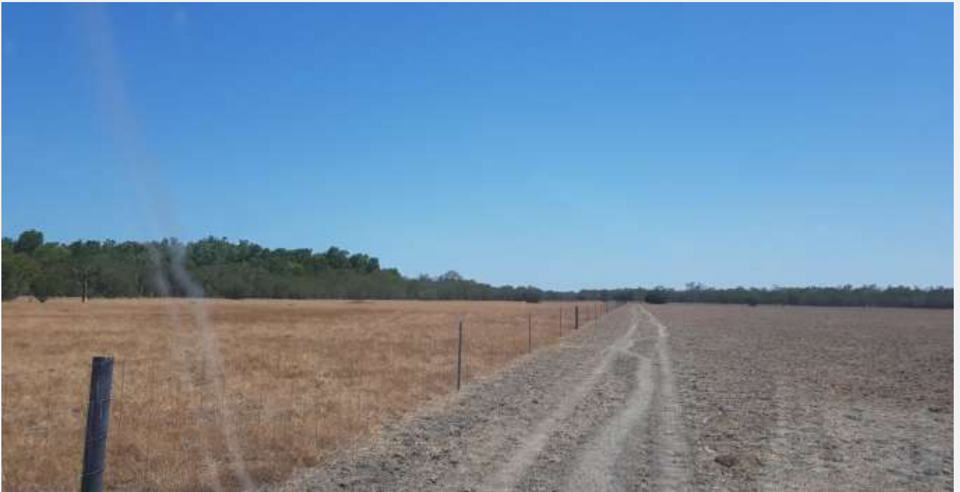
Figure 2. Contrast of effects of cattle with Big spring community to the left of the fence and the area to the right where cattle can access.