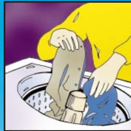
Wash only full machine loads