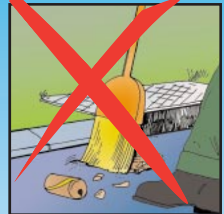
Compost all garden and kitchen vegetable waste and do not sweep or hose down drains

Polluted water is dangerous for birds, aquatic plants, animals and people. We all have a part to play in making our waterways healthier.