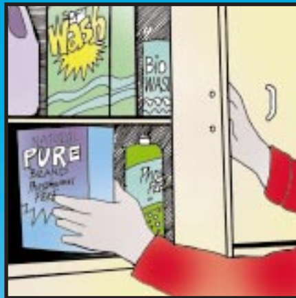
Use a NO phosphorus washing detergent