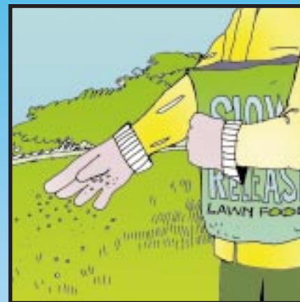
Fertilise lawns, greens and gardens sparingly