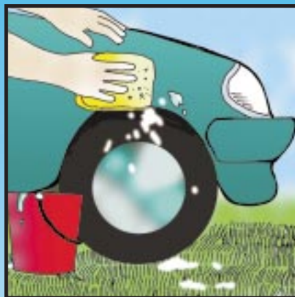
Wash vehicles on a porous surface so the water does not run into drains or gutters