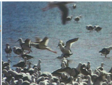
Several birds with partial breast band observed mating.