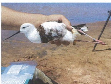
~10% of the nesting stilts had partial breastbands