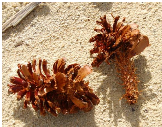
Figure 3: Feeding traces of pine cones discarded from Carnaby's Black-Cockatoos at Gnangara Pine Plantation.

In the mid to late 1960's a study was conducted by the Division of Wildlife Research, CSIRO to examine the extent of damage to pine plantations in a number of plantations around Perth including the Gnangara plantation (Saunders 1974b). This work showed that Carnaby's Black-Cockatoo were most active in the pine plantations in a seasonal manner, typically moving into the Perth metropolitan pine plantations in January, and departing them in April, May or June (depending on the plantation; Saunders 1974b). In the Somerville plantation, the average monthly total of eaten pine cones varied from 2,500 in March to less than 250 in June. While in the Gnangara Plantation, the monthly average of eaten pine cones was greatest in June (> 1000 eaten cones) and lowest in November (< 250). The mid-year increase in activity in the Gnangara Plantation was attributed to additional flocks moving to Gnangara after stripping the plantation closer to the city (e.g. Somerville; Saunders 1974b). In addition, this study also recorded a higher number of eaten pine cones in areas with trees of 16 – 20 years, possibly because there are more of them than the older trees which have undergone thinning and trimming, producing less cones (Saunders 1974b).