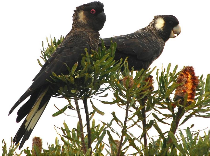
Figure 1. Carnaby's Black-Cockatoo ( Calyptorhynchus latirostris ) on Banksia attenuata . Male on left – note pink-red eye-ring, dark bill and off-white cheek patch. Female on right – note dark eye-ring, pale bill and distinct white cheek patch.