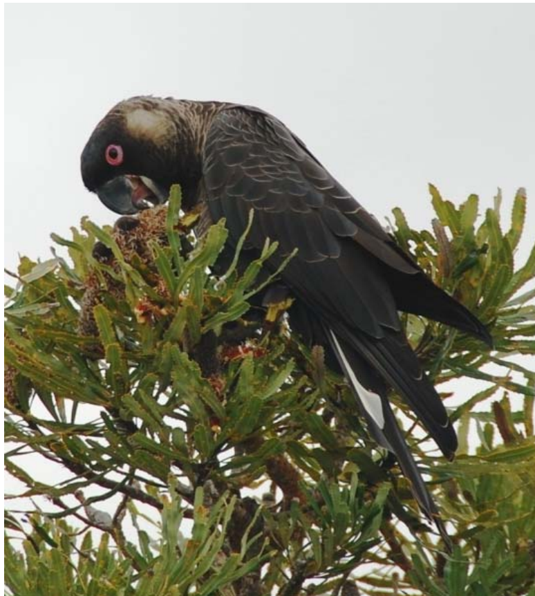
Figure 2. Male Carnaby's Black-Cockatoo feeding on seeds from Banksia attenuata .

Carnaby's Black-Cockatoo have been predominantly observed foraging on the seeds of 52 native species (Table 1). By far the most common native plant species Carnaby's Black-Cockatoo have been observed foraging upon include the Banksia (including Dryandra species), Hakea , Grevillea , Allocasuarina and Eucalyptus (Carnaby 1948; Saunders 1974a, 1974b, 1980; Higgins 1999). On the Swan Coastal Plain, identified important native food plants include Banksia attenuata , B. menziesii , B. grandis , B. ilicifolia , B. sessilis , B. prionotes , Corymbia calophylla and Eucalyptus marginata (Saunders 1980; Shah 2006; Weerheim 2008). Indeed, Banksia species (especially B. attenuata ) contributed nearly 50% of native plant foraging records (Figure 2), with an additional 15% of records from Marri C. calophylla (Shah 2006).