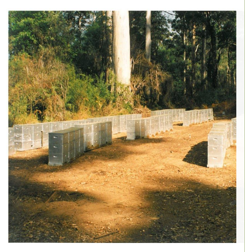
Bee hives in the Karri Forest

Property Unit, Department of Parks and Wildlife (DPaW) July 2013