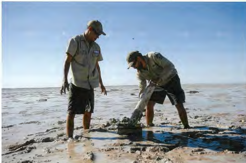
Above: Yawuru rangers sampling for benthic invertebrates, Yawuru Nagulagun / Roebuck Bay Marine Park.

This review finds that the 2011 amendments to the CALM Act are appropriate to achieve the policy objectives to facilitate joint management of CALM Act lands and waters; to enshrine the rights for Aboriginal customary activities and traditions on these lands and waters; and to protect and conserve the values of the land for Aboriginal culture and heritage. Furthermore, the 2011 amendments have assisted with the effective resolution of competing demands for establishing a comprehensive, adequate and representative national reserve system in WA in accordance with Australia's international treaty obligations, together with the recognition and determination of native title in favour of Aboriginal traditional owners.