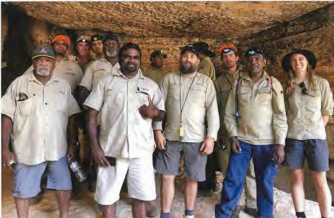
Above: Aboriginal rangers on a visit to East Kimberley District to share information and experiences.

There are a range of methodologies to track the impact of Aboriginal ranger programs across several portfolios. The Social Return on Investment (SROI) methodology employed by Social Ventures Australia (SVA) is an internationally recognised methodology used to understand, measure or estimate and value the impact of a program or organisation. It is a form of cost-benefit analysis that examines the social, economic, cultural and environmental outcomes created and the costs of creating them. The impacts and benefits of Aboriginal ranger programs associated with DBCA’s formal joint management arrangements are yet to be assessed using this methodology, however the benefits of other programs in WA have been documented.