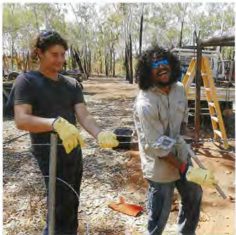
Above: MG Rangers working on a fencing project.

It is common for Aboriginal and non-Aboriginal staff and traditional owners involved in joint management to suffer from burnout as they operate in what