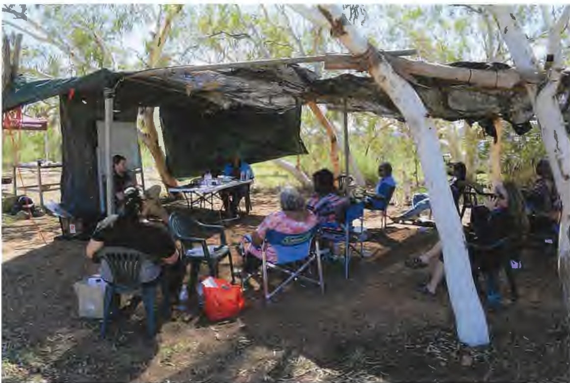
Above: Murujuga Joint Management Officer making a presentation to Elders at an on-country meeting, Murujuga National Park.

Some JMB or park council meetings are held on country which helps strengthen relationships and has the benefit of providing an atmosphere where traditional owners are more comfortable talking, compared with a conventional meeting room setting. DBCA staff and joint management partners both indicated a desire to facilitate more on-country meetings, emphasising that they also helped JMB and park council members to spend time in the parks and reserves that they are jointly managing. However, on-country meetings are costly and organising them can take substantial time and the logistics can be difficult to arrange. Organisational and logistical responsibilities generally rest with the department.