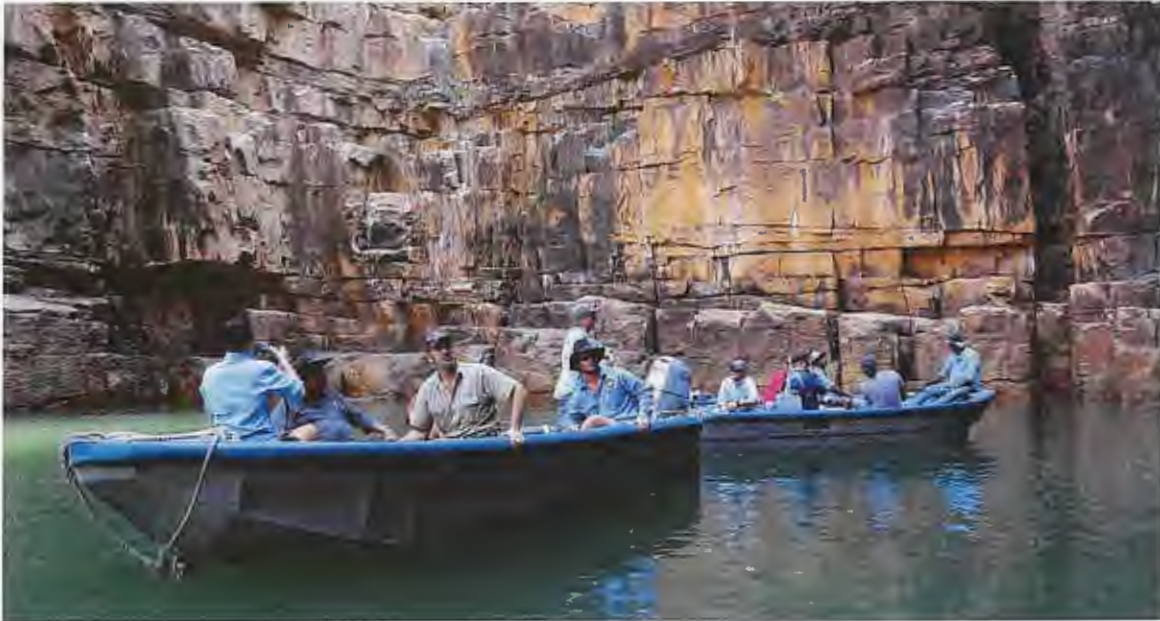
Above: Balanggarra traditional owners, DBCA planners and scientists on country together as part of the planning process for the North Kimberley Marine Park.

will be implemented, monitored and assessed. The intent is for Aboriginal partners to determine whether the relevant targets in management plans are being met, but there may be a need for DBCA to explore opportunities to engage experts in cultural research for guidance and advice.