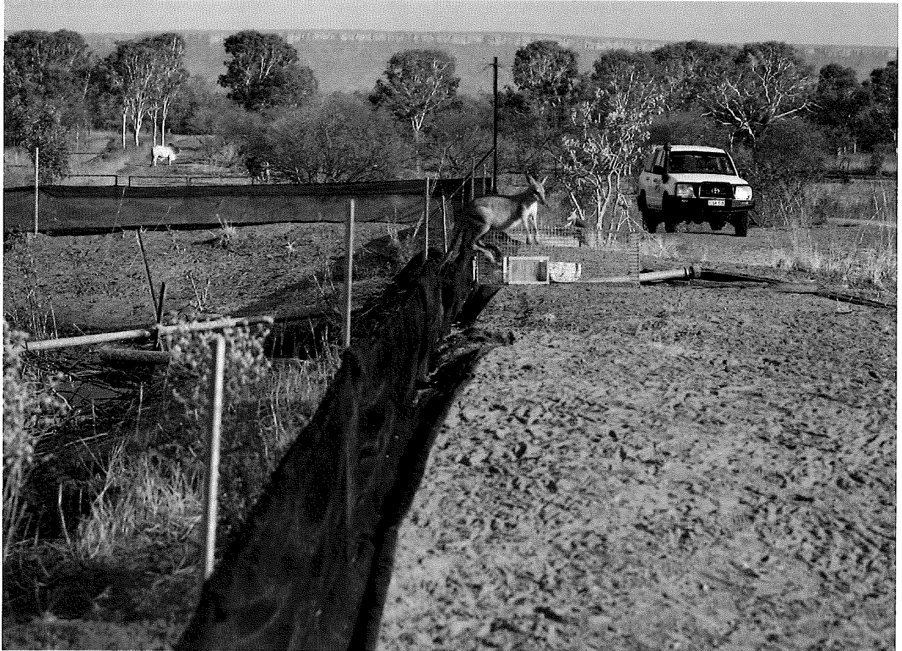
Agile Wallaby finds toad proof fence no barrier – Great Toad Muster October 2007