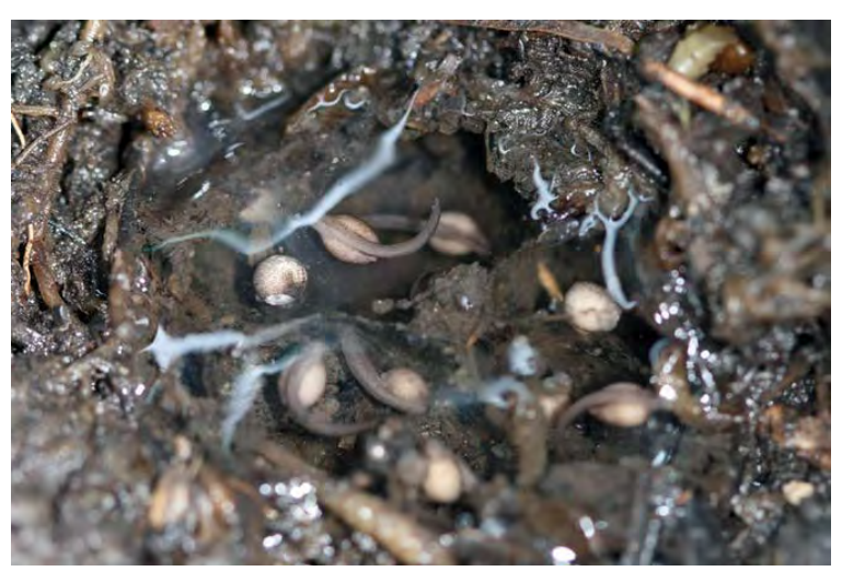
White-bellied Frog tadpoles never leave the nest Perth Zoo

from grazing, which destroys the seepages, and vineyards, which alter water supplies through damming.