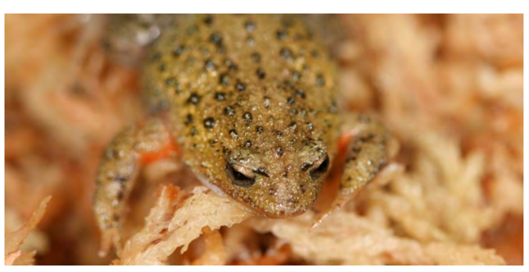
The tiny White-bellied Frog lives in the swamps of south-west Australia.

SENIOR RESEARCH OFFICER (ION PROBE/SIMS) (REF: 492601) CENTRE FOR MICROSCOPY,