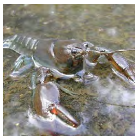
29 August 2013 Australian endangered species: Leckie's Crayfish

3 September 2013 No need for ears — Gardiner's frogs hear with their mouths