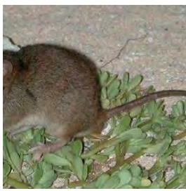
12 September 2013 Australian endangered species: Bramble Cay Melomys

Illegal marijuana crops , which use the same wet soils as the frogs, have also disturbed the habitat. Adding chemicals and nutrients through fertilisers disrupts the growth and development of the frogs. Other agricultural impacts come