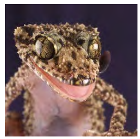
22 August 2013 Australian endangered species: Gulbaru Gecko