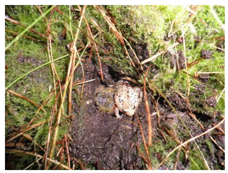
A frog released back into the wild Perth Zoo

Fire is currently excluded from land managed by the Western Australian government, but proper fire management must eventually include burnoffs. Fortunately it appears the frogs can tolerate fire. Experiments show that even if fire reduces numbers locally they do eventually recover.