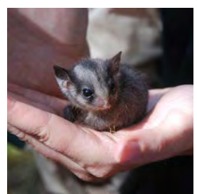
21 August 2013 Let's put threatened species on the election agenda