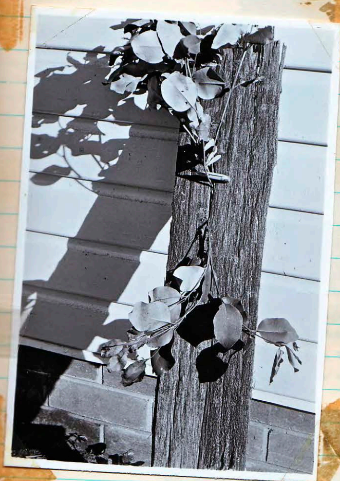
5. Karri epicormic shoot. pulled away by defoliating bark - note size and number.