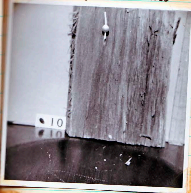
19. As for '10'