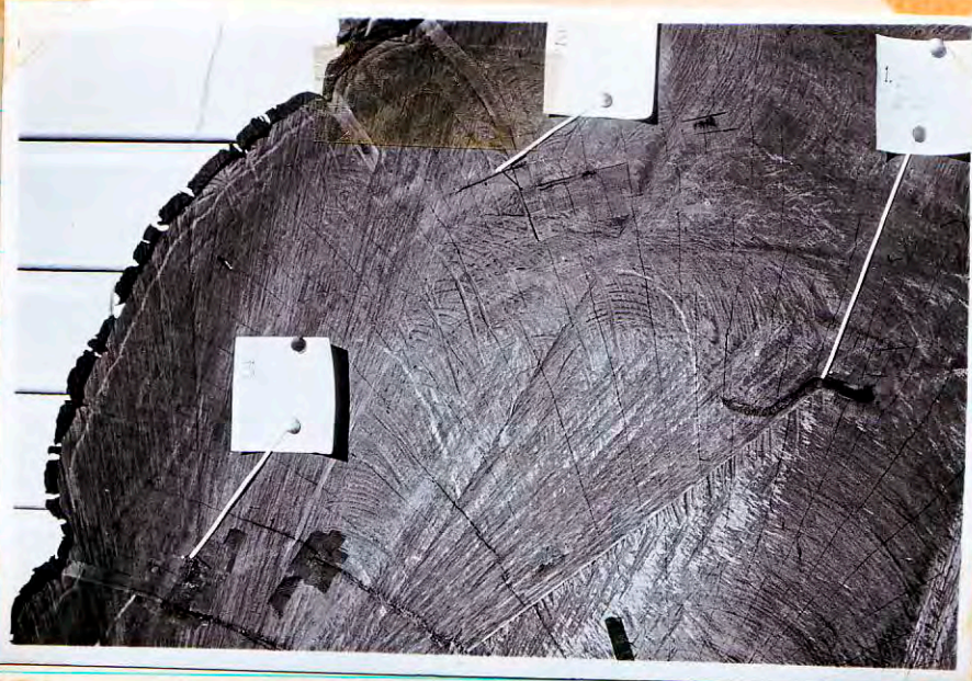
8. Karri section showing a) larvae attack age 10 b) Gum vein without rot age 170 yrs c) Gum vein with rot age 190 yrs