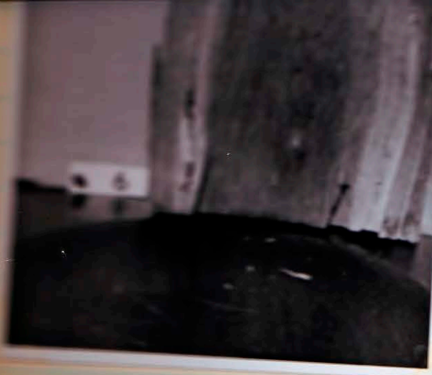
15. As for 15.