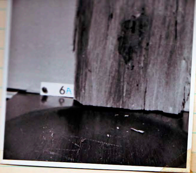
16. As for '7'.