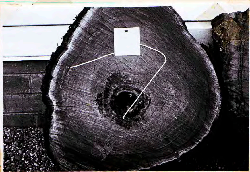
9. Jarrah section showing a) defect due to suppression b) defect due to fire damage most likely.