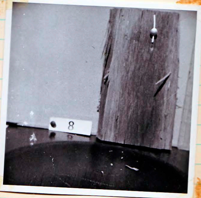
18. As for '10'.