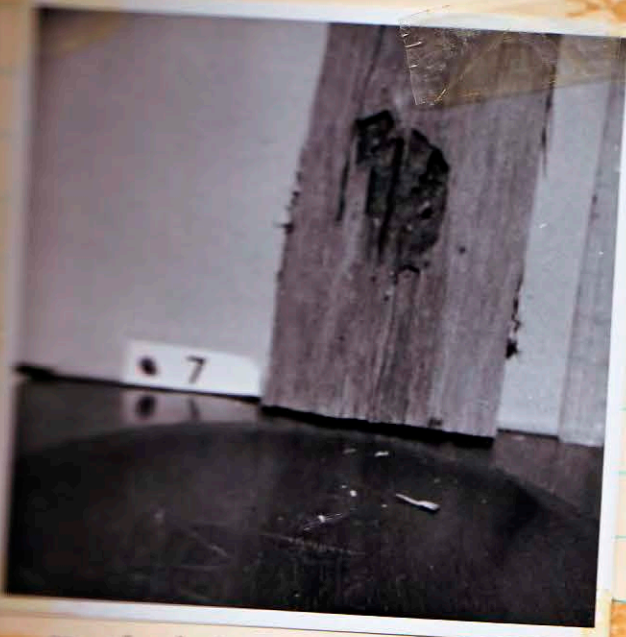
17. Nest of possibly Kalotern behind epicormic shoot