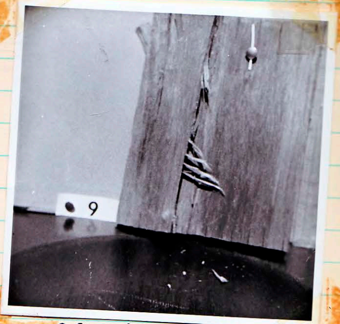
20. Bud strand trace (arrowed) which gave rise to epicormic shoot as seen in '1'.