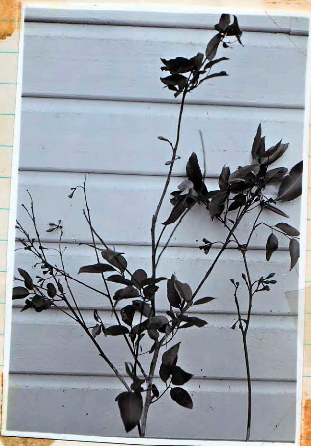
6. Karri epicormic shoot with pre-fire leaves and fruiting vessels.