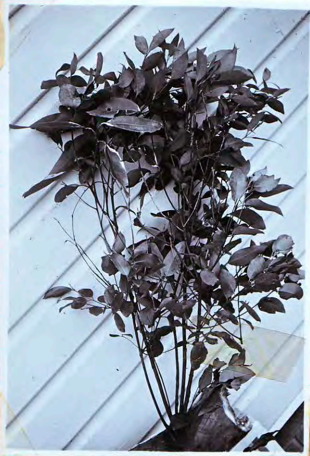
1. Karri epicormic shoots of two ages from lower crown branch. CROWEA BLOCK