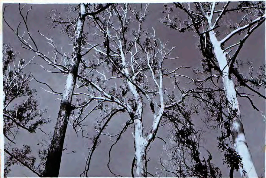
3. Tree N° 410 with dead crown. Plot N° 10 CAREY BLOCK.