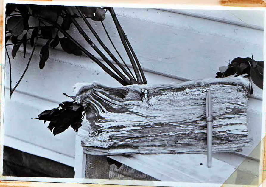
Rot behind epicormic shoot in lower crown branch CROWEA BLOCK.