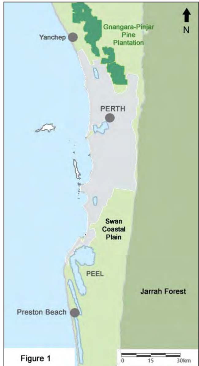
Figure 1: The Perth and Peel portions of the Swan Coastal Plain, showing the location of the original extent of the Gnangara-Pinjar pine plantation (dark green) and the approximate urban extent (grey).

This report is intended to inform EIA under Part IV of the Environmental Protection Act 1986 (EP Act). However, the information included in this report is equally relevant to other decision makers, such as those assessing native vegetation clearing permits under Part V of the EP Act.