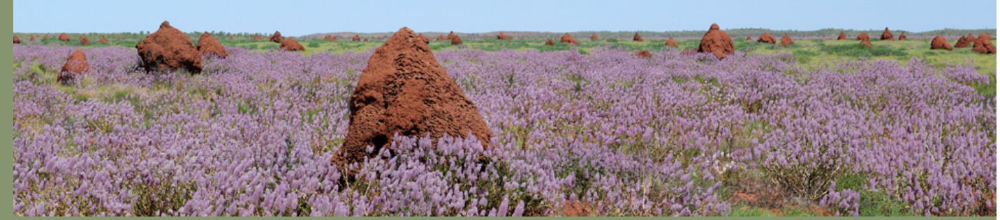
A mass of Ptilotus exaltatus with termite mounds near Onslow.