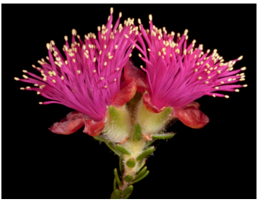
Eremaea or Melaleuca ?

If you want to borrow a plant press from the WA Herbarium this Spring, please send a request to Karina Knight immediately. Stocks are running low and we are unlikely to be able to accommodate last minute requests!