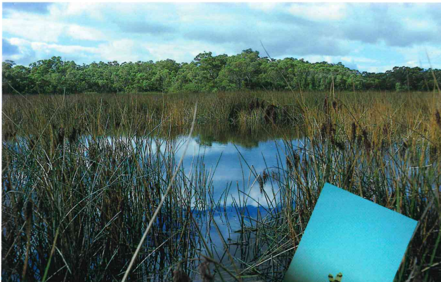
Fringing vegetation at the northern end of Loch McNess.

In the past, inappropriate land use has led to conditions highly favourable to midges, and the huge numbers which emerge from lakes during summer cause significant nuisance problems for nearby residents. The use of chemical control agents is undesirable from certain perspectives, but with measures such as light traps it is currently the only effective means of controlling the number of midges which reach residential areas. Long-term midge control requires that the water quality of wetlands be considerably improved. Hopefully, this process will hopefully be accelerated by fundamental changes in our perceptions of the value of those wetlands and just how far we are prepared to go to preserve them. □