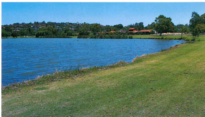
Jackadder Lake - the original fringing vegetation has been replaced by steep banks and lawns, resulting in low densities of midge predators.