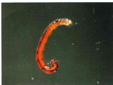
Nymphs of the dragonfly Hemianax papuensis which occur in the urban wetlands are natural predators of midge larvae.