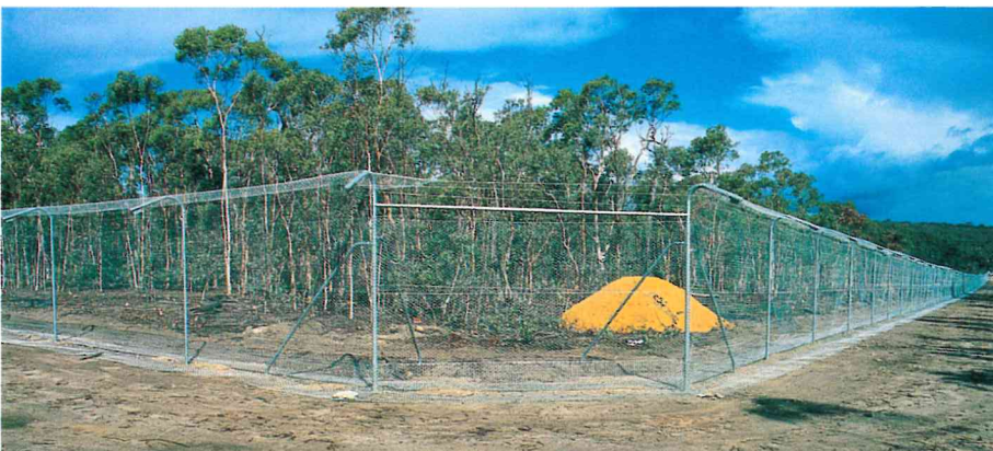
Below: The captive breeding enclosure at Dryandra will breed animals for release into the Wheatbelt region.