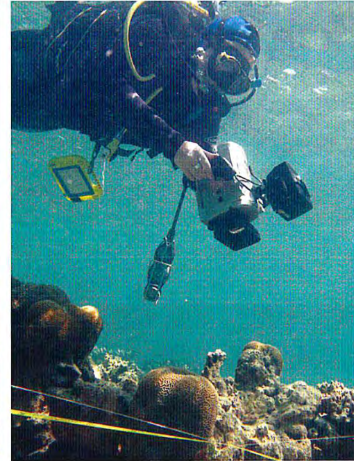
Above left Flatback turtle.