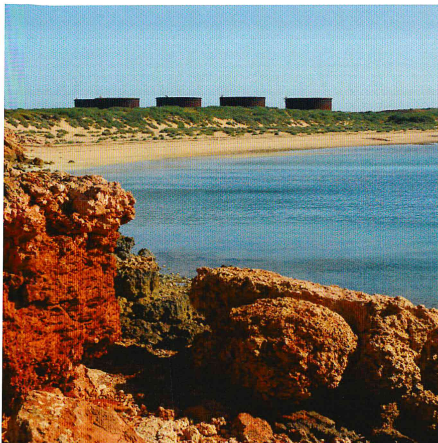
Left Oil storage tanks on the east coast of Barrow Island. This beach is one of the main flatback turtle nesting sites.