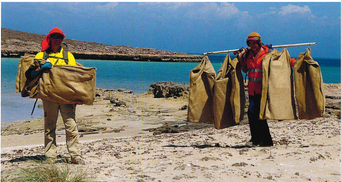
Above DEC staff carry cage traps with animals for release on Hermite Island.