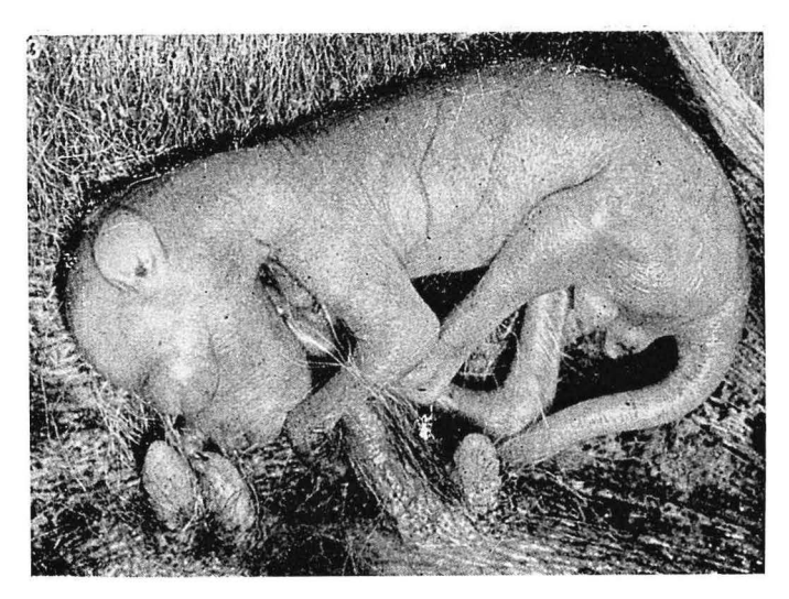
A fifty day old Red Kangaroo in the pouch