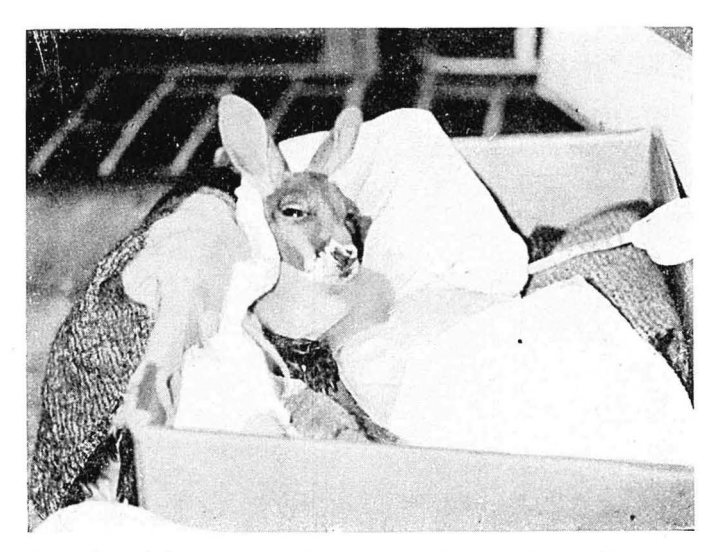
A cardboard box, rugs and an electric blanket keep this young "Red" warm.

The presence of teeth does not mean that solids are required, but as soon as the joey starts to explore and show interest in its surroundings, it should be given the opportunity to eat adult fare. It is a good idea to include in its bedding dry or green grass—this gives the joey the opportunity to nibble if it feels inclined. Joeys can be fed on the following solids: green grass, rose pedals and leaves, fruit tree leaves, loquat leaves, maiden hair fern, dates, seeded raisins, apples, carrots, bananas, cereals, macaroni or bread. Make sure that the leaves and grass have not been sprayed with poison. Grass should be included as much as possible.