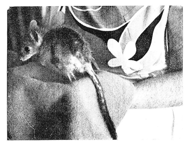
Bald areas around the tail of this Rat Kangaroo are treated with Baby Oil.