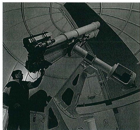
Astrographic Telescope. COVER: 61cm telescope dome.

Telephone the Observatory on (09) 293 8255 between 8:30am and 4:30pm (Monday to Friday) to enquire about details and charges.