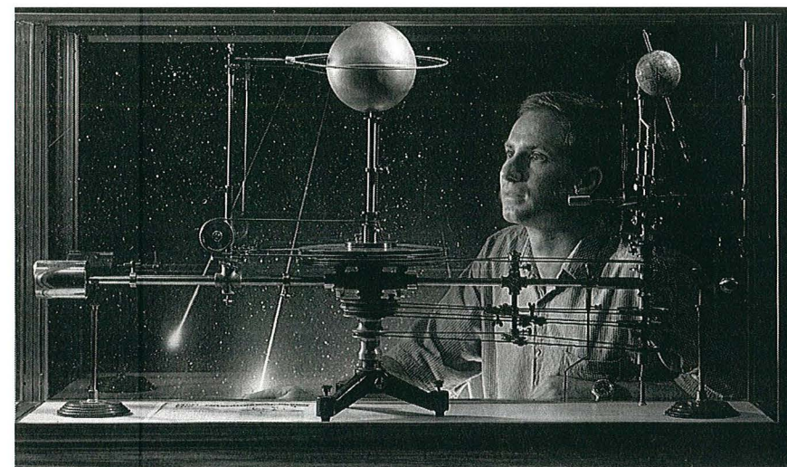
Orrey instrument.