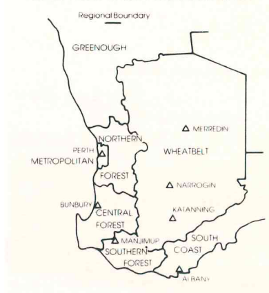
CALM REGIONS IN THE SOUTHWEST

Warren Road NANNUP 6275 Phone (097) 561 101 Fax 561 242