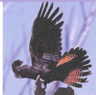
Red-tailed black cockatoo

Additions to Mt Frankland, Mt Lindesay, and Mt Roe National Parks View of forests north of Mt Frankland