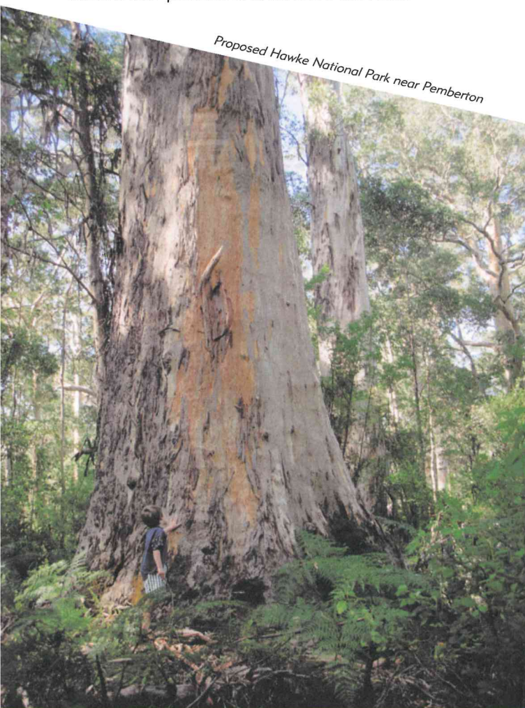
Proposed Hawke National Park near Pemberton

Adding value Fine detail of jarrah writing desk with ebony inlays